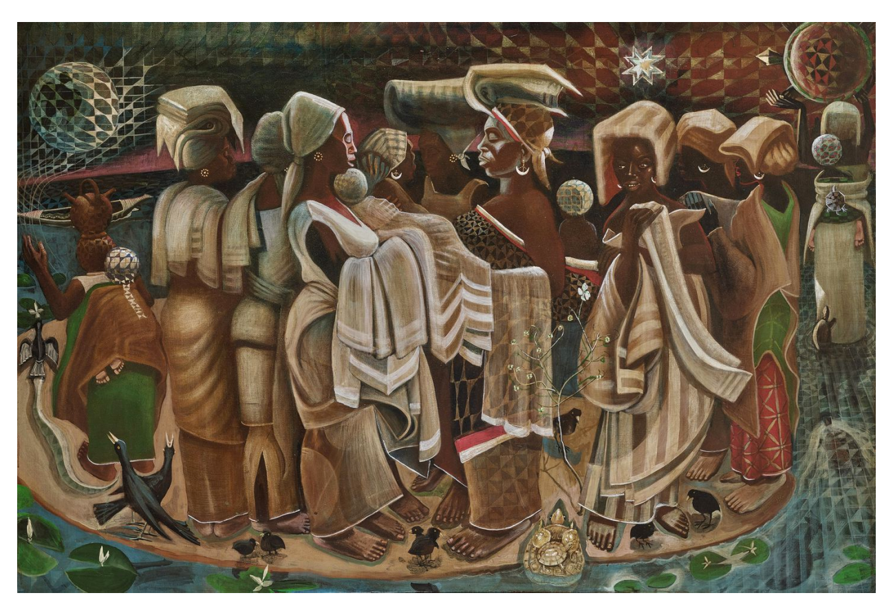
John Biggers's "Band of Angels: Weaving the Seventh Word" from 1992-93.