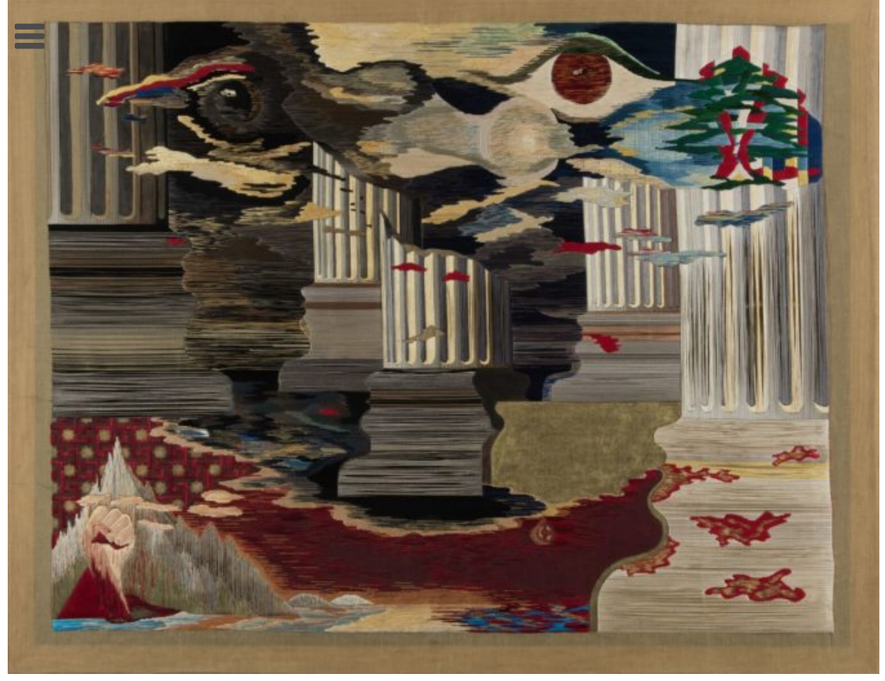
Nicolas Moufarrege, Le sang du phenix [The Blood of the Phoenix], 1975. Thread and pigment on needlepoint canvas. 49 7/8 x 64 inches. Image and work courtesy Nabil Moufarrej and Gulnar "Nouna" Mufarrij, Shreveport, Louisiana.