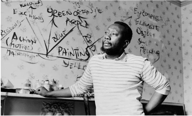
Starting out... Bowling in a London studio in 1962.

By the entrance hangs a dreamy expanse of yellow and pink, with dollops of gel meandering across the top like an archipelago. On the far side of the room, an electric-blue canvas is punctuated by a strip of black fabric and a luminous area of raised yellow resembling a landmass. Made this year, it's called El Dorado With My Shirt Collar , a reference to the fabled city of gold that drew Walter Raleigh and other explorers to the former British colony of Guyana, on the coast of South America, in the 16th century.