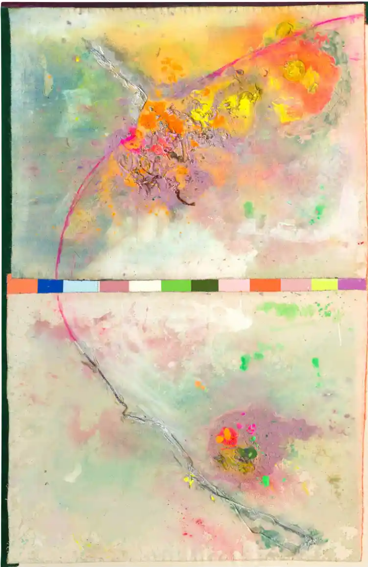
Intriguing clash ... Iona Miriam's Christmas Visit To & From Brighton.

Bowling enjoyed success in New York - he had a solo show in 1971 at the Whitney Museum of American Art - but by 1975 he had returned to London to be with his family, although he still has studios in both cities. His return was marked by a more confident and fluid style: glorious effervescent paintings suggestive of deep oceanic convulsions gave way to increasingly built-up, tactile surfaces using acrylic foam, acrylic gel, shells, packing materials and even toys to create bewitching contoured landscapes.