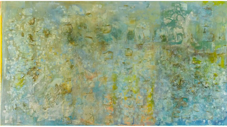
Echoes of Monet... Bowling's Great Thames IV.

Feeling “squeezed out” of London, Bowling decamped to New York, where he encountered the abstract expressionists and the colour field painters. At the time, he was still incorporating images of home and family members in his work. His childhood memories of Guyana remain vivid to this day: he tells me he used to regularly feed and bathe beggars at his mother’s insistence, and recalls the beatings meted out to him by his father.