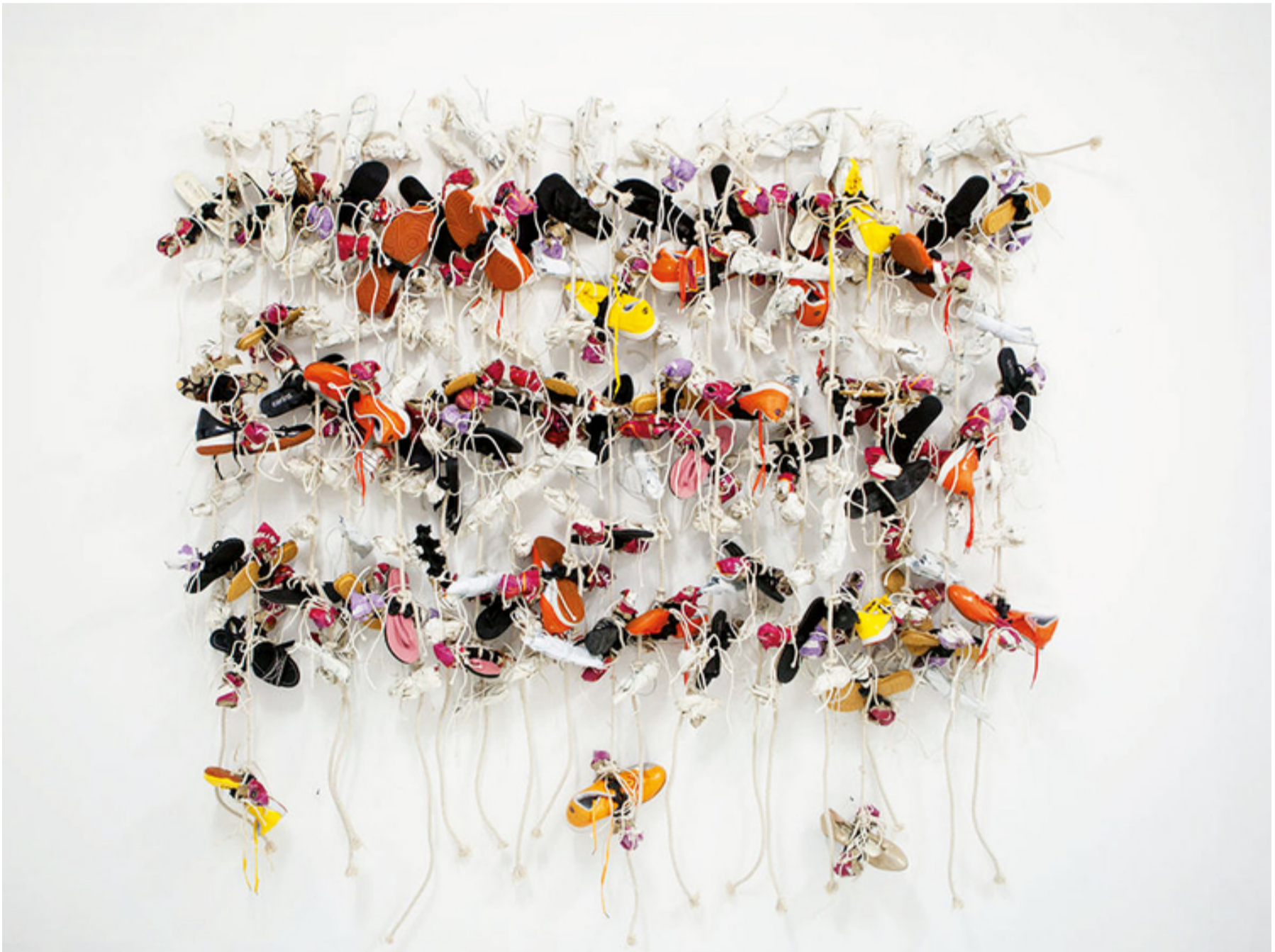
Hassan Sharif, Shoes, 2016. Shoes, slippers, glue, paper, cotton rope and cardboard