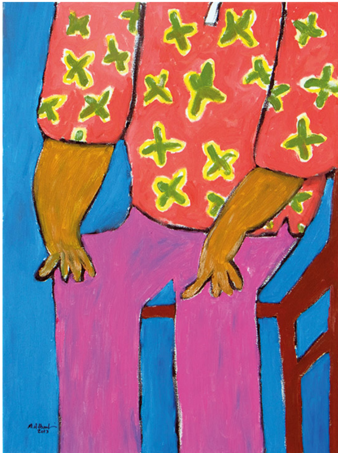
Mohamed Ahmed Ibrahim, Sitting Man, 2013. Oil on canvas.

The artist is well-known for his black and white paintings of simple lines that look like ancient cave markings. In this exhibition, he has covered all four walls in one area of the gallery with these lines to create an immersive installation. Also included in the show are papier-mâché sculptures of the lines that add another dimension to his signature works.