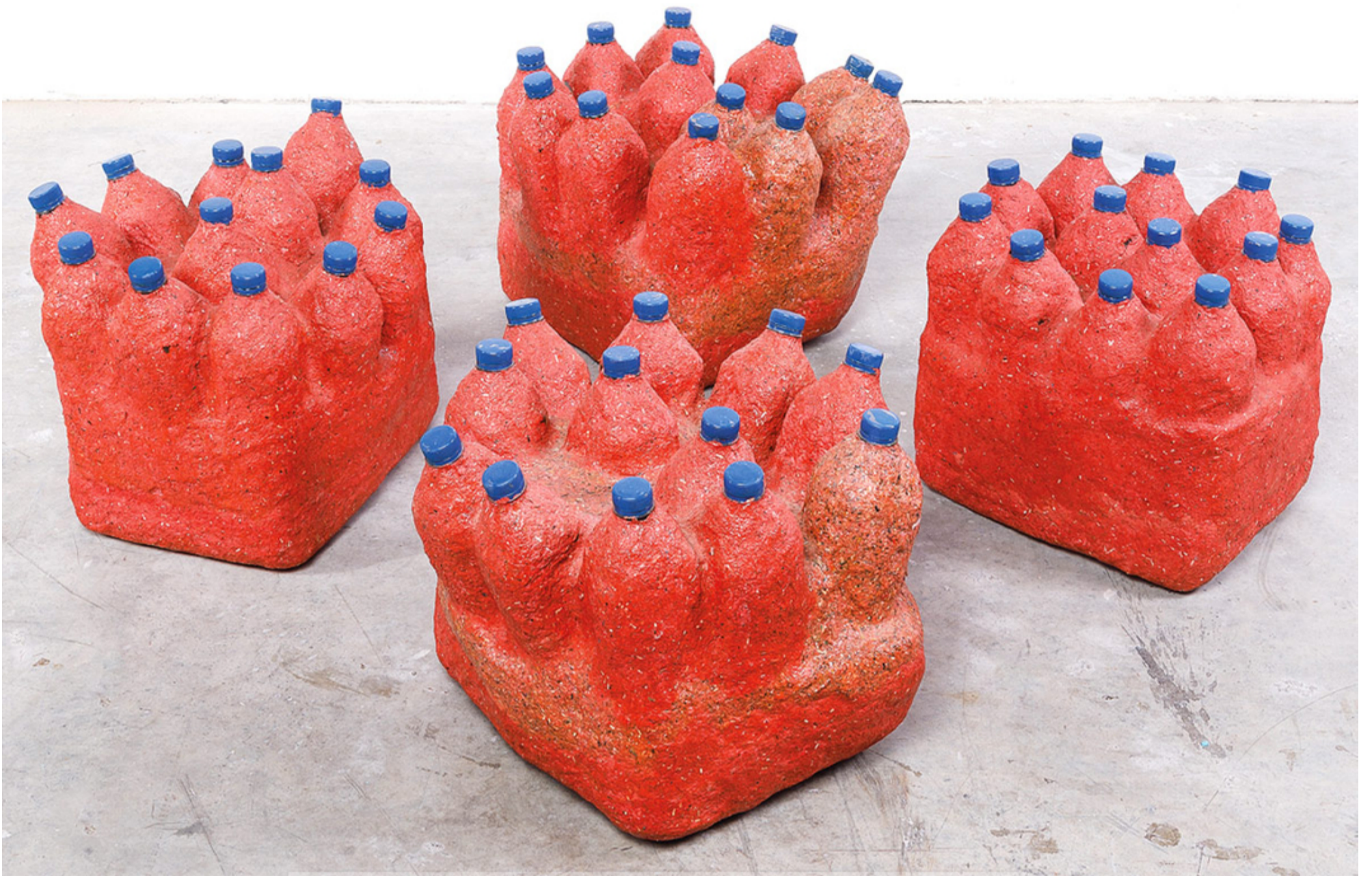
Mohamed Ahmed Ibrahim, Mineral Water, 2013. Plastic bottles, papier-mâché, cardboard boxes, Variable dimensions set of 4 Image Credit:

Jyoti Kalsi is an arts-enthusiast based in Dubai.