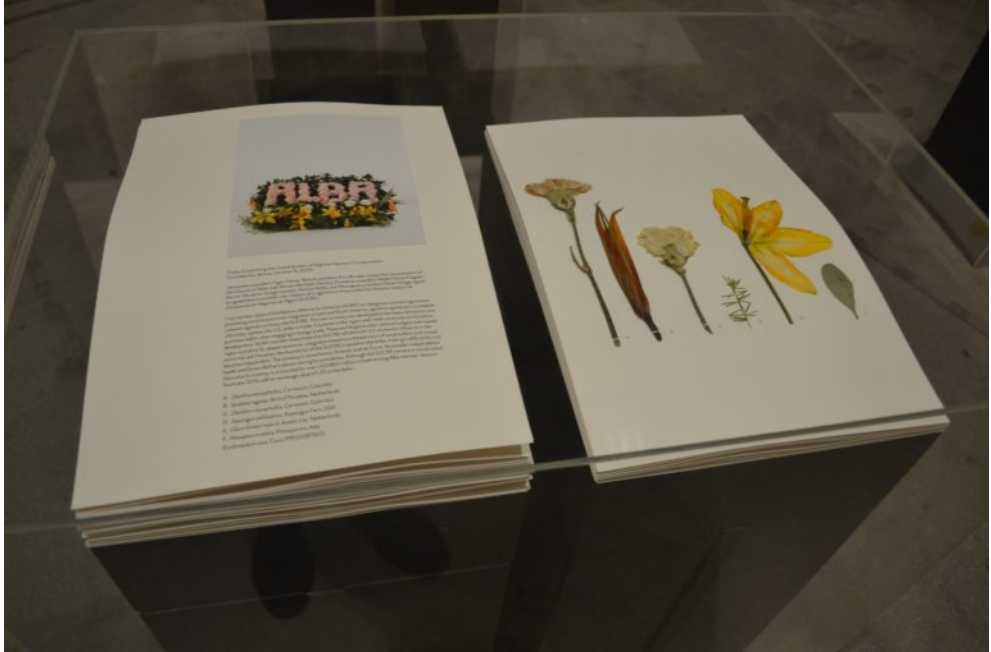
A detail of Taryn Simon's Paperwork, and the Will of Capital , 2015.