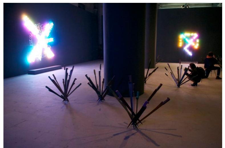
Bruce Nauman neons and Adel Abdessemed sculptures, a seemingly sacrilegious pairing that works.

After passing through the Murillo fabric, you are greeted by a room of drawings that scream, in block letters, "THE END" and " FINE ," by the late Italian Fabio Mauri (1926–2009), and a short film, tucked off to the side, that shows a man sitting against a wall vomiting blood, by the Frenchman Christian Boltanski in 1969. Tubular lights by Philippe Parreno flicker off and throughout the sprawling Arsenale galleries, the show's main venue alongside the Italian pavilion. The mood is dark, uneasy.