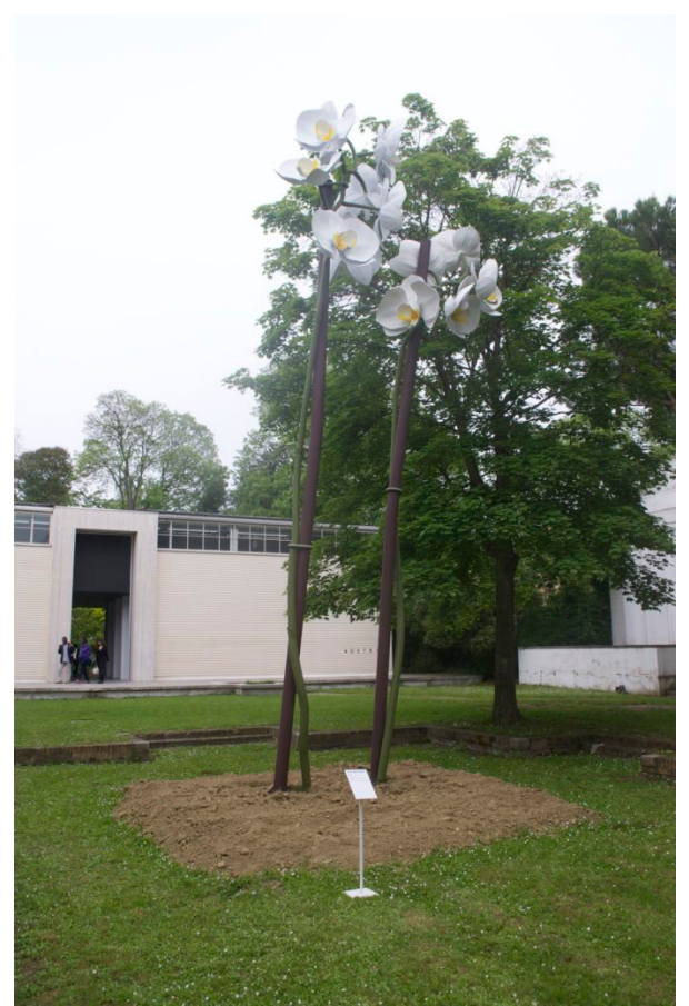
Isa Genzken, Two Orchids, 2015.

Despite its forward-looking title, Enwezor's biennale is obsessively fixated on the crushing concerns of the present moment, an attitude that is hard not to admire in an art world obsessed with big money and spectacular novelty. But that approach grows tiresome. As artworks about labor, social history, and unrest accumulate, one begins to yearn for just a little bit more poetry.