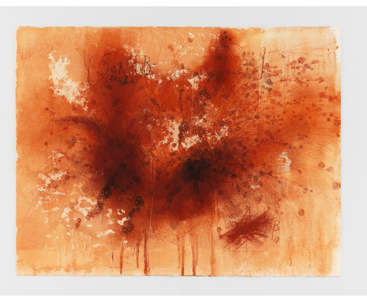
Ricardo Brey, Scrub, 2018. Mixed media on paper, 47 x 63 inches.

Scrub (2018) is a work of orange pigment on paper; it is expressionist and messy in its use of color, with the word "Scrub" emblazoned on the upper-middle-left register of the composition. The word, in English usage, holds a double meaning: the idea of scrubbing something, rubbing a surface with pressure; and the notion of low-level vegetation. As with the title of the show, we are not entirely sure what the artist's intended meaning might be, but the experience of this work on paper is excellent. Densities of color occur mainly in the center of the work, with drips descending downward, toward the very bottom of the drawing. Its general disorganization might well align it with the esthetic of the New York School, although such a reading is distant from Brey's circumstances. Another drawing, employing the same orange hue, is called Fern at the Edge of the Road (2017). An amorphous mass of color, with a darkened center, fills the center of the work; Brey tends to work messily within the color schemes of his two-dimensional art. Perhaps this style functions as a bit of rebellion against the constraints of art that is cleanly made but spiritually lacking.