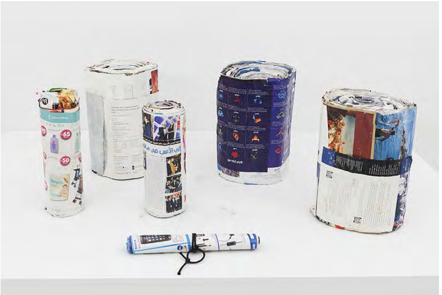
images no. 2, 2014 paper and glue / variable dimensions