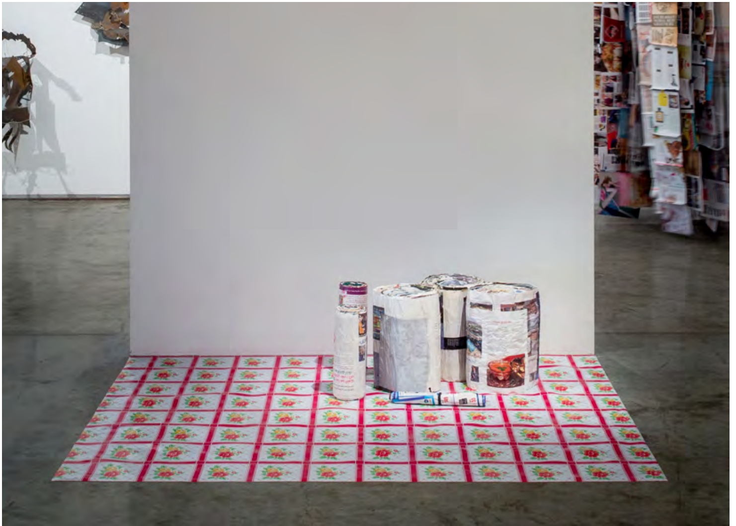
installation view of 'images no. 2', 2014 paper and glue / variable dimensions