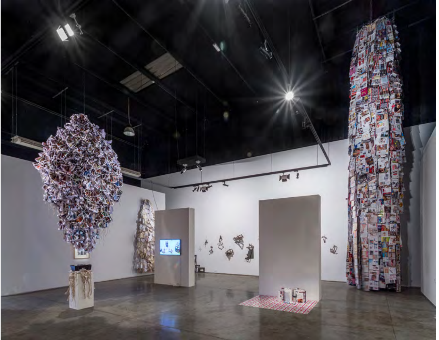
installation view at gallery isabelle van den eynde

visitors experience huge reams of paper, air-rusted iron shapes and hundreds of pages torn from a dictionary that hang from the ceiling and crawl up walls. viewers are invited to explore a wall of papier-mâché encrusted toys, a pillar of inkjet printouts, and a chandelier of ripped book sheets. fascinated by a seemingly endless repetition of imagery from glossy magazines churned out month-to-month, photographs that are printed and reprinted, and streams of leaflets and brochures, sharif addresses this flood of information with his own acts of repetition, where images are stripped of their meaning and turned into raw material for reuse.