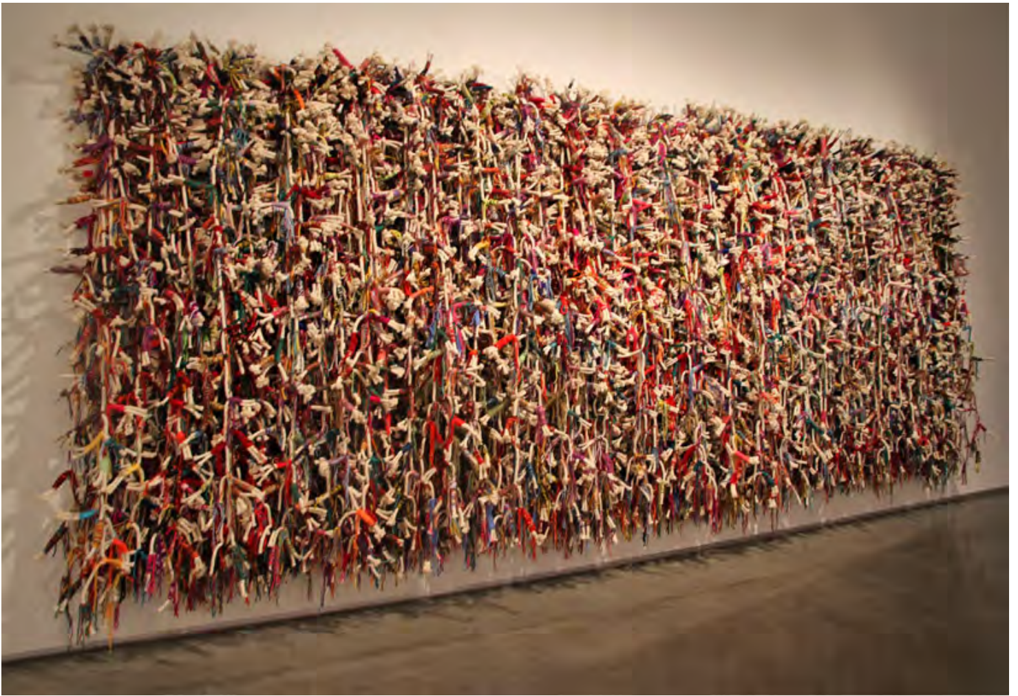
installation view of 'cutting and tying no.2' image © designboom