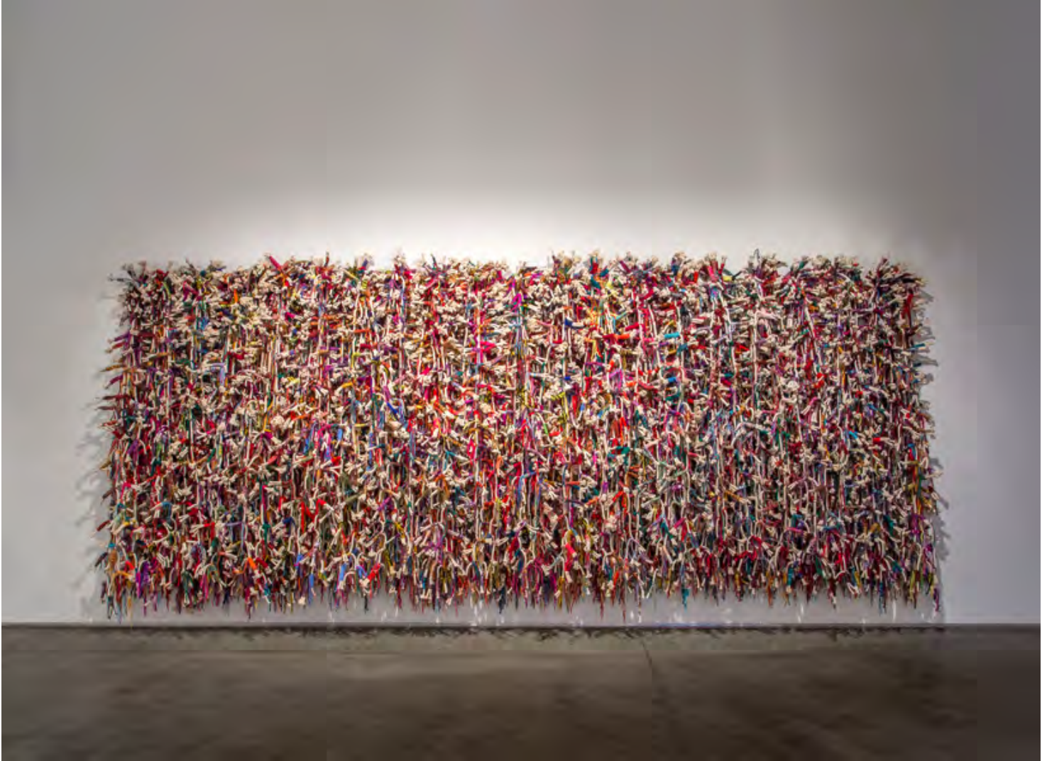
cutting and tying no.2, 2014