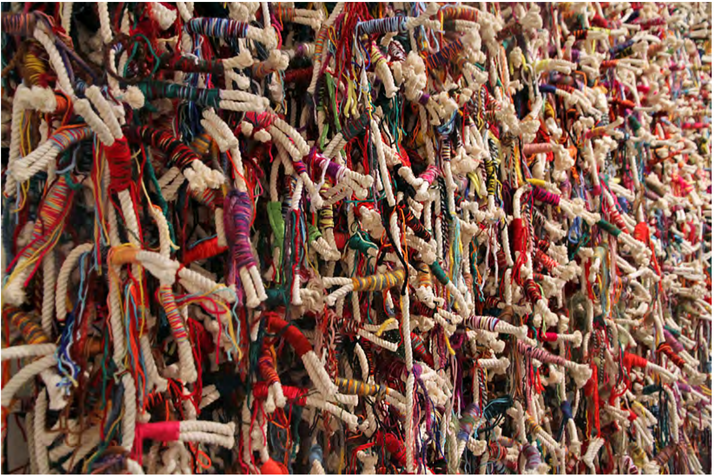
detail of ropes for 'cutting and tying no.2'