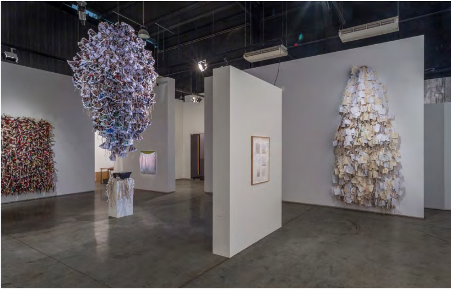
installation view at gallery isabelle van den eynde