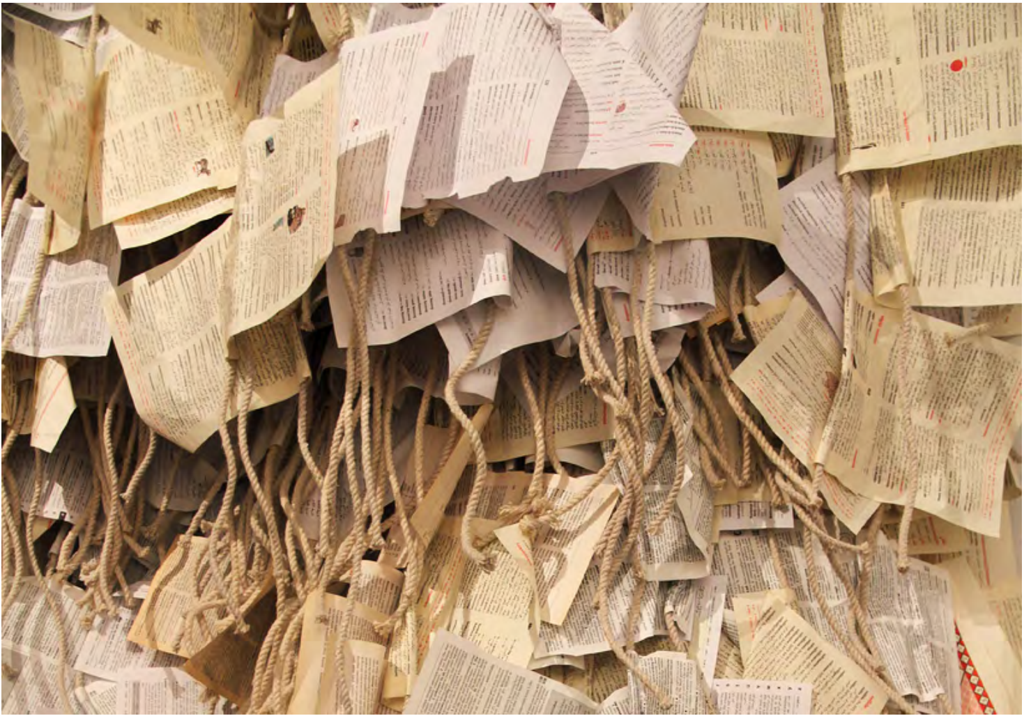
detail of 'dictionary' image