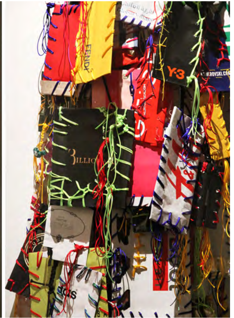
shopping bags, 2015