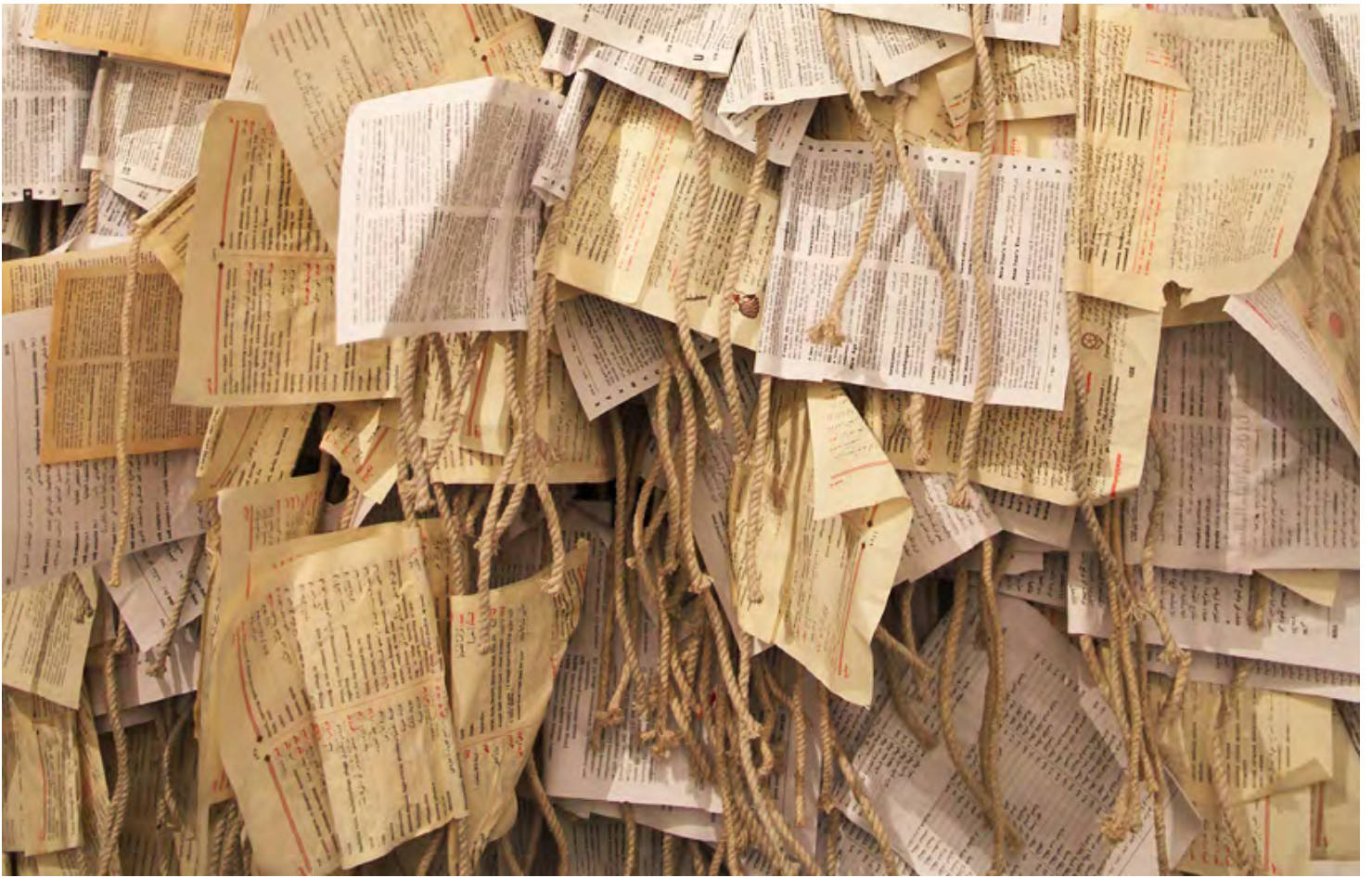
detail of pages for 'dictionary' image © designboom