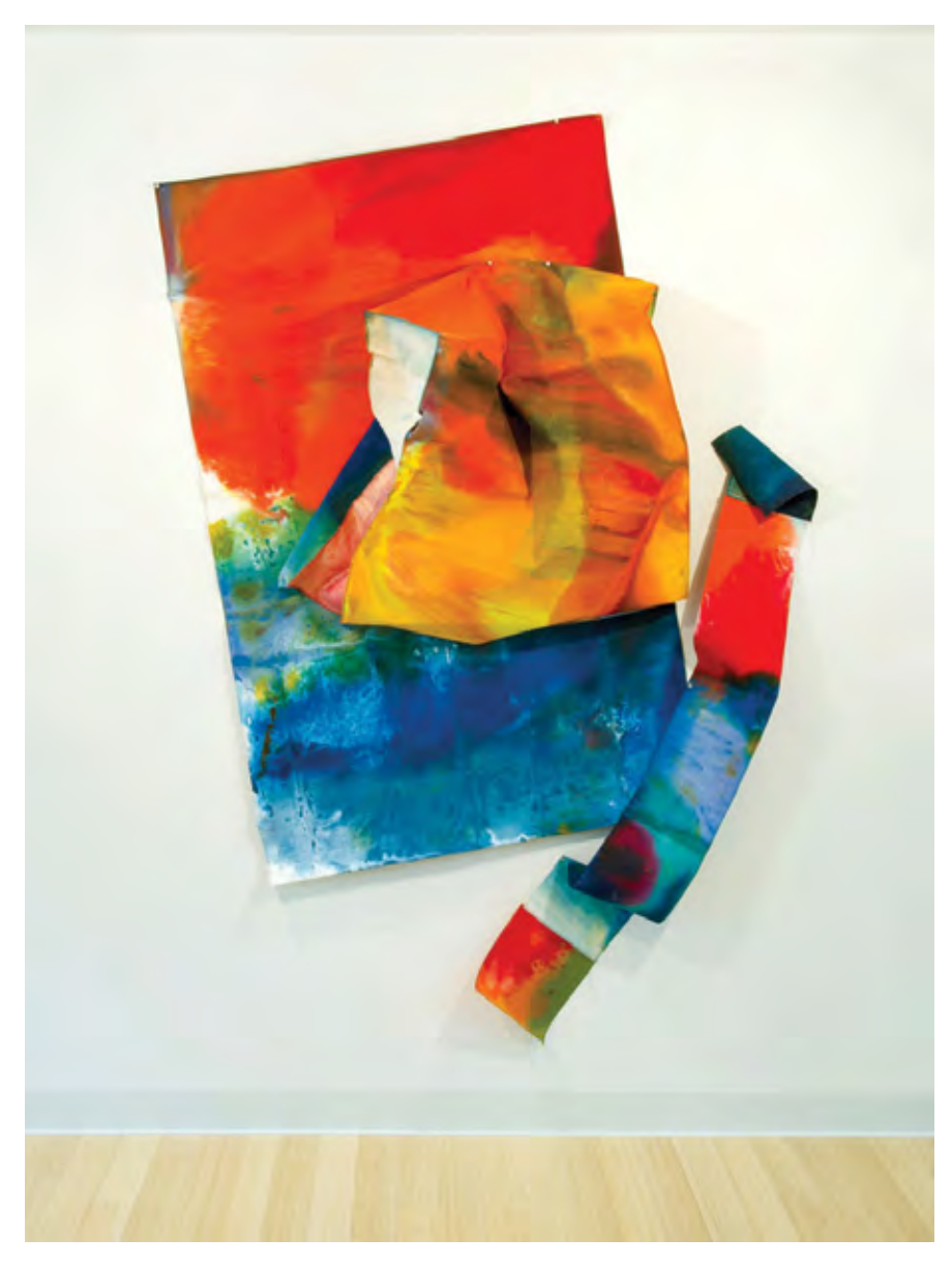
Sam Gilliam David, 2011. Mixed media, 89 x 67 x 17. Courtesy of Sam Gilliam

SAM GILLIAM is one of the most important painters of the twentieth century, having burst on the scene of American art in the early 1960s. His landmark paintings float the canvas from the stretcher, making color and form ethereal. Over the years he has expanded that concept by giving pigment visceral solidity and blurring the lines between painting and sculpture; adding collage elements in ways that change the concept of space; charging colors with scintillating light so that they seem to be a chimera; raking and building paintings from the floor; making architectural structures and environments; and exploring forms that move