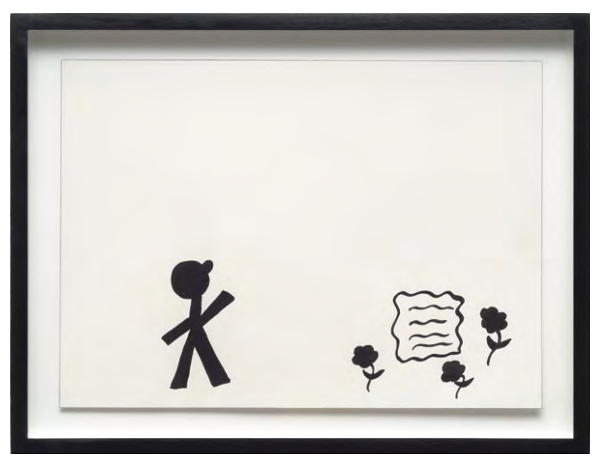
Kalup Linzy, Conversations wit de Churen VII: L'il Myron's Trade , 2009. Digital video on DVD, 9 min. 49 sec.

satirized black women through Geraldine, his own persona was separate. Ditto the late Red Foxx and Tyler Perry, who used black culture as a basis for satire on TV and in film. However, Linzy is not afraid to reveal himself through his characters: it is not simply a satire of Lucretia but of Linzy himself in drag. Linzy's art is not like a TV show or a movie; rather, it bridges a gap between imagery of popular culture and imagery of art, a seamless relationship between made-for-TV and performance art. His art also breaks down the barrier between an artistically informed eye and the perception of the non-art-conscious person on the street. His work not only brings black pop culture to performance art, it brings new audiences as well. Yet, as his art entertains, it also disturbs. At the center of our discomfiture may be the disorientation resulting from his cross-dressing: we enjoy the voyeuristic experience it provides, but we are uncertain of the persona and sexuality it reveals and challenges us to examine ourselves.