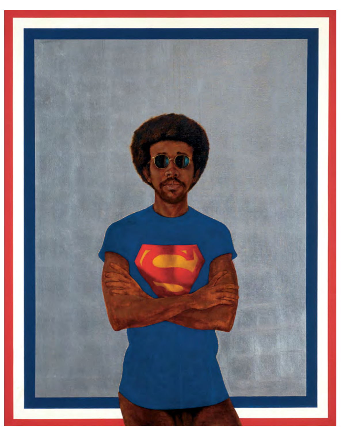
Barkley L. Hendricks, My Man Superman (Superman Never Saved Any Black People—Bobby Seale), 1969. Oil, acrylic, and aluminum leaf on linen canvas, 59 1/2 \times 48 .