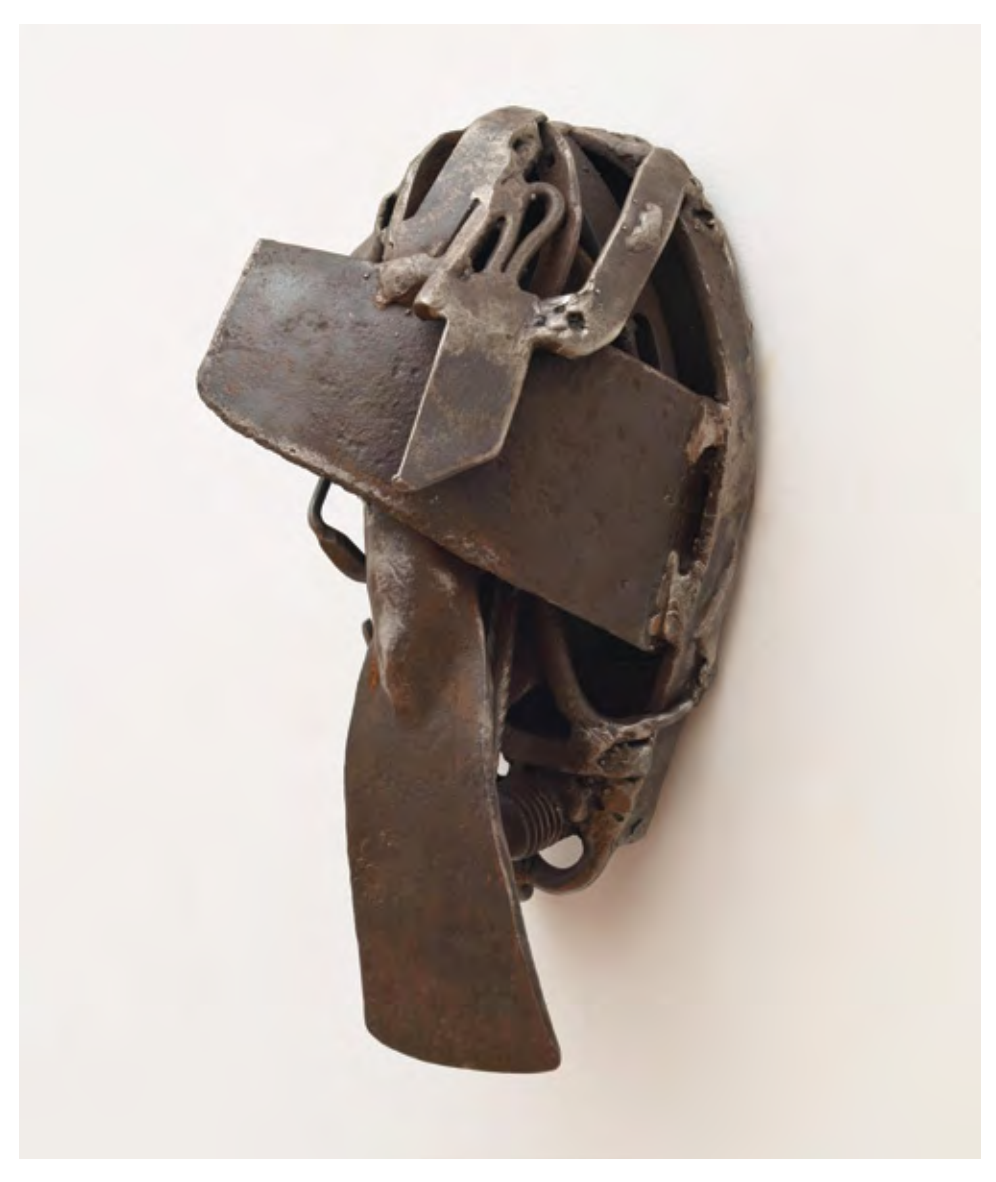
Melvin Edwards, Bara Niasse Tugge, 2008. Welded steel, 14 1/2 \times 6 \times 1/2 \times 6 \times 3/4.

by the artist, with varying periods of intensity, since 1963. There are now more than two hundred pieces in the series. These sculptures, most about a foot tall, are meant to be hung on the wall at eye level. The essence of these works lies in the transformation to which Edwards subjects the objects he finds to use in these sculptures. The objects are so radically changed that they are perceived as abstractions that belie the state in which he found them, all the while retaining the aura of their origin as utilitarian objects and the spirit of historic brutality for which they were used. Edwards forges, welds, bends, and stretches the metal objects in these works—hammer heads, scissors, locks, chains, and railroad splices—and transforms them into a new kind of sculpture.