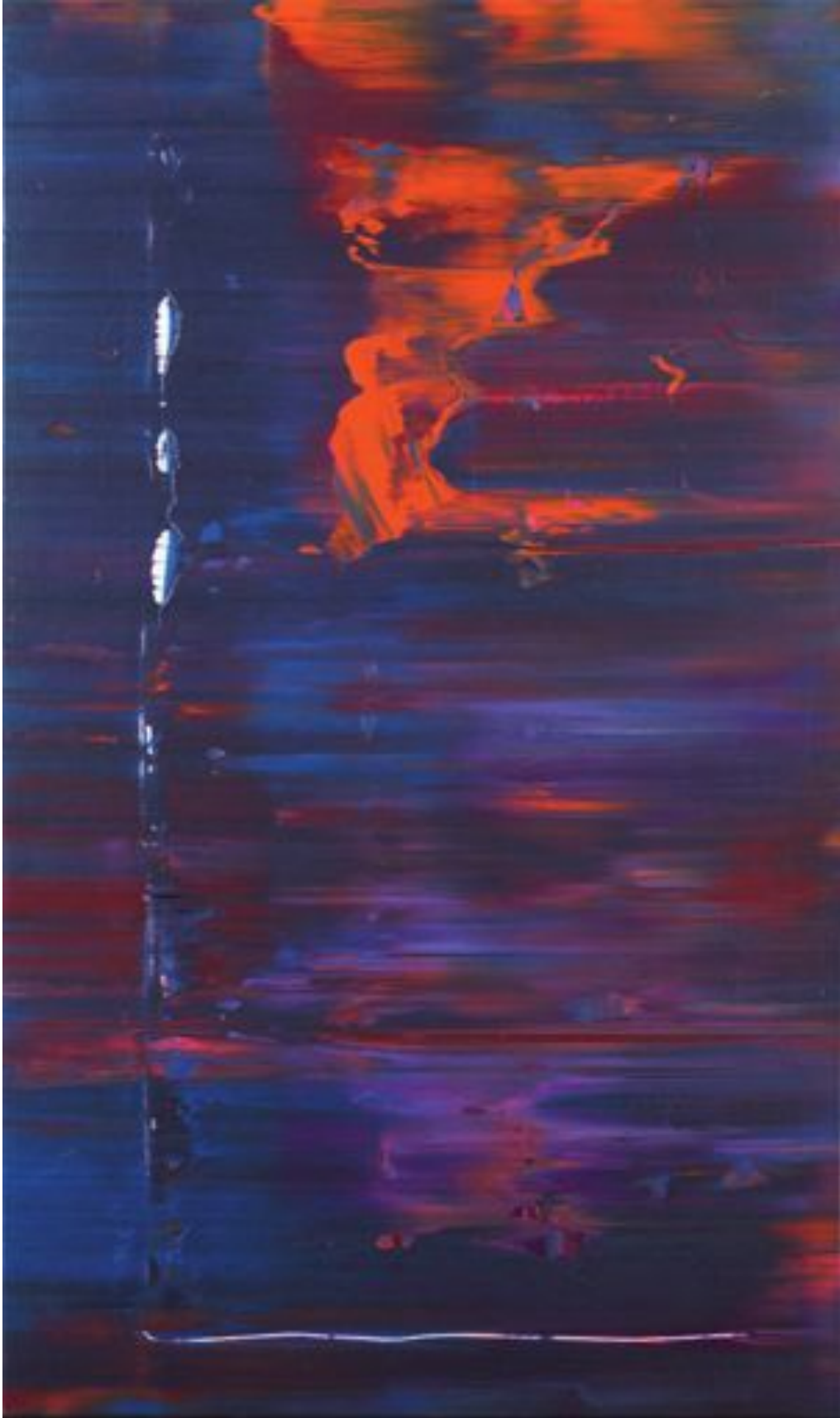
Jack Whitten, Chinese Sincerity , 1975. He made a leap from politically engaged work into abstraction.