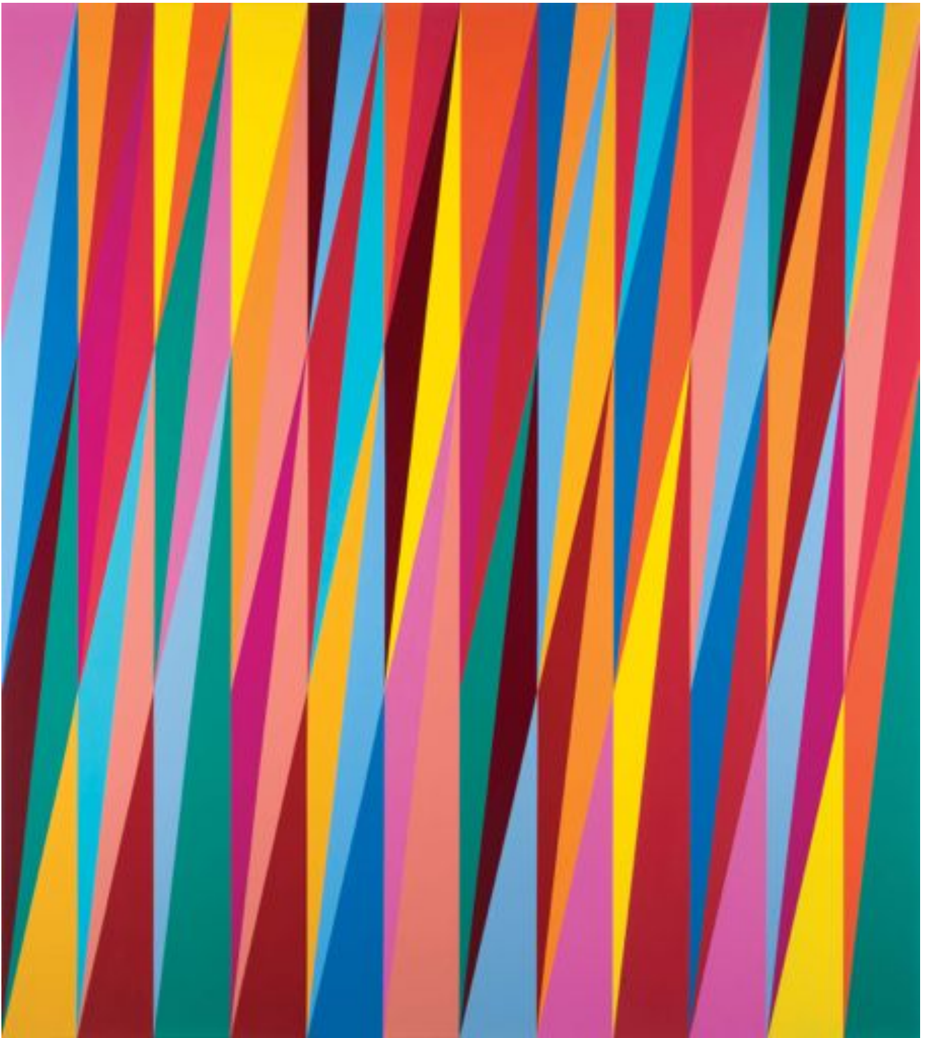
OPPOSITE Al Loving, Untitled , 1969. The illusionary cube is the signature image in his early abstractions. ABOVE Odili Donald Odita, Firewall , 2013. The Nigerian-born Odili's zigzagging shards of vibrant color suggest colliding cultures and emotions.

in the 1960s to promote social and political engagement in art and literature. "Oftentimes abstract painting is not as celebrated as more figurative work by the black community. From the mainstream art world, it's just the sense of not being preoccupied