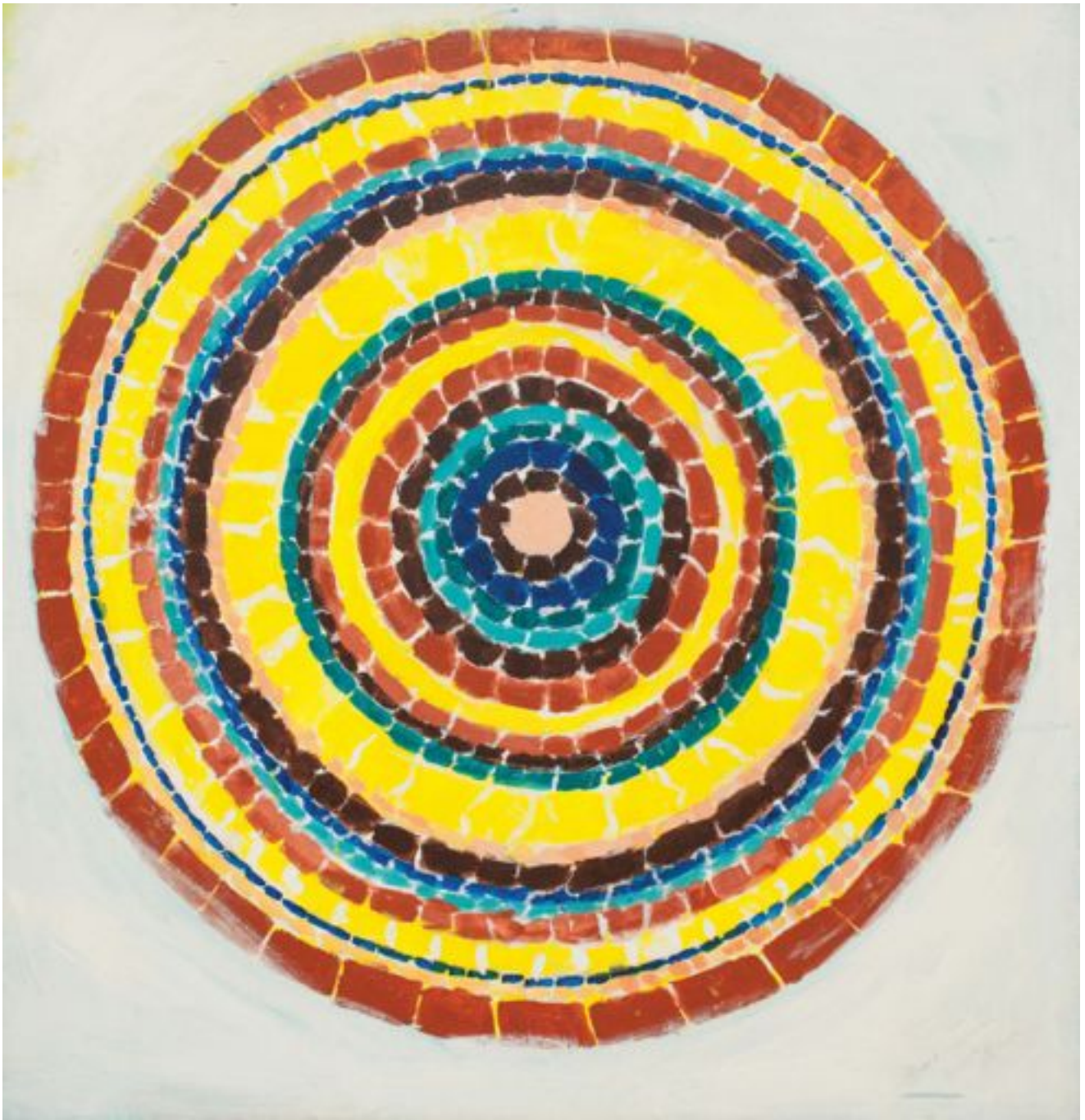
Alma Thomas, Untitled , 1968. She was the first black woman to exhibit at the Whitney Museum.