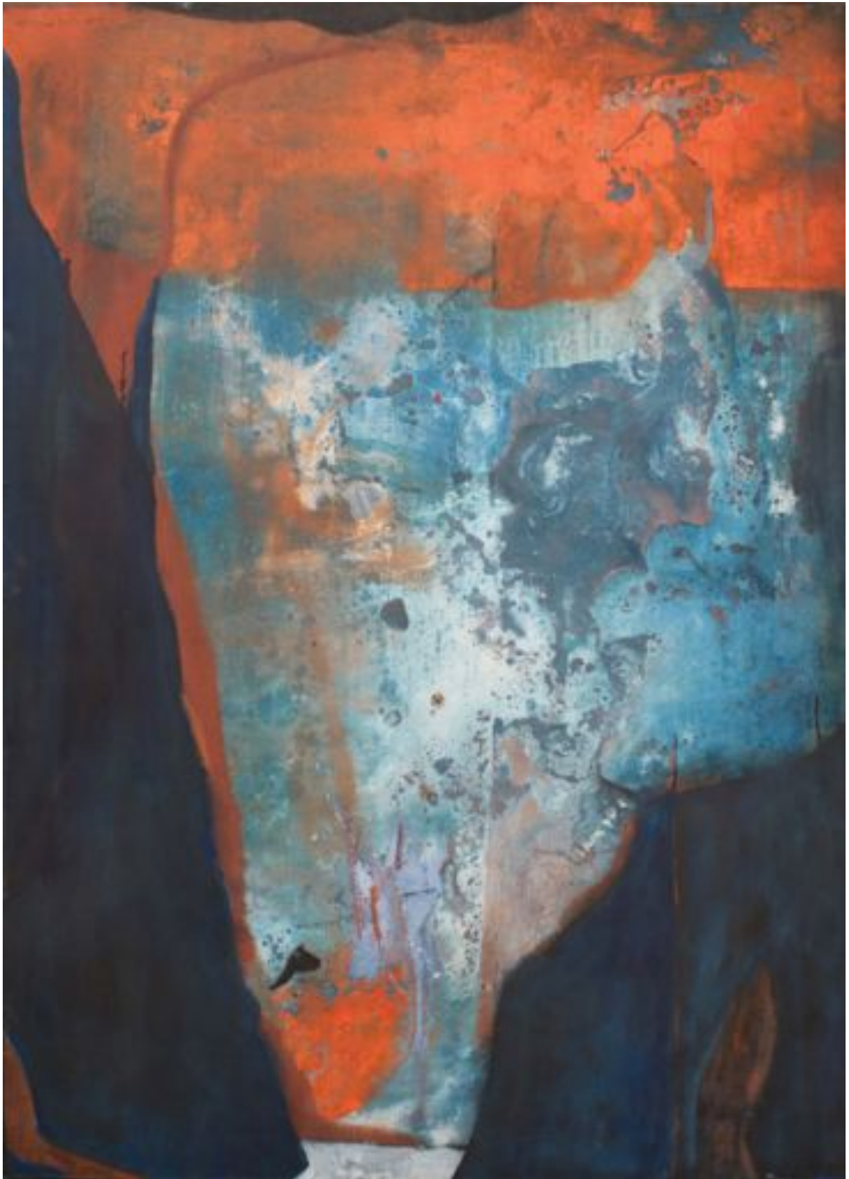
Strange Land , 1960, would be unrecognizable to most viewers as a painting by Romare Bearden.