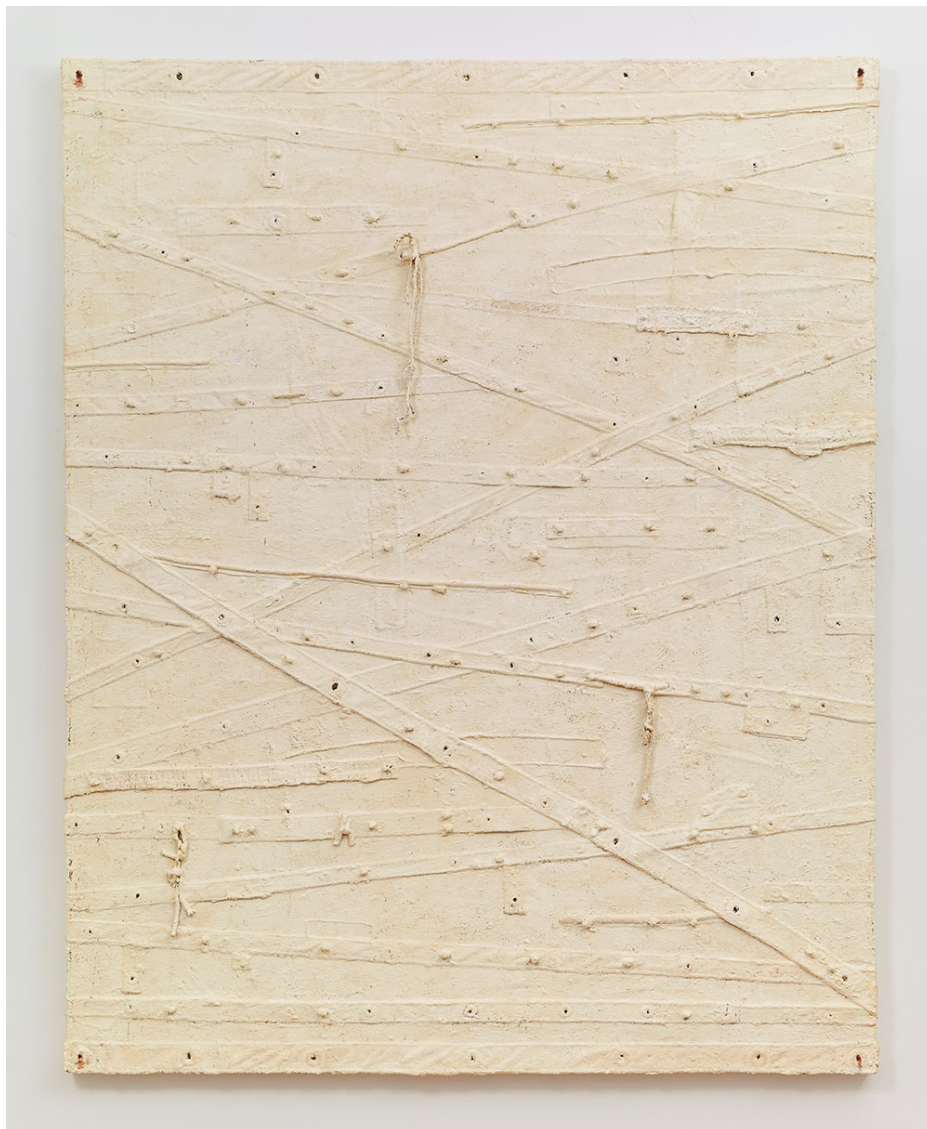
Harmony Hammond, Blanco , 2012–2013, oil and mixed media on canvas. Courtesy: Alexander Gray Associates, New York © 2018 Harmony Hammond / Licensed by VAGA at Artists Rights Society (ARS); photograph: Jeffrey Sturges

with dead leaves. The work isn't so much an abstract reference to poor and conservative rural communities in the US as it is an assemblage of its refuse.