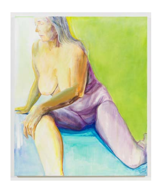
Joan Semmel, In the Green, 2017. Oil on canvas, 72 \times 60 inches. Image courtesy Alexander Gray Associates. © Joan Semmel / Artists

Thus, the moodlit My Saskia (2018)—an outlier in the seven-painting series that commands the big upstairs gallery—while too beautiful to laugh at, is a kind of joke, a good-natured flex. In the magnetic, loosely painted invocation of Rembrandt, Semmel's figure sits downcast on a stool, leaning on her one raised knee. Emerging from the warm gloom, she's partially illuminated by a piercing light that unites gray hair and hanging breasts in a jagged, then curvy, white-gold shape. Saskia van Uylenburgh was the Dutch master's wife and sometimes model; Semmel's titular Saskia is, of course, Joan Semmel. The canvas is the show's most pointed reference to the art-historical baggage of figuration, a reminder that the artist's five decades of collapsing and confusing gendered roles of looking, posing, and painting is not long at all considering what she's up against. Each work can be seen as a "necessary elaboration," the repetition of a small but winning gesture against a very old Goliath.