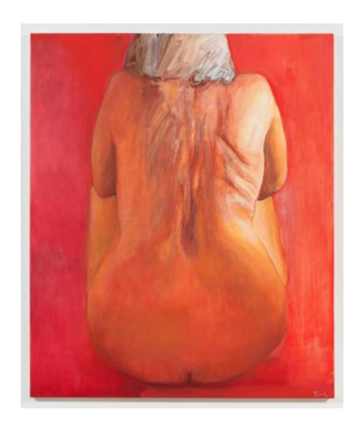
Joan Semmel, Seated in Red, 2018. Oil on canvas, 72 \times 60 inches. Image courtesy Alexander Gray Associates. © Joan Semmel / Artists Rights Society.

Big swaths of lush, unrestrained color structure the seven grand canvases upstairs—each a little smaller than a queen mattress—but the artist takes unmistakable pleasure in the details too. Turning (2018) boasts moments of psychedelic intensity. The back of the forearm that steadies her as she shifts her weight on a wooden stool is painted with gnarled vigor, like a red tree trunk streaked with purple, orange, and emerald green. Her elbow is a ringed burl. The waves of her hair appear iridescent, articulated delicately as individual locks of lavender, mustard, and celadon. Fleshed Out (2018) exists in a similar enchanted twilight of dark periwinkle. In it, Semmel's glowing limbs are rimmed briskly with lines of bright yellow—a partial overlay reminiscent of past, layered compositions in which a silhouetted figure fragments a fully rendered one beneath to disorienting, exciting effect.