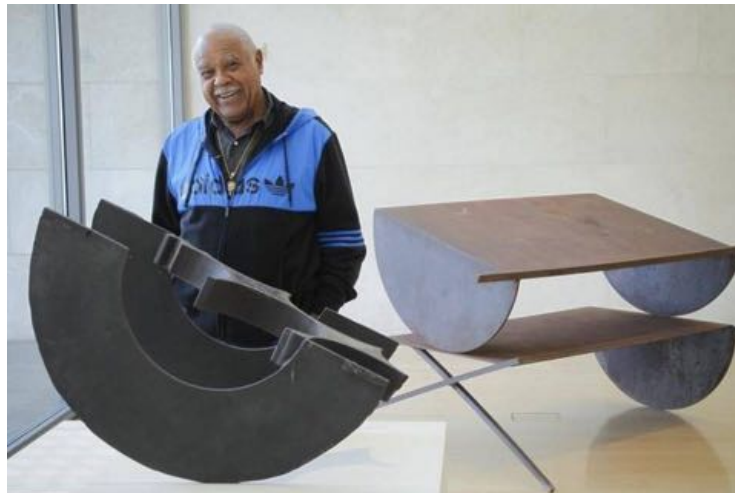
Melvin Edwards and two of his welded steel Rockers, at the Nasher Sculpture Center in Dallas