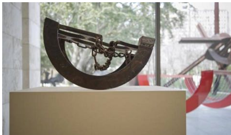
Ame Eghan (Rocker), by Melvin Edwards, 1975, welded steel, is on display at the Nasher Sculpture Center in Dallas