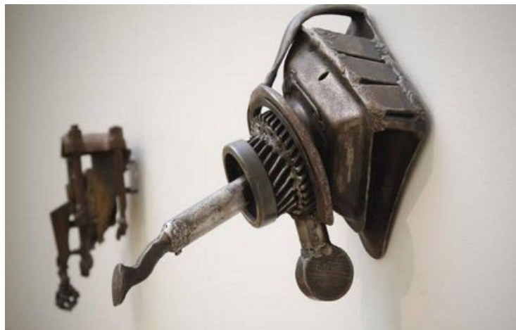
Two of Melvin Edwards's Lynch Fragments, in front, Mamba (Lynch Fragment) 1965, on exhibit at the Nasher Sculpture Center in Dallas