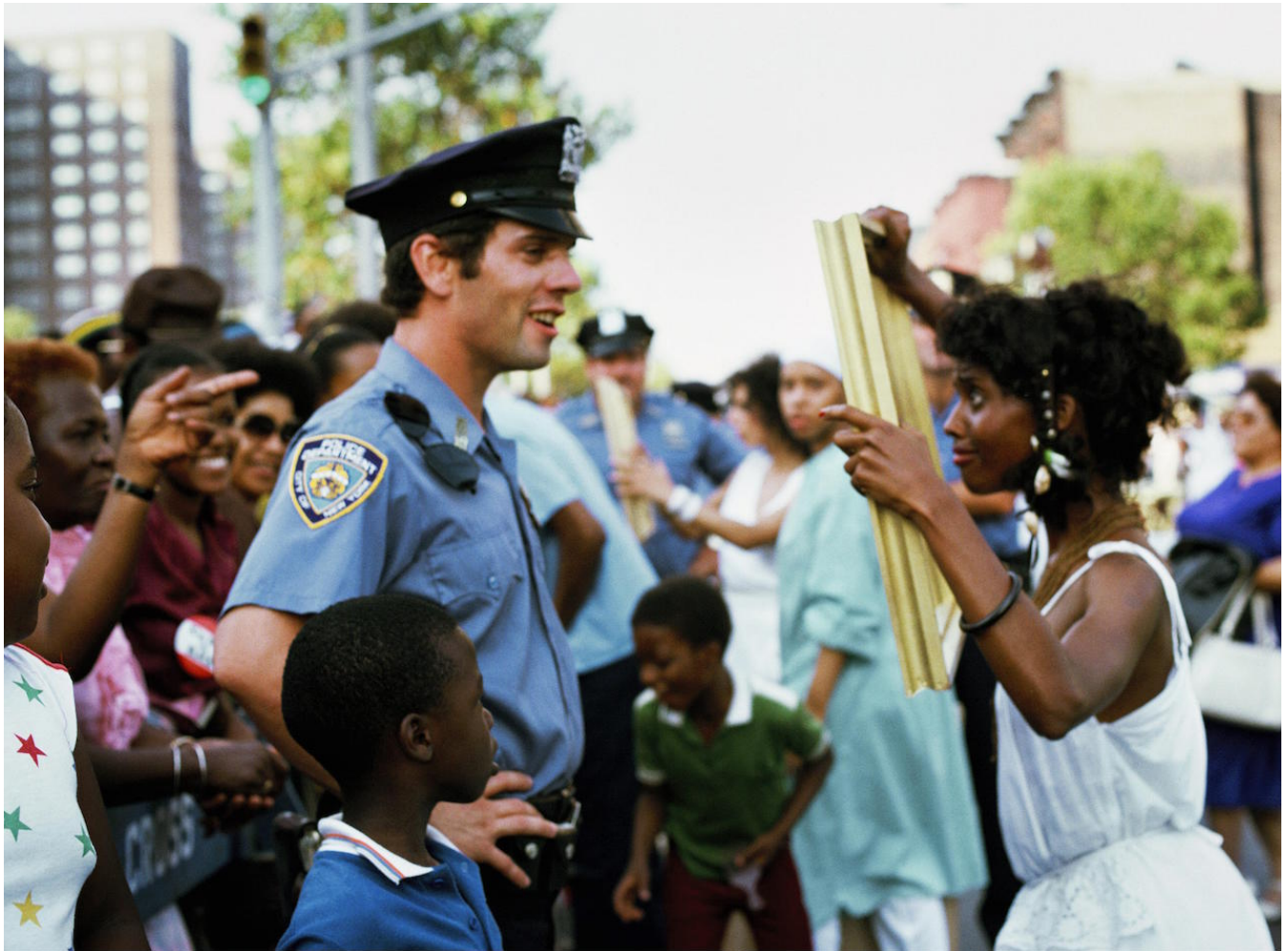
Lorraine O'Grady, "Art is. . . (Framing Cop)" (1983/2009), chromogenic color print, 16 x 20 inches

frame of parade conviviality, the subtle police presence is perhaps the most telling. Of course, the presence of police barricades indicates that the police aren't, in one sense, anomalies at all: for better and for worse, they are part of the very structure and design of the parade and of the larger Harlem community (then as now). But within the visual universe of "Art Is..." the police officers, all white, stand out for their discomfort as contextual minorities and, especially, by their role as strait-laced authority figures implicitly restraining the performative merrymaking.