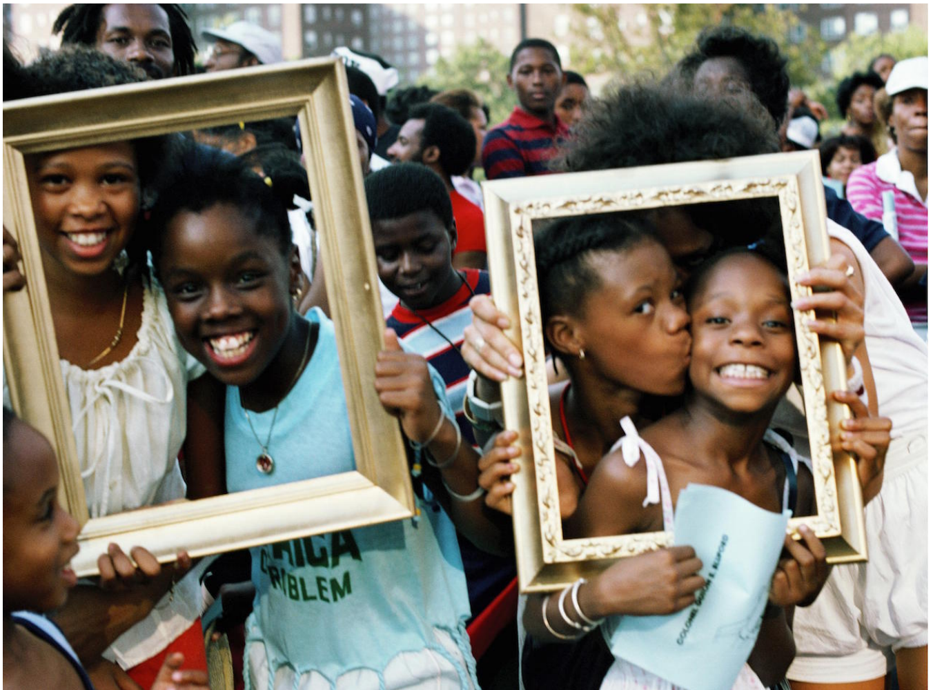
Lorraine O'Grady, "Art Is. . . (Girlfriends Times Two)" (1983/2009), chromogenic color print, 16 × 20 inches

For the performance, O'Grady entered a float into that year's African-American Day Parade, which ran, and still runs, up Adam Clayton Powell Boulevard in Harlem. On the side of the float, in big letters, were the words "ART IS..."; atop it, running lengthwise, was a massive 9'x15' gold picture frame. In character as "Mlle Bourgeoise Noire," a persona she had adopted, in the years prior, as a guise enabling her to crash art world events and draw attention to issues of racial underrepresentation, O'Grady and a troupe of 15 African-American and Latino performers, dressed all in white, walked around the float carrying empty gold picture frames. The empty frames were sometimes handed to onlookers, sometimes held in front of them, Vanna White-style, to encourage the mostly black audience to consider themselves as valid subjects, even makers, of art. Photographs taken by various people who witnessed these framings were then collected by O'Grady to document the performance. Forty of those images are currently on view in an eponymous exhibit of "Art Is..." at the Studio Museum in Harlem . The results are smart and exuberant, a delightful Conceptualist triumph of both head and heart.