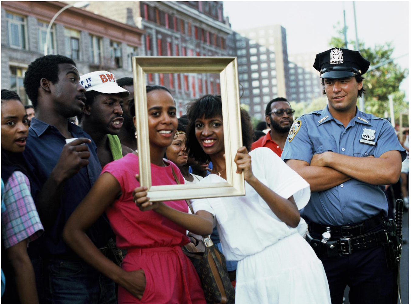
Lorraine O'Grady, "Art Is... (Woman with Man and Cop Watching)" (1983/2009), chromogenic color print, 16 x 20 inches

"Art Is... (Woman with Man and Cop Watching)" is representative in this regard. The center of the photograph consists of a performer holding up a small frame around herself and another woman; both their smiles are subdued, neutral. Outside that frame, behind and around the two women, is a panoply of expressive, in some cases troubling, men's faces. From left to right: a black man with a quizzical eyebrow; a black man snarling in the direction of the picture frame; a black man in sunglasses, oblivious to the scene, staring off into the distance; a white cop, arms crossed, detachedly observing the women, his expression something between a snigger and a sneer. This multitude of mixed expressions, and not the face of the titular framed woman, is where most of the photo's action actually takes place.