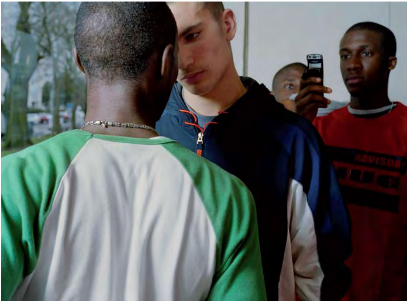
MOHAMED BOUROUISSA, 'Le Téléphone,' from the series Périphéries , 109 x 95.5 cm digital print, 2006.