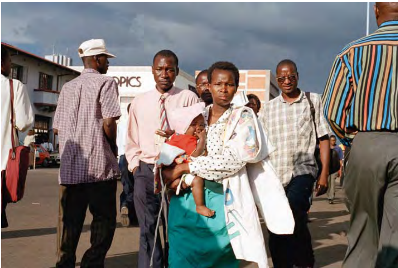
CALVIN DONDO, Untitled from the series Harare Charge Office , 40 x 60 cm chromogenic print, 2000