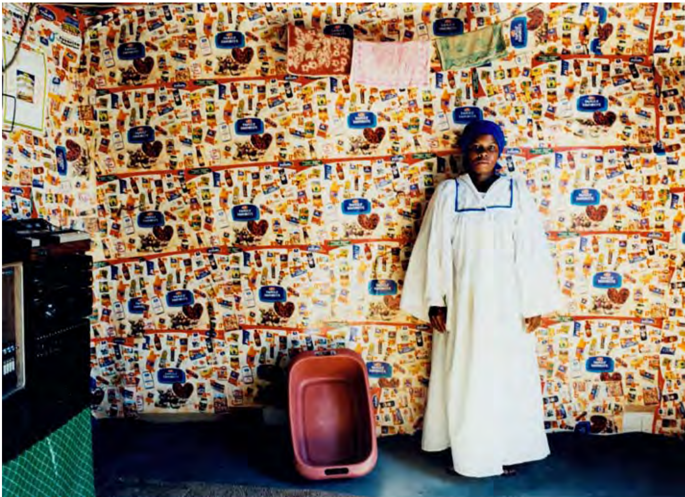
ZWELETHU MTHETHWA, Untitled , 96.5 x 129.5 cm chromogenic print, 2000