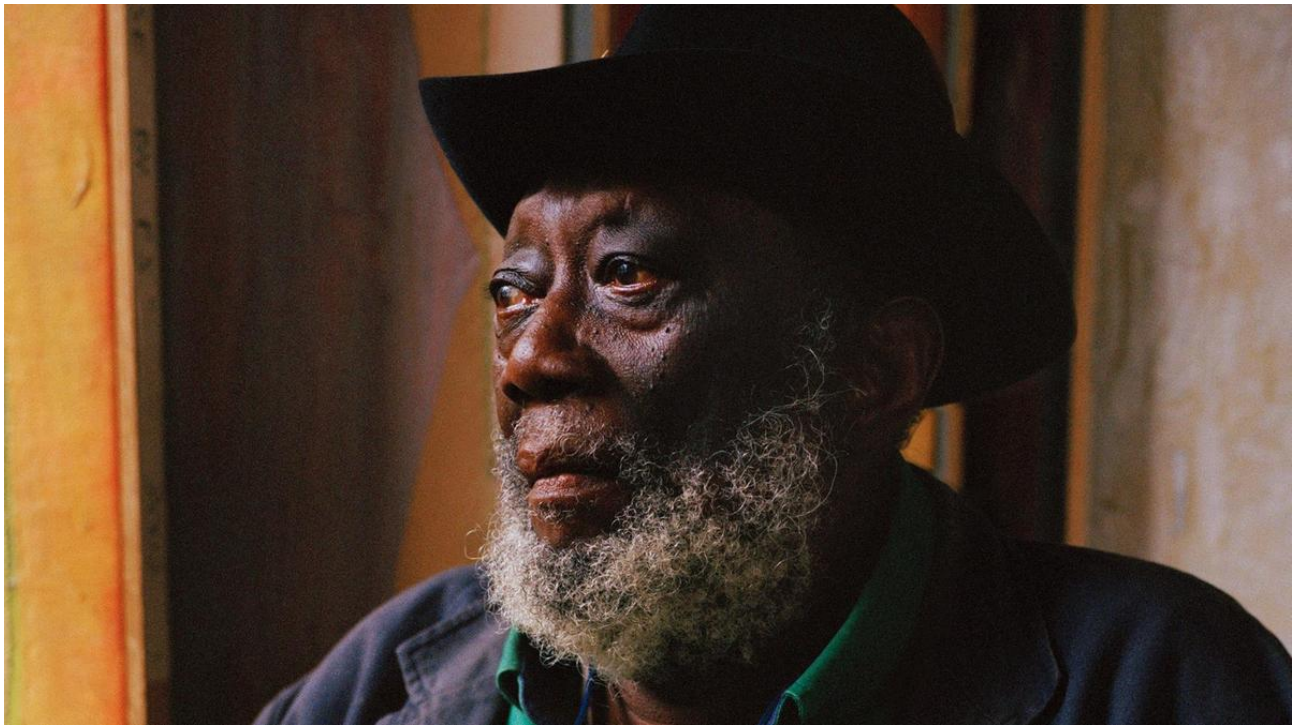
Frank Bowling in his London Studio, 2017.