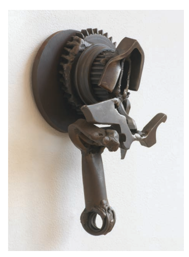
His and Hers, from the Lynch Fragments series, 1964. Welded steel, 10\frac{3}{4} \times 6 \times 4\frac{1}{4} in.