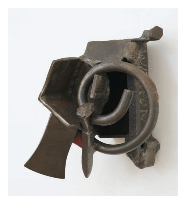
Weapon of Freedom, from the Lynch Fragments series, 1986. Welded steel, 11 \times 9 \times 6 in.

interested in the inventedness of boxes. I believed in the idea that society tried to do something for people that they could use. Well, I also looked at knives, forks, and spoons, or buildings.