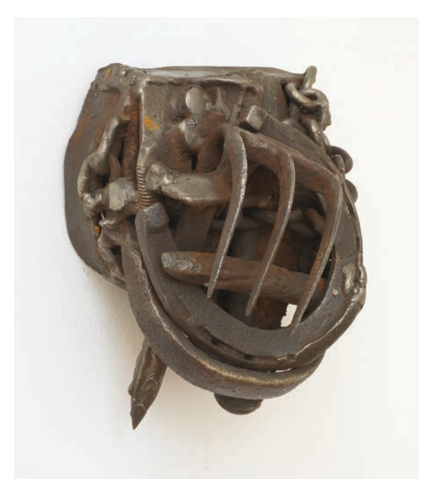
Bayou Talk, from the Lynch Fragments series, 2005. Welded steel, 9 \times 8 \times 7 in.

Art as part of development is more profound than the real estate business, where it ends up as investment in exploitation but nothing for the masses.