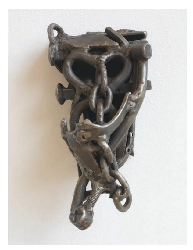
Iraq, from the Lynch Fragments series, 2003. Welded steel, 13 \times 7 \times 7 in.

When I made the commission for a five-foot-high version, it would have be shown somewhere together with the tapestry piece to show the relationship. I am getting back