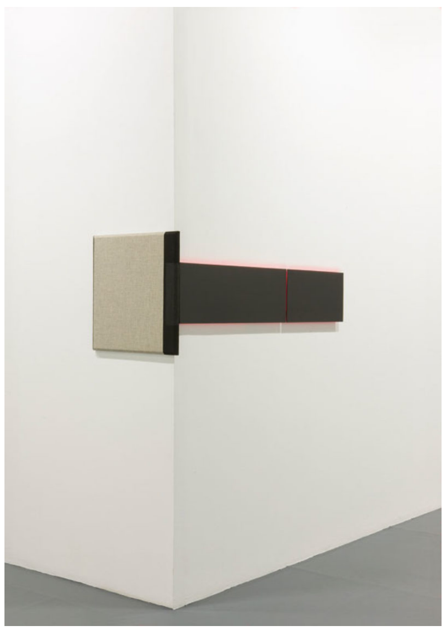
Sustained Black with Broken Time and Undertone, 2011, acoustic noise control panel, "carbon black" acrylic on canvas, 24 \times 24 inches and 12 \times 48 inches.

dampening materials. As viewers/listeners move by or through his built spaces they are affected by the absorption materials and the forms, provoking a sense of dislocation and dread as visitors are deprived of acoustic reflection. With Jones, the works cited above have been sampled and remixed and given a new context, perhaps to be classified in a category of black minimalism. Jones operates in a realm of sampling that is based in