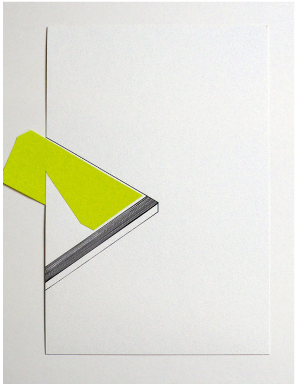
Song Container, 2010, collage and ink on paper, 10 \times 15 inches.

With Absorb / Diffuse , her fall exhibition at The Kitchen in New York City, Jones uses actual sound and brings it into the physical realm with an arresting composition that is accompanied by a series of so-called acoustic paintings. From the Low is a powerful, affecting, and, at times, discomforting sound piece that emphasizes low-frequency samples gathered and appropriated from a number of sources from jazz, contemporary minimalism, and orchestral compositions to modern electronica. The low end in a song