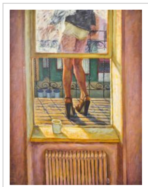
Morning Terrace, 1992, oil on canvas, 72 by 54 inches (182.88h by 137.16w cm). Courtesy Alexander Gray Associates, New York • © 2016 Estate of Hugh Steers / Artists Rights Society (ARS), New York