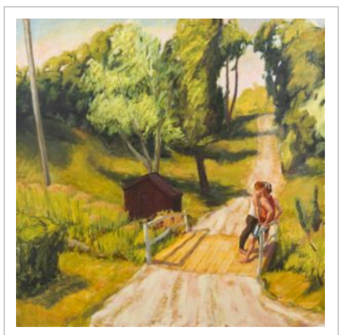
Maroon Shed, 1991, oil on canvas, 60 by 60 inches (152.4h by 152.4w cm).

Indeed, paper bags are a staple and recurring motif in Steers work. For example, his painting Raft, 1991 (oil on canvas, 40 by 30 1/4 inches) recalls bittersweet memories of boyhood; summer camp and an escapist fascination with a flotilla serving as an island for castaways or champions with the shoreline for the everyman just in sight. Steer's subject holds his balance blindly near the edge invoking a sense of doom or unsteady in the fight to stay afloat in the canvas and in life.