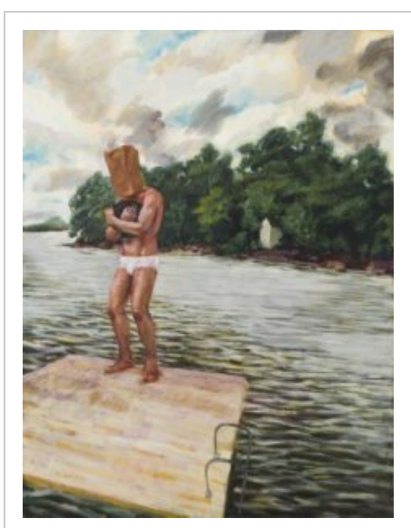
Raft, 1991, oil on canvas, 40 by 30.25 inches (101.6h x 76.84w cm). Courtesy Alexander Gray Associates, New York • © 2016 Estate of Hugh Steers / Artists Rights Society (ARS), New York

shades while illuminating the failing health of Steers and his friends during a grim era never redundant in the constant reminders of his own high probability of death. Turning away from the morbid and helpless however, Steers hallucinogenic dreamscapes are boldly imaginative and ultimately brave. A notable example, Black Bag, 1993 (oil on canvas 45 by 38 inches) presents a transient character center stage, a grim reaper of sorts, the lost lover he longed for, or perhaps a hurried friend off to another funeral decked in symbolic black attire; the sling-back heals in tow representing another life taken after an arduous fight. Predominately male characters occupy his painted space; languid, in pumps, teetering, many times bare or in white briefs and usually coupled, all never appearing any older than the artist himself.