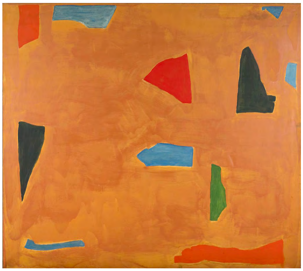
Betty Parsons, Orange , 1956, acrylic on canvas. ©2017 THE ESTATE OF BETTY PARSONS/COURTESY ALEXANDER GRAY ASSOCIATES, NEW YORK

BY The Editors of ARTnews POSTED 06/16/17