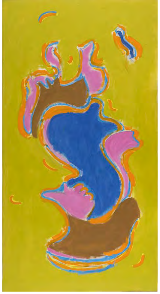
Betty Parsons, African Dawn, 1972, acrylic on canvas.