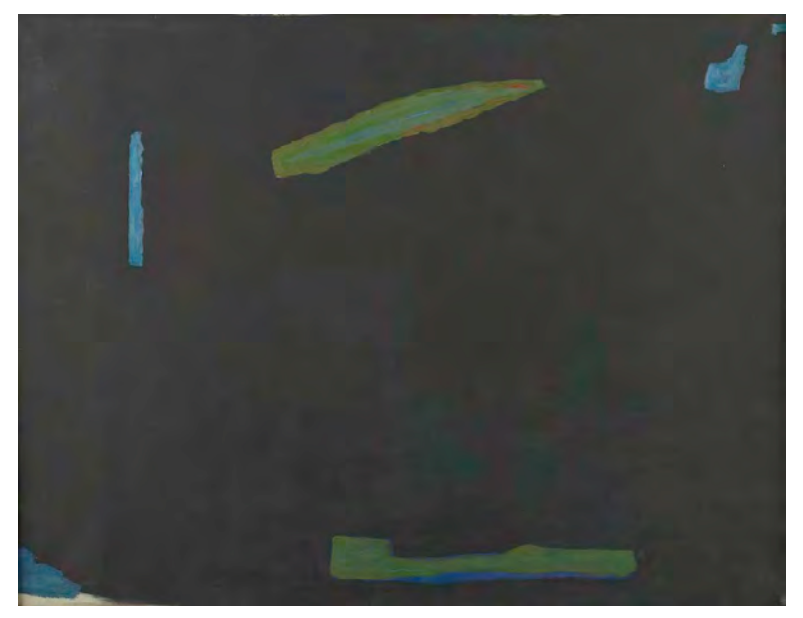
Betty Parsons, Requiem , 1963, acrylic on canvas.