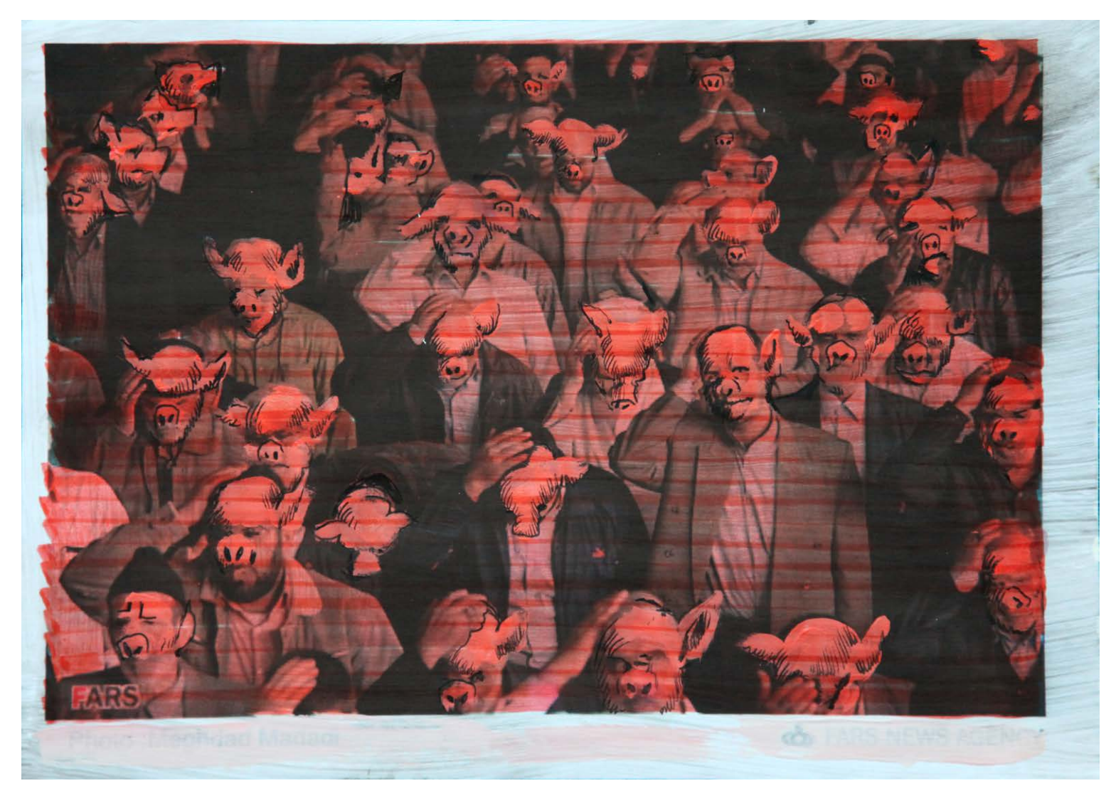
Rokni Haerizadeh. Act Like You Talk. 2010. From the series Fictionville . 2009–ongoing. Mixed media on paper. 29.7 x 21 cm. Sharjah Art Foundation Collection.

The grand master of grotesque realism is Francisco Goya. Living in a period of brutal religious and secular authoritarianism in eighteenth- and nineteenth-century Spain – under the twin terrors