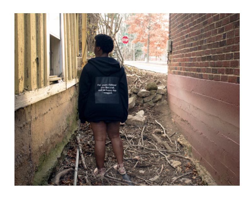
Book of Everyday Instruction, Chapter Eight, 2018 Dye Sublimation Print on Aluminum 16 \times 20 in.