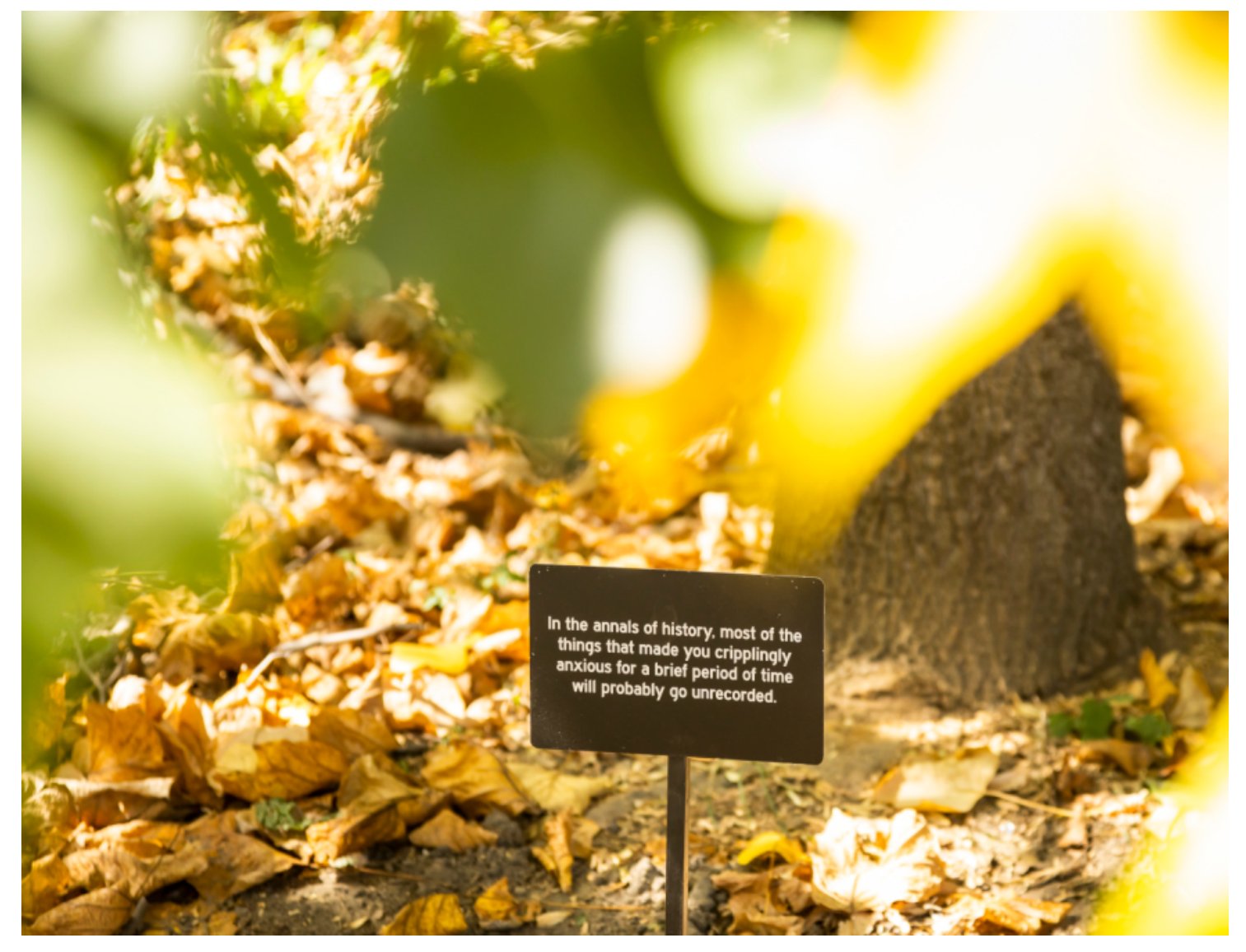
Wayfinding, 2019 Laser Printing on Aluminum 5 x 8 in.