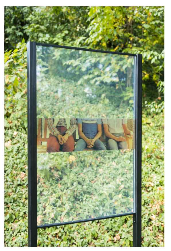
Chloë Bass: Wayfinding , 2019 UV Printing on Acrylic 36 x 24 in.

jr / I, too, miss just being in the city and stumbling onto something new — being activated and invisible at the s seems connected to "the materialization of life … being lost as we live it." I also often think of interstitial space k to the speed at which experience becomes recognizable in the brain, as we are basically seeing the world millise past. Somehow we are always in between moments.