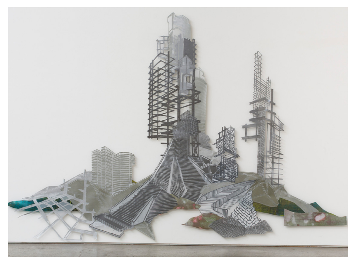
An installation view of Nicola Lopez's "Barren Lands Breed Strange Visions."