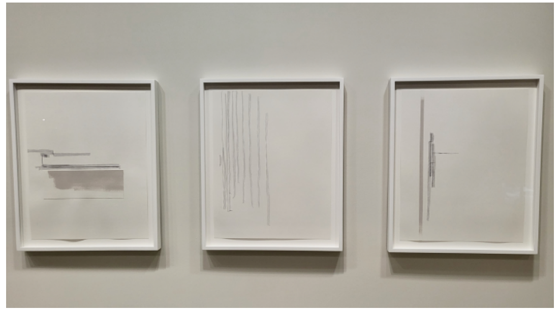
Jennie C. Jones, "A Score for Tenderness and Grace" (2021) set of ten ink, acrylic, and paper collages, mounted on paper

In some ways listening is a state of mind, or a mood, as much as it is an act of intention.