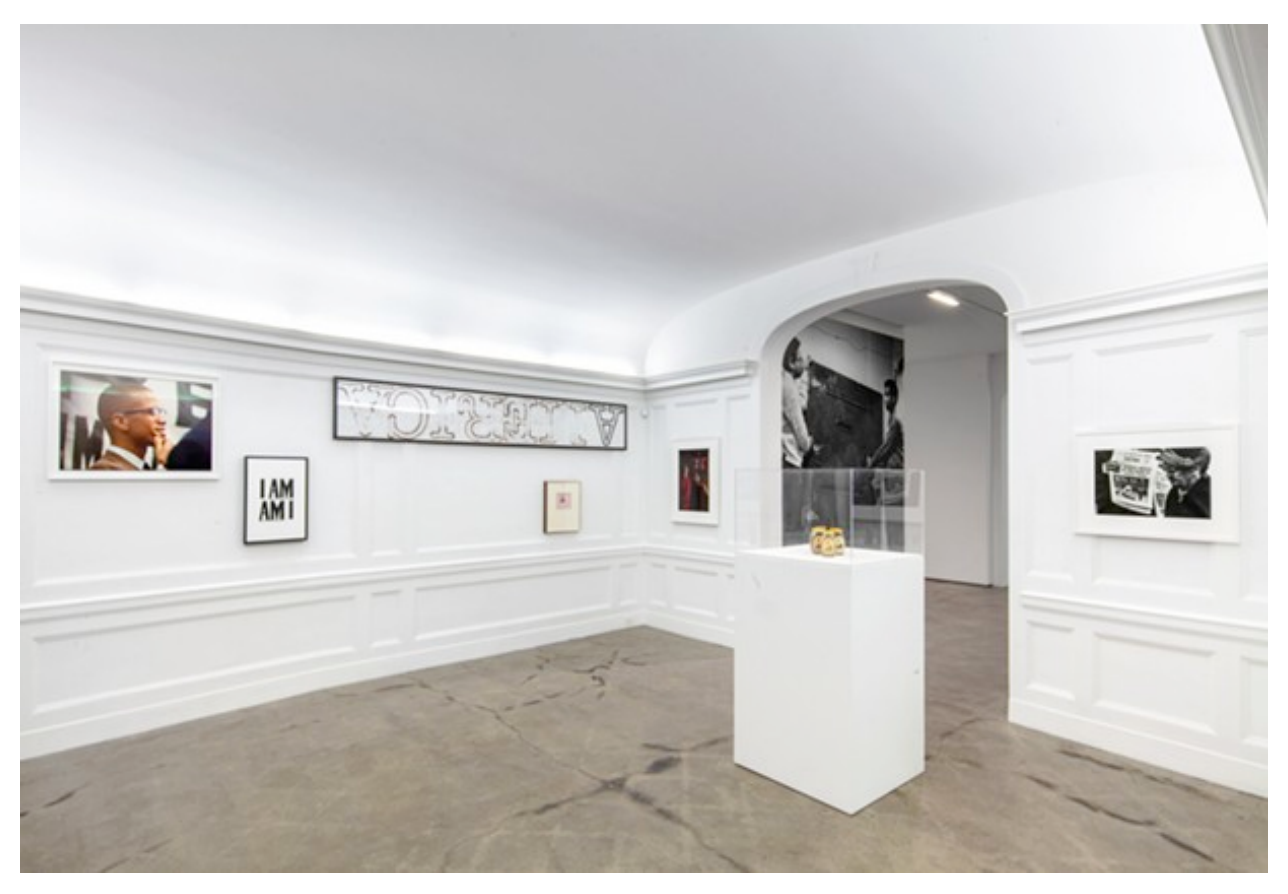
An exhibition view of "This Tender, Fragile Thing" at The School in Kinderhook.

The Latest Exhibition Explores Our Legacy Civil Rights & the Slipperiness of Social Progress By Sparrow | Last Updated: 02/01/2022 12:02 pm