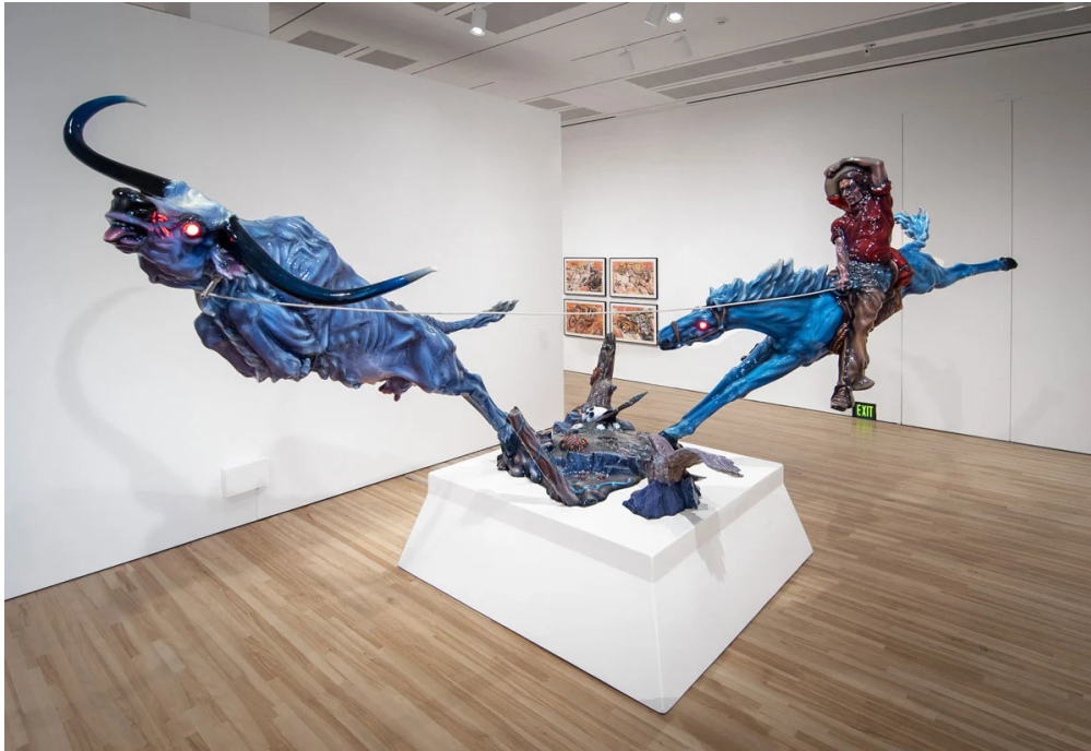
Installation view of “Border Vision: Luis Jiménez’s Southwest,” 2021–22, at Blanton Museum of Art, Austin.

Ferrer's Latinx Photography in the United States: A Visual History , both of which detail early photographic contributions by Latinx artists.