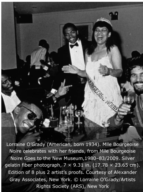
Lorraine O'Grady (American, born 1934). Mlle Bourgeoise Noire celebrates with her friends, from Mlle Bourgeoise Noire Goes to the New Museum, 1980–83/2009. Silver gelatin fiber photograph, 7 × 9.31 in. (17.78 × 23.65 cm). Edition of 8 plus 2 artist's proofs.

and sharing with others what it means for her to be a Black woman in the world.... So much of it is about her personal story so her body becomes the anchor for how she talks about that.”