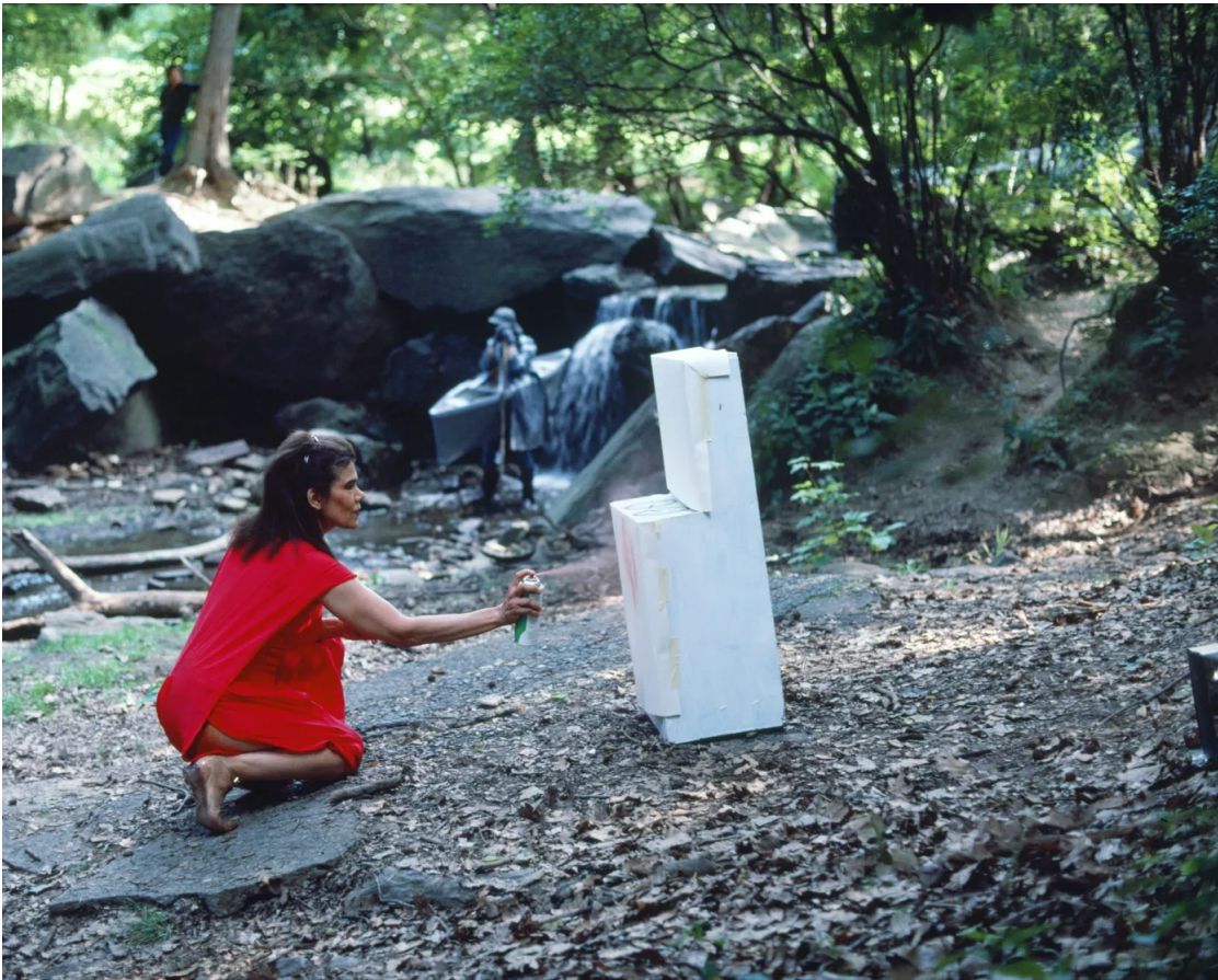
Lorraine O'Grady (American, born 1934). Rivers, First Draft: The Woman in Red starts painting the stove her own color, 1982/2015. Digital chromogenic print from Kodachrome 35mm slides in 48 parts, 16 × 20 in. (40.64 × 50.8 cm). Edition of 8 plus 2 artist's proofs.