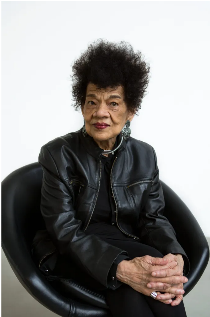
Artist Lorraine O'Grady

On loan from the Brooklyn Museum, the show is the first comprehensive overview of the work of O'Grady, who is considered to be one of the most significant figures in contemporary art. Born in Boston to Jamaican parents, O'Grady led various lives prior to becoming an artist, including work as an intelligence analyst for the US government and a rock critic for the Village Voice and Rolling Stone . The show, which opened at the Weatherspoon on Saturday and runs through April 30, includes much of O'Grady's prominent visual works including photographs of her performance art, collages and a short film, all which result from four decades of her artistic career which she began as a 45-year-old.