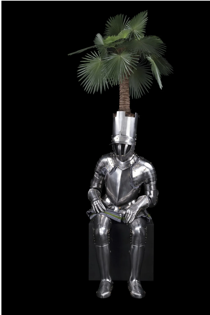
Lorraine O'Grady (American, born 1934). Announcement Card 3 (Seated Palmate) , 2020. Fujiflex print, 60 × 40 in. (152.4 × 101.6 cm). Edition of 10 plus 3 artist's proofs. Courtesy of Alexander Gray Associates, New York. © Lorraine O'Grady/Artists

Debuted in 1980, O'Grady donned the character of Mademoiselle Bourgeoise Noire, or "Miss Black Middle-Class" to disrupt significant spaces within the art world. Dressed in a costume made up of 180 pairs of white gloves while carrying a white cat-o-nine-tails whip, Mlle Bourgeoise Noire would crash locations like the New Museum, a largely white institution, to protest racial segregation in the art world. In 1983, she performed as Mlle Bourgeoise Noire in the annual African American Day Parade in Harlem, where she and other artists dressed all in white rode a parade float adorning a large, wooden picture frame. At the same time, she and the other artists carried around empty frames which they held up to members of the crowd, casting them as works of art.