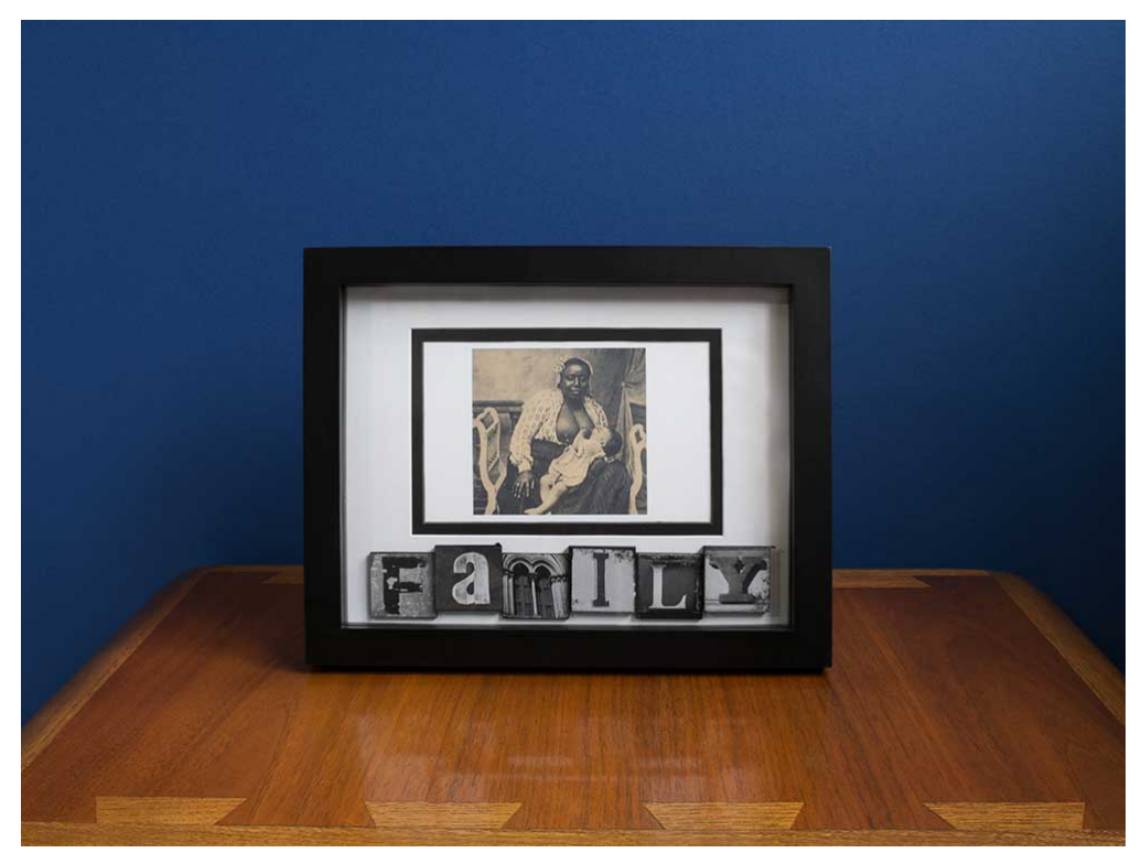
"Steve Locke: Family Pictures" at Gallery Kayafas, Boston, Mass, installation view.

Locke arranges his series of images so the viewer will be fully focused on what is being presented as they move along the tables. The images on the wall repeat in larger format the images that are presented in the vitrines.