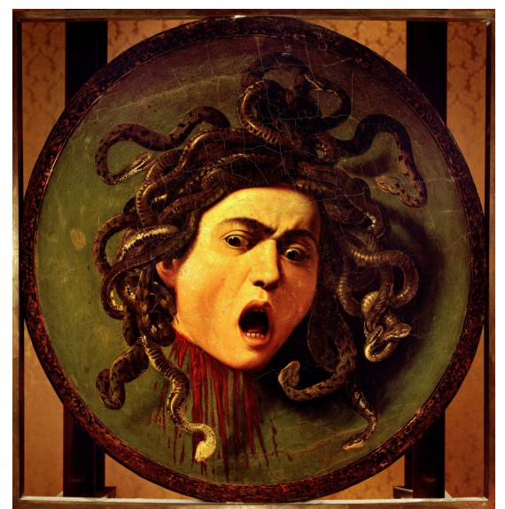
Caravaggio, Medusa , 1597; oil on canvas on wood; 24 by 22 inches. Uffizi Gallery, Florence.

Locke: The history of male depiction is about power. How do you make a man look vulnerable without making him look ridiculous? In my work, I'm much more interested in exploring that idea. What does desire look like, what does failure look like, what does excitement look like? What do those things look like? What do you look like when no one's looking at you? The tongue was a way to talk about vulnerability—standing there with your tongue hanging out because you're either lusting after somebody or you're panting after a run.