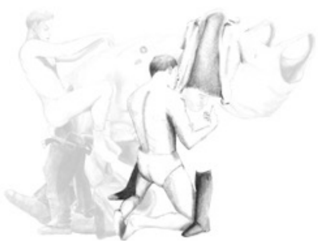
Steve Locke, the constable from the "Rapture" series, 2008.

As for the erotic part of it, I was looking at a lot of pornography and was trying to make the drawings as matter-of-fact and sexless as possible, and in some ways I