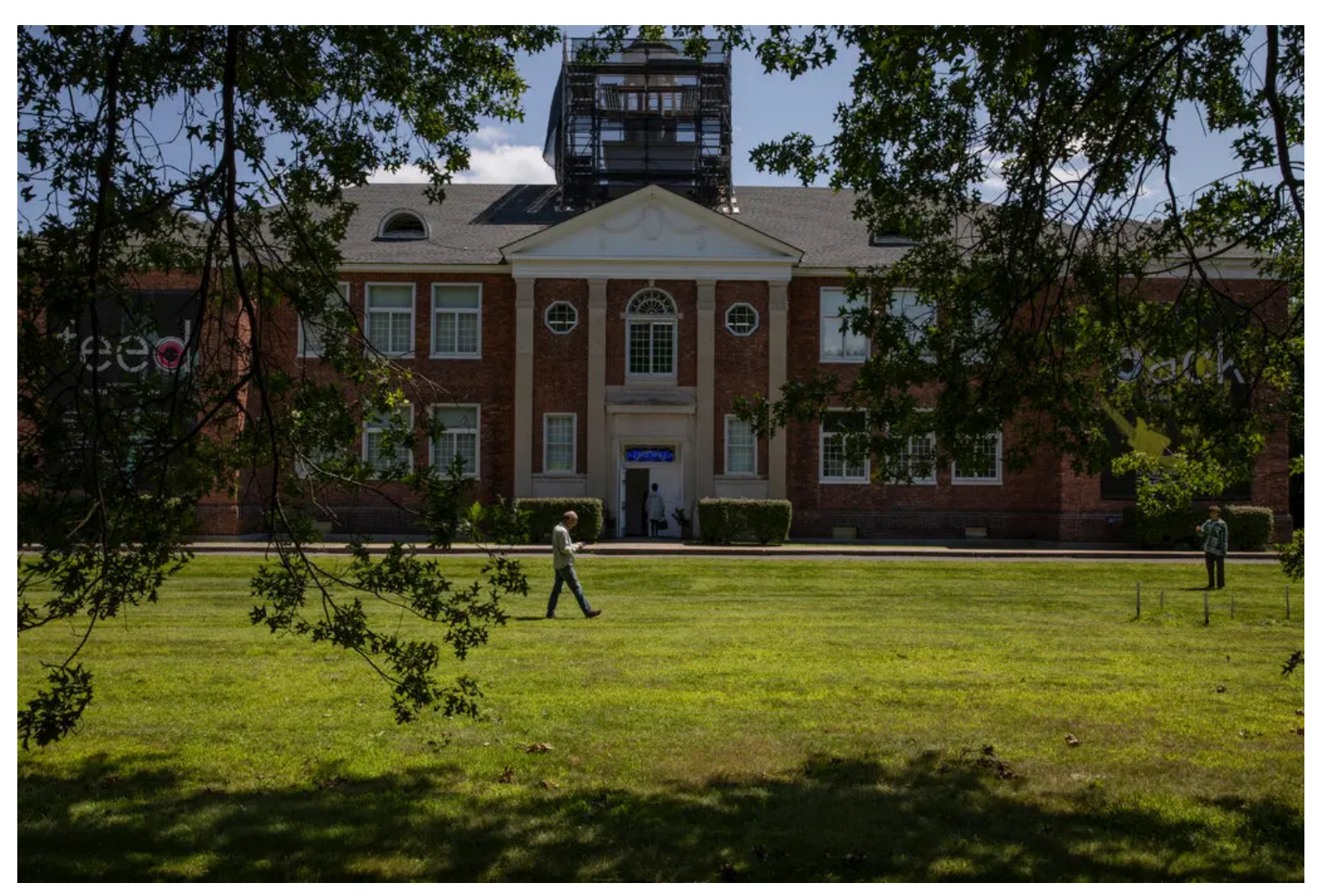
Jack Shainman Gallery's outpost, The School, in Kinderhook, N.Y.

Though the gesture was received at the time as a protest — of the Vietnam War, of racial inequality, of everything wrong with America —Hendrix, himself a U.S. Army vet, was cagey about his intentions. It would probably be truer to borrow some contemporary art jargon and call what he did to the national anthem "complicating" it. Of course protest was a part of it. But it was the tension between his protest and the song's usual bombast, which he also captured, that really summed up his historical moment and made the rendition iconic.