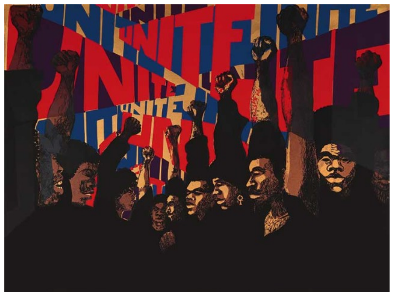
Detail of Barbara Jones-Hogu's Unite, 1971.