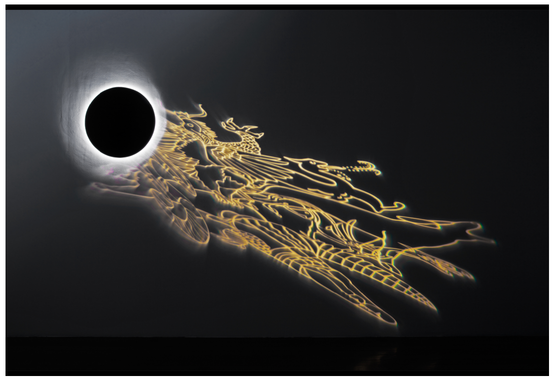
Umbral, 2011. Acrílico, leds, gobo de vidrio, proyección. 245 × 400 cm. Cortesia da artista e Luciana Brito Galeria

Among the programs postponed for almost two years and which will only open to the public in August/September, is the retrospective Regina Silveira: Outros Paradoxos , a long-term exhibition, scheduled for MAC USP (Museu de Arte Contemporânea da Universidade de São Paulo) with all my works that belong to the museum's collection and my participation in the 34th São Paulo Biennial. The visit and interaction with the public will naturally be limited and will be governed by the current and necessary distancing rules.