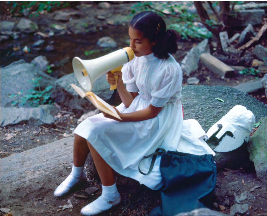
Lorraine O'Grady's "Rivers, First Draft: A Little Girl with Pink Sash memorizes her Latin lesson," 1982/2015. The work was staged in Central Park for passers-by and has been reprised in photographs that she reorganizes for her shows, like a remixer.