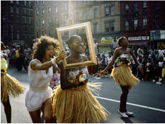
“Art Is... (Dancer in Grass Skirt),” 1983/2009.