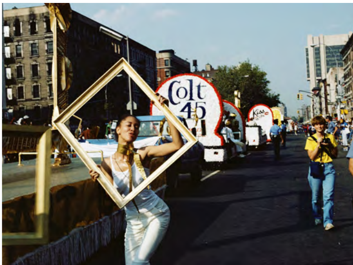
Scenes from Lorraine O’Grady “Art Is. . . (Line of Floats),” 1983/2009. The artist showed up with an unauthorized float — a truck mounted with a gigantic gold picture frame. Credit...Lorraine O’Grady/Artists Rights Society (ARS), New York; Alexander Gray Associates

In “Rivers, First Draft,” staged by a stream in Central Park for a few friends in 1982, actors including O’Grady played scenes that narrated, through allegorical characters — “The Woman in Red,” “The Art Snobs,” “The Debauchees,” and so on — the artist’s own journey from a strait-laced New England Caribbean family to the New York art scene with its apparent freedom but unacknowledged race and gender tensions.