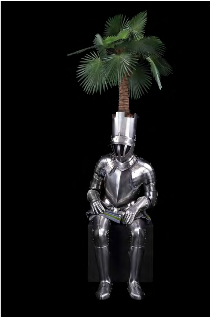
Lorraine O'Grady in her new persona, its symbols suggesting European conquest (armor) and her Caribbean roots (palm tree headgear). It will be revealed at the Brooklyn Museum.

“The times have finally caught up with me, so I don’t feel out of step now,” she said.