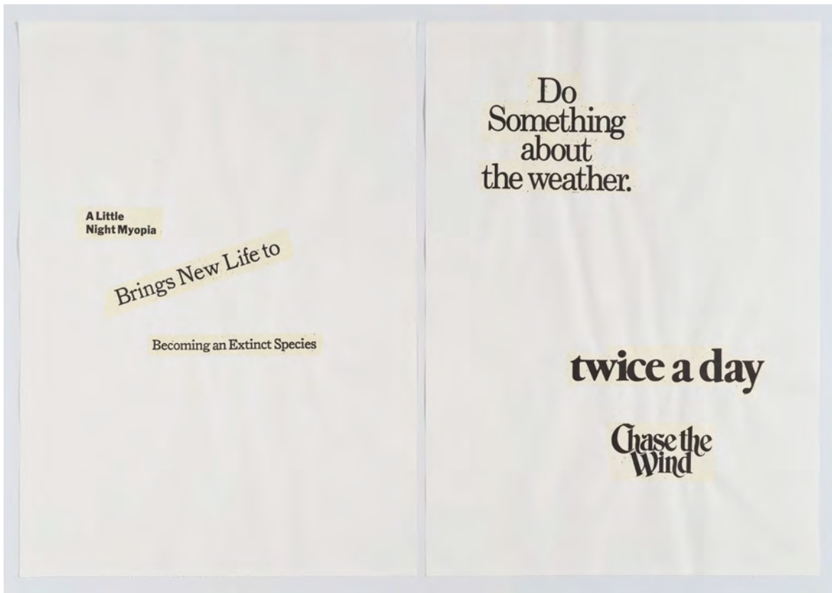
Lorraine O'Grady's newspaper poems, a collage with words cut from the New York Times, "Cutting Out CONY 07," 1977/2017.

But it was Just Above Midtown that provided the setting for her breakthrough. She arrived in 1980 having learned it was the haunt of regulars such as David Hammons and Senga Nengudi.