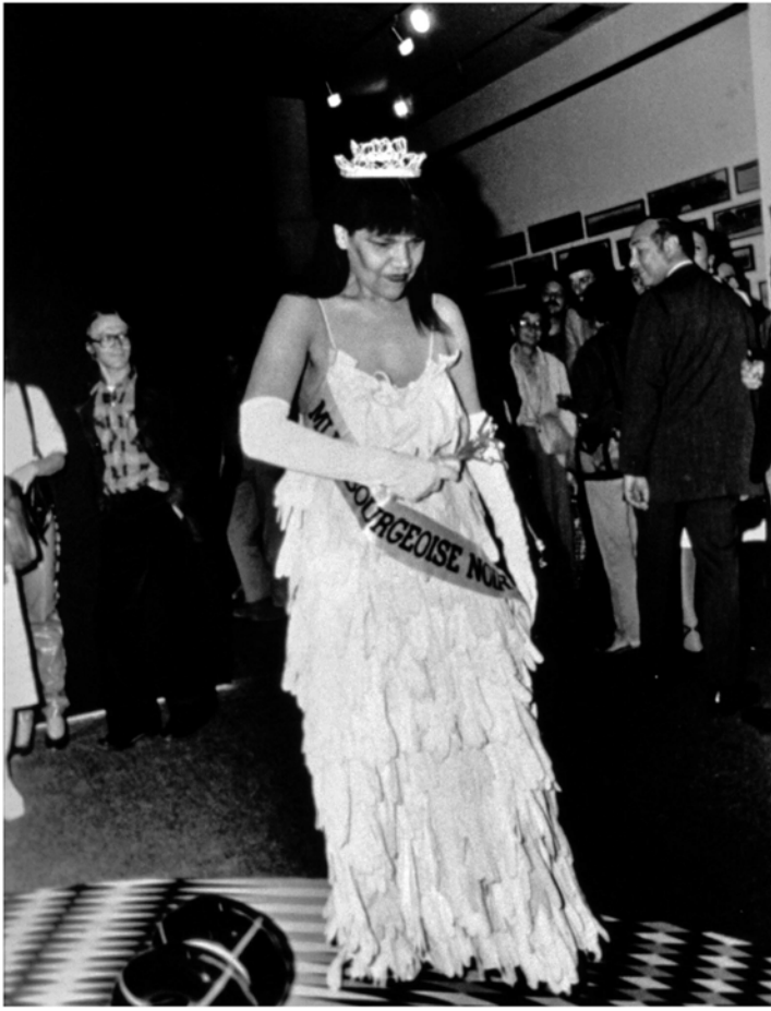
Lorraine O'Grady's shock appearance as the character Mlle Bourgeoise Noire at the New Museum in 1981. She documented the appearance and subsequently exhibited the photographs. Lorraine O'Grady/Artists Rights Society (ARS), New York; Alexander Gray Associates