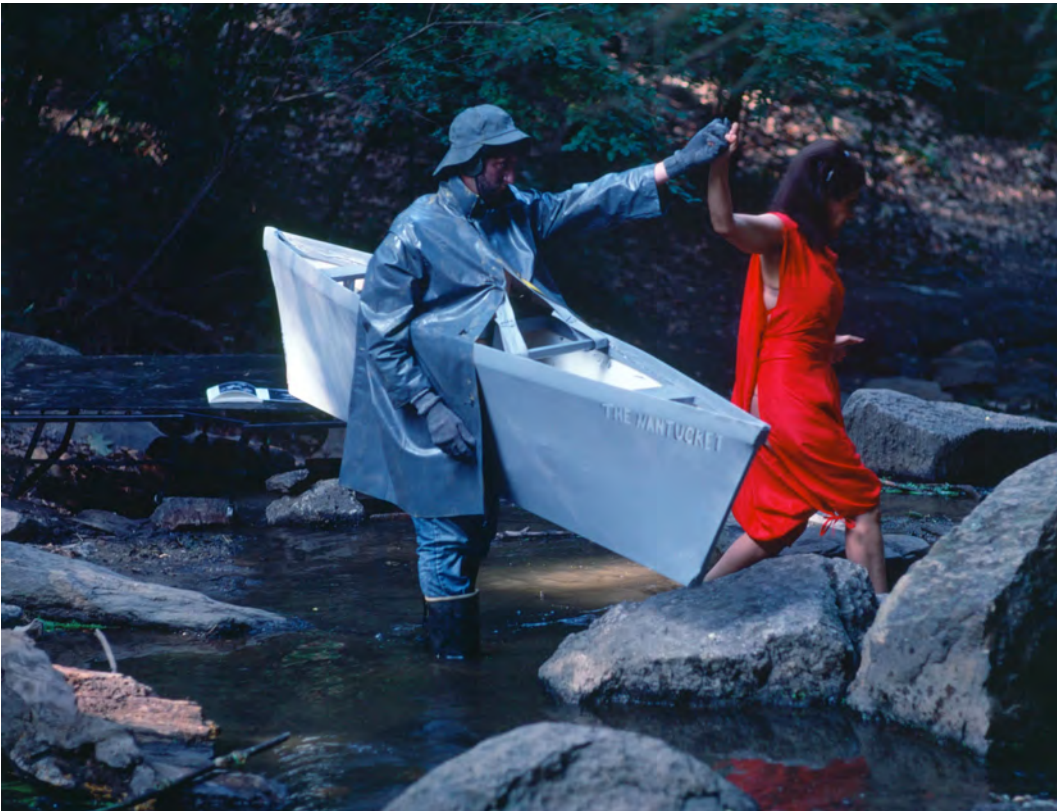
Lorraine O’Grady’s “Rivers, First Draft: The Nantucket Memorial guides the Woman in Red to the other side of the stream,” 1982/2015.