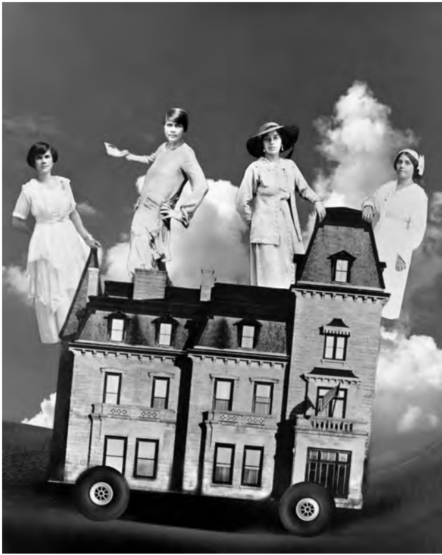
Her photomontage, “The Strange Taxi: From Africa to Jamaica to Boston in 200 Years,” 1991/2019, incorporates women from O’Grady’s family trying to escape restrictions of Boston.