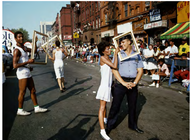
“Art Is.. (Cop Framed),” 1983/2009. The work is much admired, and imitated. Performers she had recruited jumped into the crowd carrying small frames, inviting people to pose, to see themselves as art.