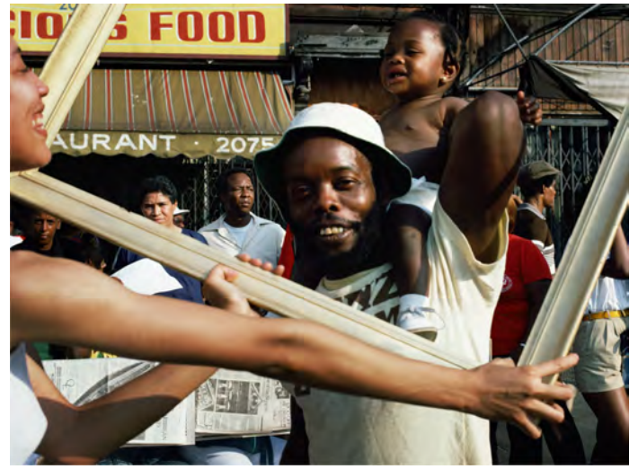
Lorraine O’Grady, “Art Is... (Man with Baby),” 1983/2009. Credit...Lorraine O’Grady/Artists Rights Society (ARS), New York

Another defining intervention, “Art Is...,” in 1983, took place at a parade in Harlem. O’Grady showed up with an unauthorized float — a flatbed truck mounted with a gigantic gold picture frame. Performers she had recruited jumped into the crowd carrying small frames, inviting people to pose, to see themselves as art.