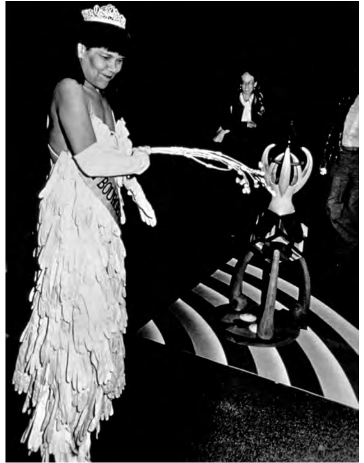
Mlle Bourgeoise Noire in character at the New Museum with the Whip-That-Made-Plantations-Move, from O'Grady's "Untitled (Mlle Bourgeoise Noire)", 1980-83/2009. Lorraine O'Grady/Artists Rights Society (ARS), New York; Alexander Gray Associates

The plumage of white gloves symbolized the repressed psychology of the Black middle class, consumed with respectability. The whip represented the history of external violence that conditioned it. Her critique was that Black artists should scrutinize their own privileges. Barging into the venue, she handed out flowers, then proceeded to flail herself with the whip, declaiming a poem. It concluded with the shout: "Black Art Must Take More Risks!"