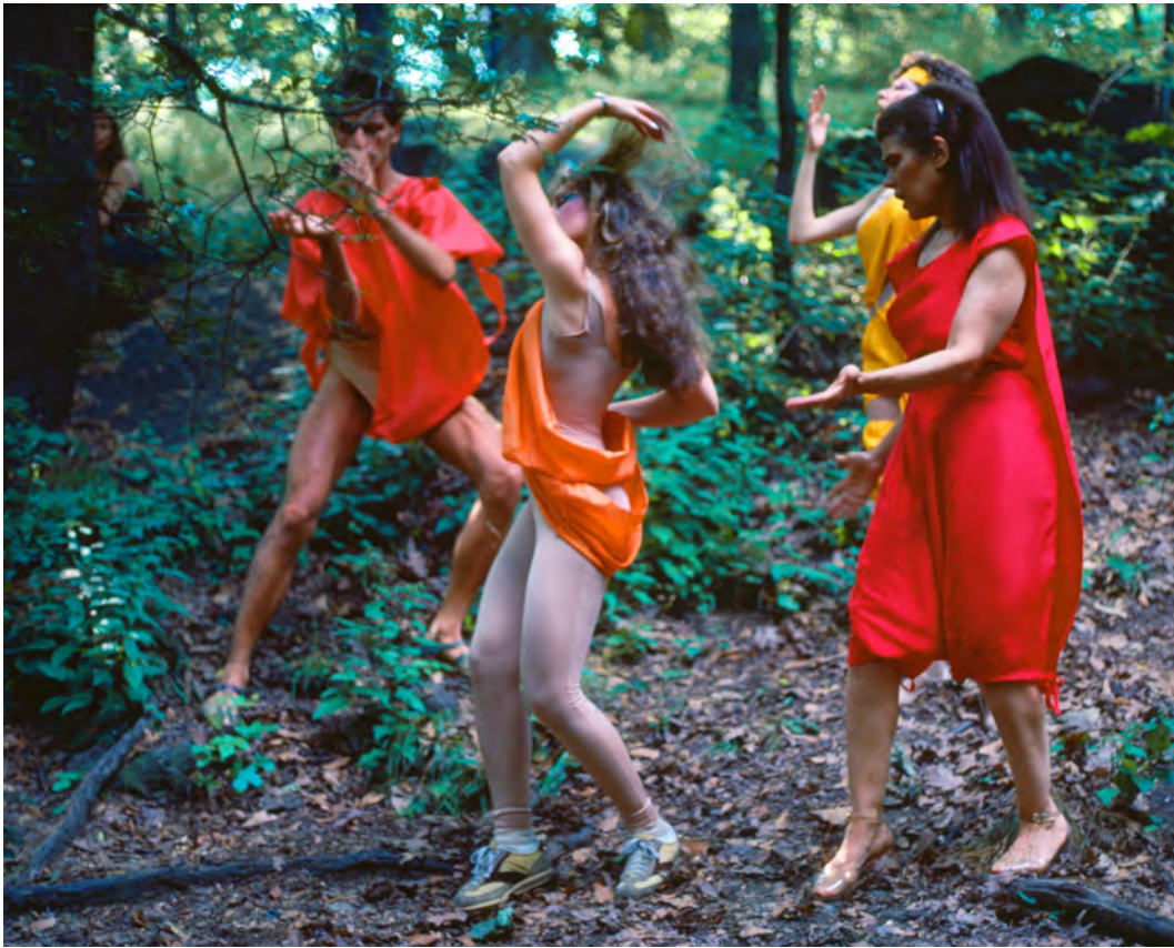
“Rivers, First Draft: The Debauchees dance in place, and the Woman in Red catches up to them,” 1982/2015. It showed apparent freedom, but revealed unacknowledged tensions. Lorraine O’Grady/Artists Rights Society (ARS)New York; Alexander Gray Associates