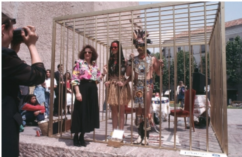
Coco Fusco and Guillermo Gómez-Peña: Two Undiscovered Amerindians Visit Madrid, 1992 , performance.