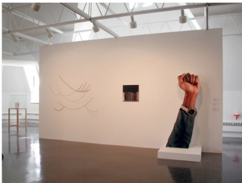
View of the exhibition “Black Is, Black Ain’t,” 2008, at the Renaissance Society, Chicago.