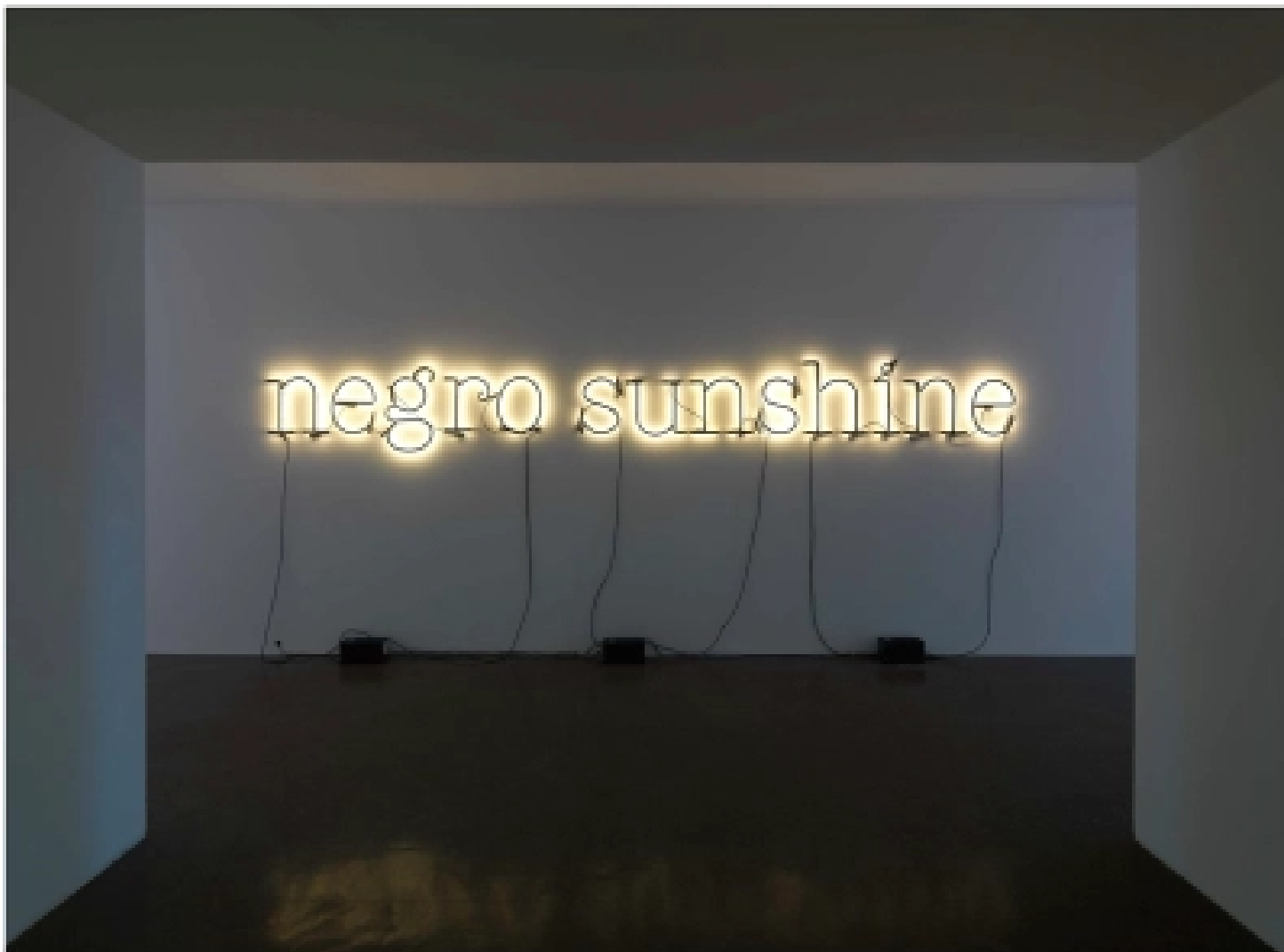
View of the exhibition "Black Is, Black Ain't," 2008, showing Glenn Ligon's neon sculpture Warm Broad Glow , 2008, at the Renaissance Society, Chicago.

BY Hamza Walker, Coco Fusco November 16, 2020 11:53am