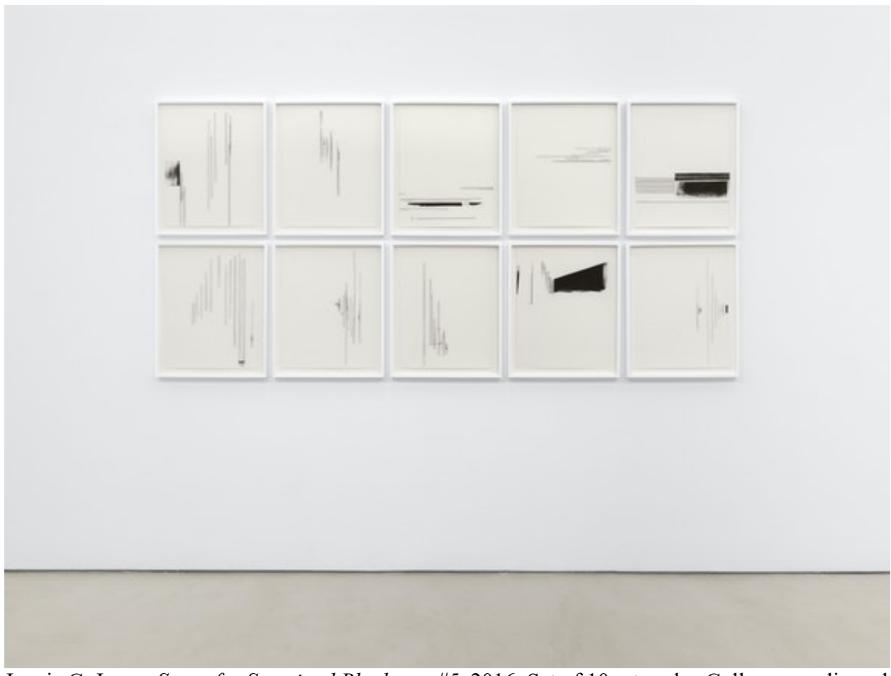
Jennie C. Jones, Score for Sustained Blackness #5, 2016. Set of 10 artworks. Collage, acrylic and ink on paper in 10 parts, 20 x 16 inches each. Courtesy Alexander Gray Associates, New York; Patron Gallery, Chicago, IL. © Jennie C. Jones /Artists Rights Society (ARS), New York.

Equally innovative in her interrogation of unconventional materials and in her elaboration of "topographical" images, Valeska Soares repurposes a series of Brazilian wooden marquetry boxes, once used as cigar boxes, sewing kits, and keepsake holders, among other mundane objects, in Palimpsest (I) (2016). The boxes depict idyllic Brazilian landscapes, like beaches, the lush vegetation of coconut trees and araucarias, and hills. Soares is in dialogue with the phenomenological experimentation of Neo-Concretism, which is activated by the viewer, and the post-1960s Minimalist installation and assemblage lineages throughout the Americas and Europe. She presents the boxes at eye level in a pleasing panoramic view, semantically charged with memory, nostalgia, absence, and ephemerality. The "drawings" come together at key points: a mountain in one case connects to the lake in another, a river flows into the sea in another one, creating a single vista that invokes both the absent makers of the boxes and the objects they may have once held. Like everything in this exhibition, these enthralling little landscapes guide the viewer from one narrative to another, unveiling past histories and malleable boundaries.