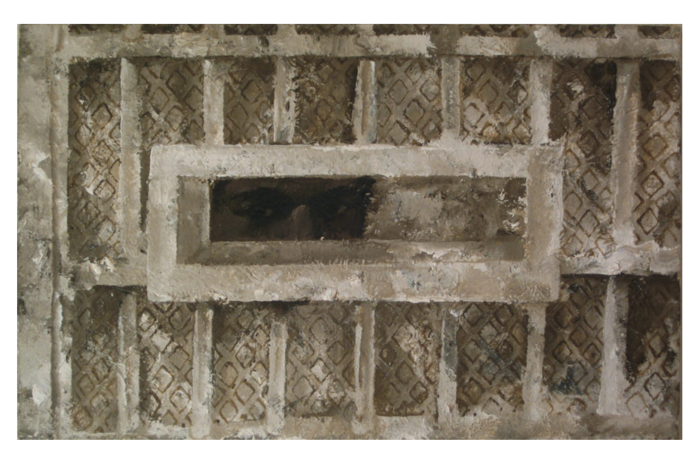
Martin Wong, "Cell Door Slot," 1986.

That phrase is the starting point for "Walls Turned Sideways: Artists Confront the Justice System," an exhibit at the Tufts Aidekman Arts Center. The show includes 51 works by 34 artists who in the past 40 years have examined aspects of a sprawling system that now imprisons nearly 25% of the world's incarcerated, even while the country itself makes up only a scant 5% of the global population.