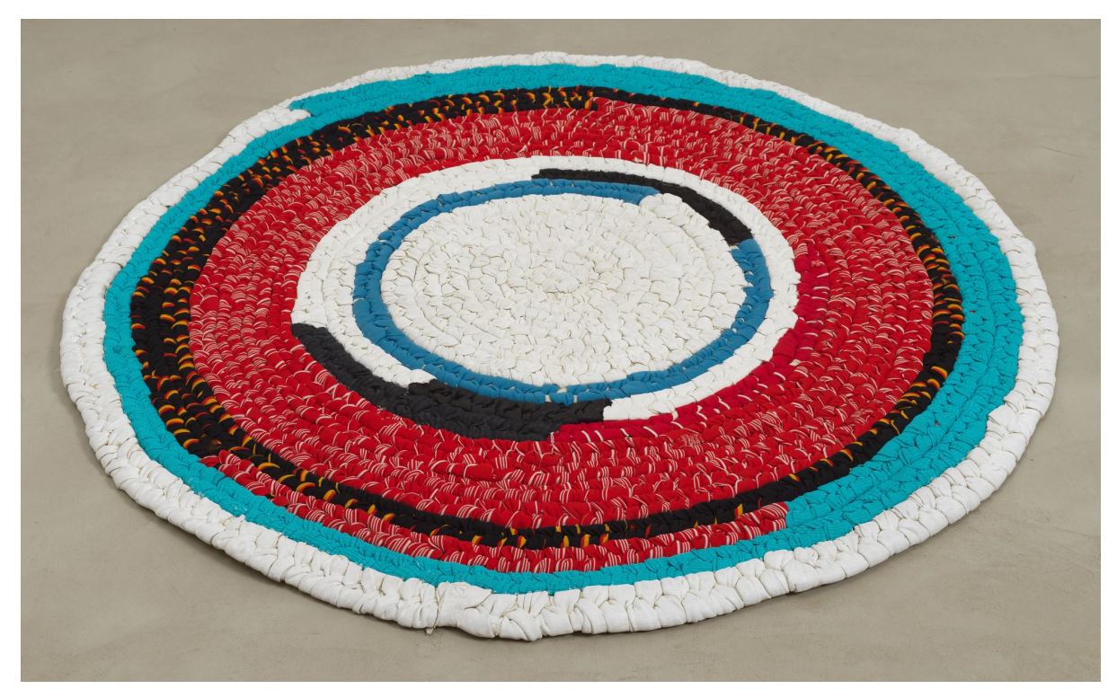
Harmony Hammond's "Floorpiece IV," 1973, acrylic on fabric. Harmony Hammond/Artists Rights Society (ARS), NY; Jeffrey Sturges