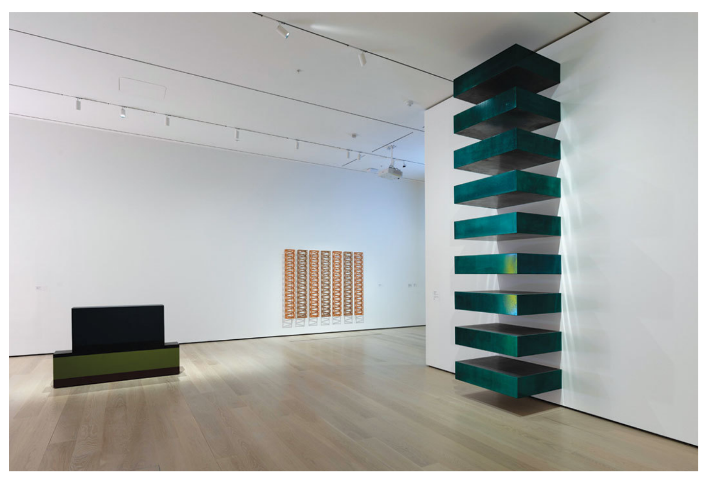
View of "Breaking the Mold," 2019–, Museum of Modern Art, New York. From left: Anne Truitt, Catawba , 1962; Rasheed Araeen, (3+4) SR, 1969; Donald Judd, Untitled , 1967.

modernism seriously. Museums are big ships that turn slowly in the night, and MoMA in particular, as the grandest one in the modern and contemporary fleet, operated at the leisurely pace that is the privilege of vessels so imposingly gigantic they don't have to worry about outsailing threats.