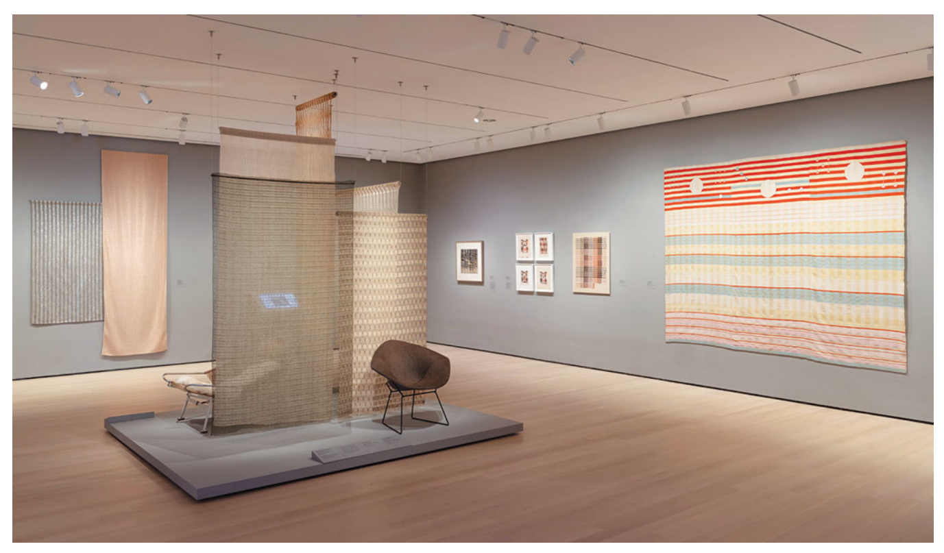
View of "Taking a Thread for a Walk," 2019–20, Museum of Modern Art, New York.

Vuillard painting of the woman emerging from the wall? The James Ensor frieze of ghouls rendered in the colors of seashells? The Baroness Elsa von Freytag-Loringhoven's Dada Portrait of Berenice Abbott ? As they say in New York, "What's not to like?"