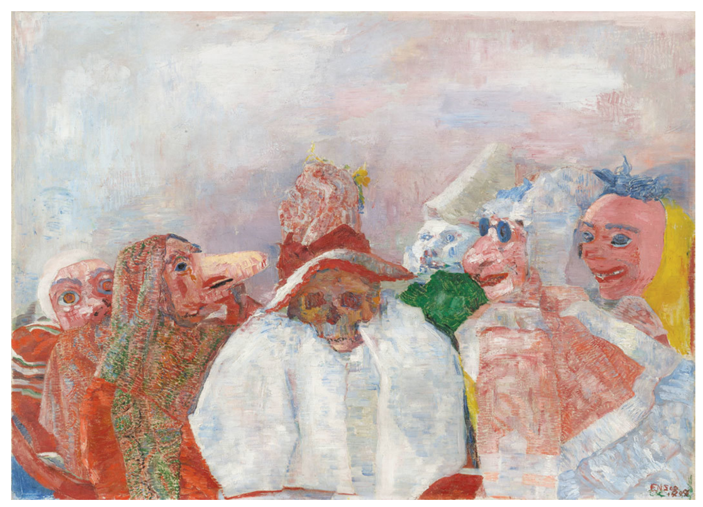
James Ensor, Masks Confronting Death, 1888, oil on canvas, 32 × 39 1/2".

The work of diversification and parity in the name of a more complex story of art has been ongoing for some time now.