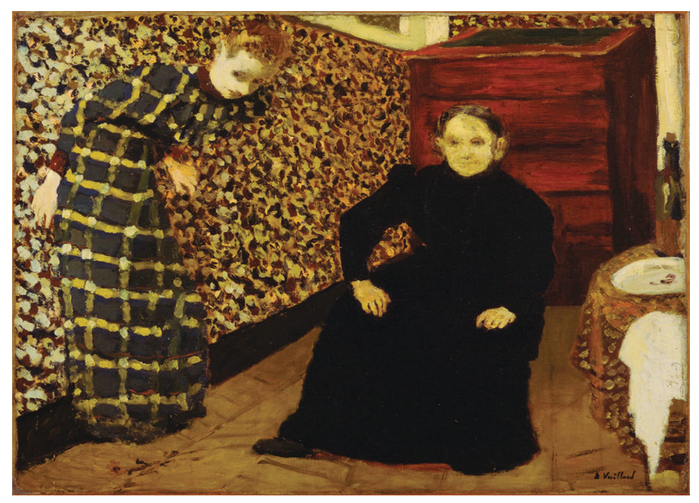
Édouard Vuillard, Interior, Mother and Sister of the Artist, 1893, oil on canvas, 18 1/4 × 22 1/4".

This new lineup of proper names—Nengudi, Hassinger, Semmel, Mendieta, and Noland (now there's a corrective to the popular art-history textbook Art Since 1900 )—made my synapses fire on all cylinders. The overall effect is a radical reframing of the critically beloved and largely unassailable Noland, one that provisionally suspends her work's typical cynical snarl to make way for the pathos that accompanies the at once quotidian and world-historical effects of patriarchal violence. All the while, behind you, Mendieta's ur-female form lies mute, silently attesting to the way women's lives are unspeakably fucked with by men. I wouldn't be surprised if the ghost of Jackie O. herself occupies the room every now and again.