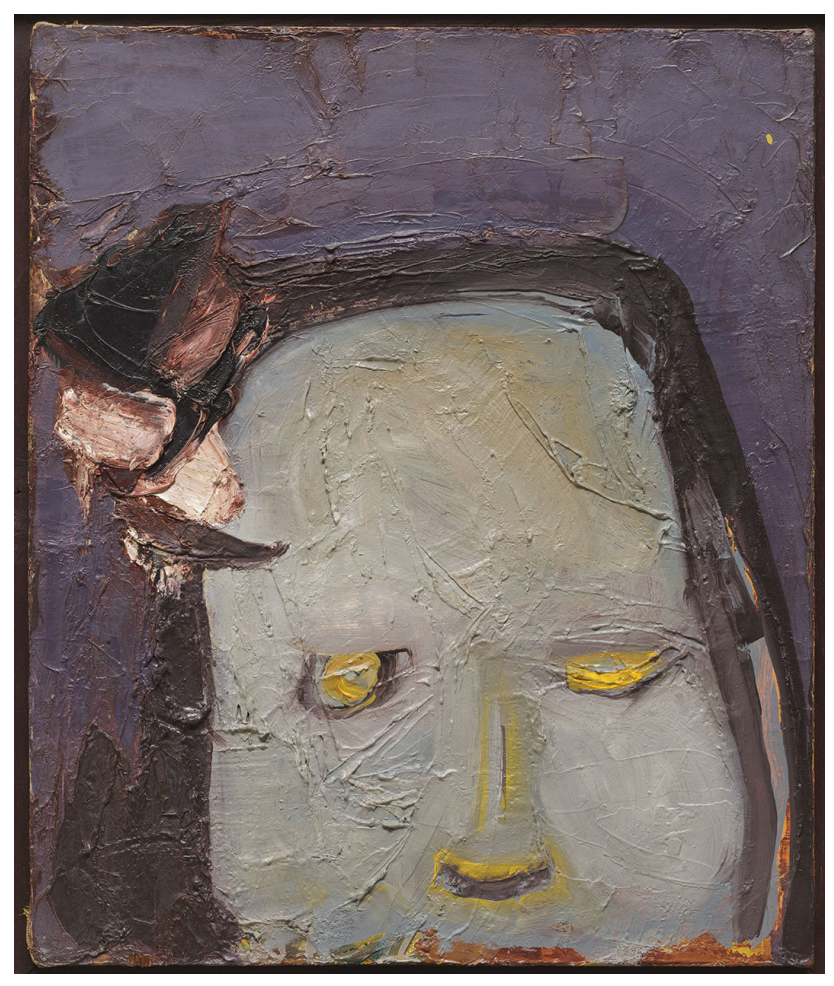
Eva Hesse, Untitled, 1960, oil on canvas, 18 × 15".

and critical—publicly. This is particularly important given what I consider to be the failure of the presentation of "installation art" on the sixth floor. The staging felt more like the special-projects section of an art fair than a carefully considered curatorial statement; you could practically feel the fatigue of too many long-haul flights. I say this regretfully, since I have enormous admiration for most of MoMA's curators and for many of the artists included. However, the long arm of the art fair–biennial circuit reaches everywhere in museum culture today, and if we don't wrestle with its meanings and effects, it will eclipse what remains of the contemplative and scholarly in our institutional work.