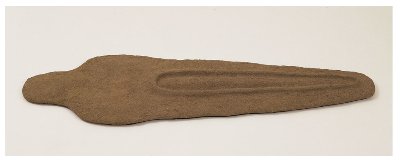
Ana Mendieta, Nile Born, 1984, sand and binder on wood, 23/4 \times 191/4 \times 611/2 ".

women, we can hardly claim a generational victory just yet), we find ourselves at the beginning of the next wave of critique. And, plus ça change , this fight will be waged by the newest inductees to the game. Bluntly put, there is a growing generational divide between museum staff in their twenties and thirties and those in their fifties and sixties. New battle lines have appeared around workplace culture (the call to unionization and the challenge to end unpaid internships) and around the structure of philanthropy (the call to remove trustees). Both of these issues go to the very heart of how museums function. The struggle will no longer focus exclusively on the content of what we exhibit, but rather will center on the form of the museum itself.