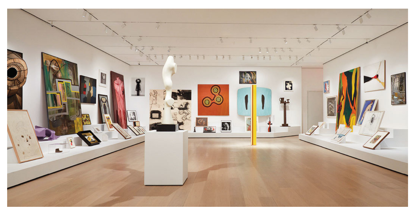
View of "Artist's Choice: Amy Sillman," 2019-20, Museum of Modern Art, New York.

As the market scaled upward to accommodate trustees' pocketbooks, it's possible that many of us who had been laboring on issues of diversification pulled our punches too many times for too long.