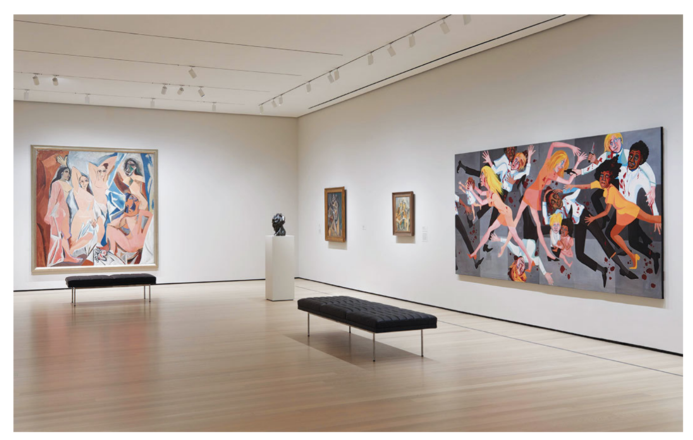
View of "Around Les demoiselles d'Avignon," 2019–, Museum of Modern Art, New York. From left: Pablo Picasso, Les demoiselles d'Avignon, 1907; Pablo Picasso, Woman's Head (Fernande), 1909; Pablo Picasso, Woman with Pears, 1909; Pablo Picasso, The Reservoir, Horta de Ebro, 1909; Faith Ringgold, American People Series #20: Die, 1967.

I could parse the MoMA galleries for days, and as the collection rotation unfolds, we will all have many more chances to weigh in. But, in keeping with the theme of "the times they are a-changin'," I confess it feels like other questions are currently more pressing: What will happen if MoMA can no longer be used as art history's straw man? What does a discourse, or a field, do without a bad object? These questions lead me to wonder if we are currently trading bad objects for bad actors. The protests held on opening night, designed to draw attention to the ways various MoMA trustees make their profits, suggest that even if the past thirty years of rabble-rousing have not quite completed their aims (since only 28 percent of the art currently on view has been made by the people we conventionally call