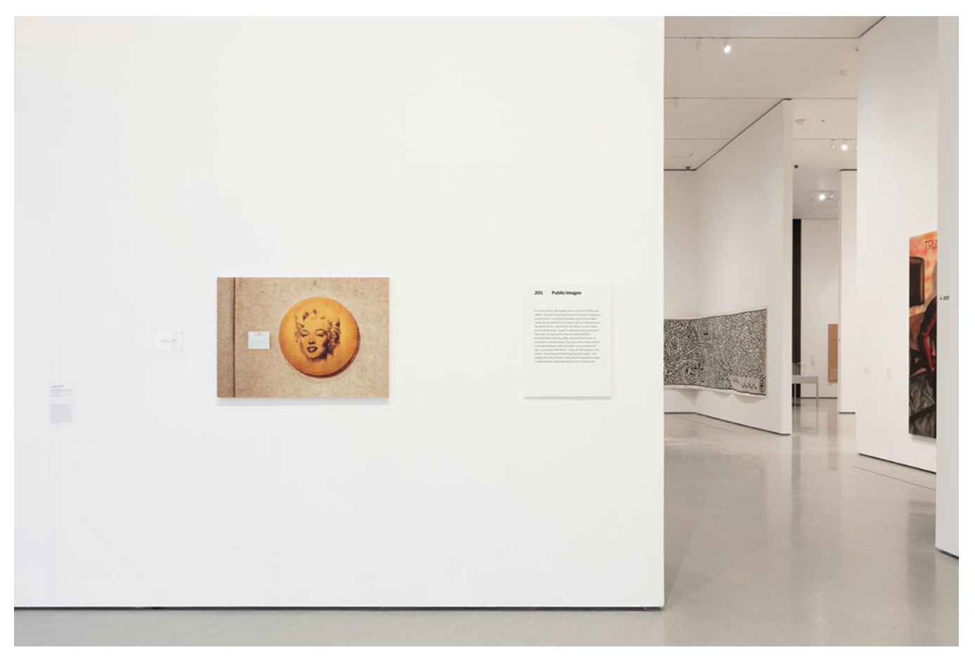
Louise Lawler, Does Andy Warhol Make You Cry?, 1988, silver dye bleach print, text on Plexiglas wall label. Installation view, Museum of Modern Art, New York, 2019.

There is indeed much to love about the improved MoMA, although it's important to note that while the experiment with diversity writ large is novel for this institution, it isn't new for many museums across the country. This work has been going on for the past three decades. It happened slowly, through the contributions of many individuals: academics, curators, artists, activists, all rethinking and deepening our ideas of parity, colonialism, and medium specificity in order to better understand a transnational art history and a remapped present without centers and peripheries. Curators have been reinstalling their galleries in ways that made sense for their heterogeneous audiences—one need only look to the Saint Louis Art Museum; the Museum of Contemporary Art Chicago; Crystal Bridges Museum of American Art in Bentonville, Arkansas; the Virginia Museum of Fine Arts in Richmond; and the Whitney Museum of American Art in New York for examples of how the work of diversification and parity in the name of a more complex story of art has been ongoing for some time now. MoMA was slow to take the challenges to white-male