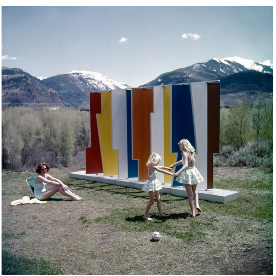
Herbert Bayer's Kaleidoscreen installed in Aspen, Colorado, as captured in a photograph from the 1950s.