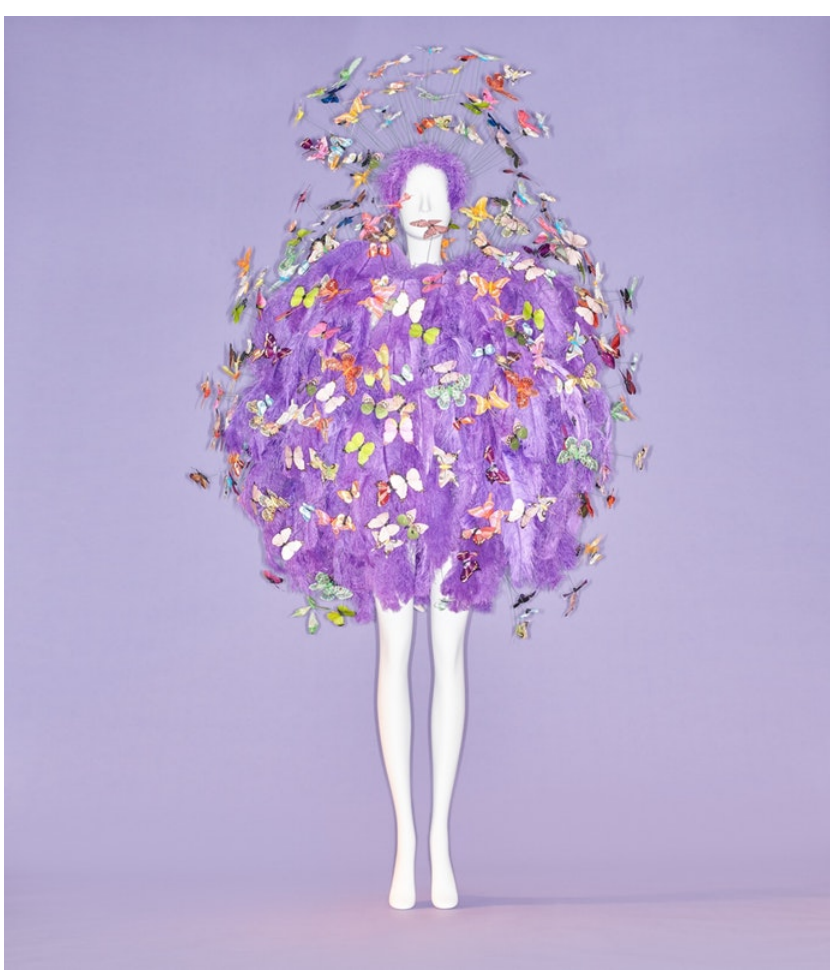
Courtesy of Moschino, image courtesy of the Metropolitan Museum of Art, photo © Johnny Dufort, 2019

This ensemble by Jeremy Scott for House of Moschino will be on view at the Metropolitan Museum of Art.