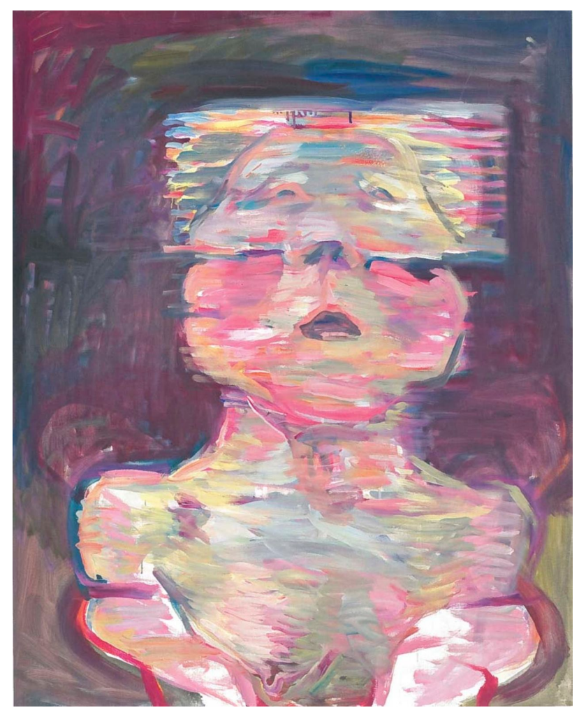
Maria Lassnig's 'Transparent Self-Portrait' (1987)

Thek's "Hippopotamus Poison" (1965) is a creepy, gothic treat.