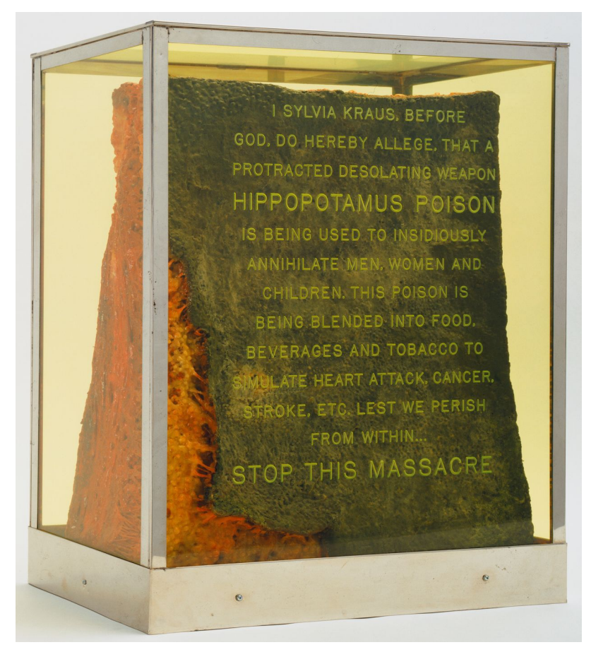
Paul Thek's 'Hippopotamus Poison' (1965)

York museum there is no "Before and After 9/11" section); and in "Print, Fold, Send," another section of the show, enough office-work-looking paper to make the place seem like a trading floor.