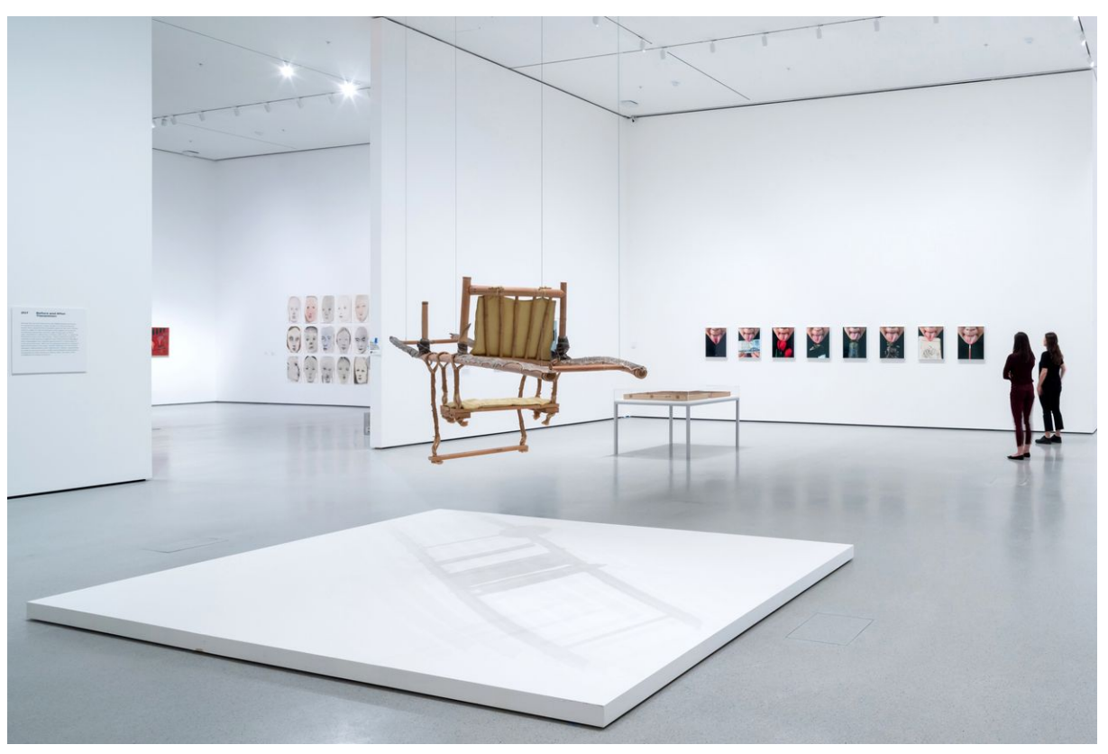
Installation view of the 'Before and After Tiananmen' gallery

The Museum of Modern Art navigates the treacherous waters of contemporary art.