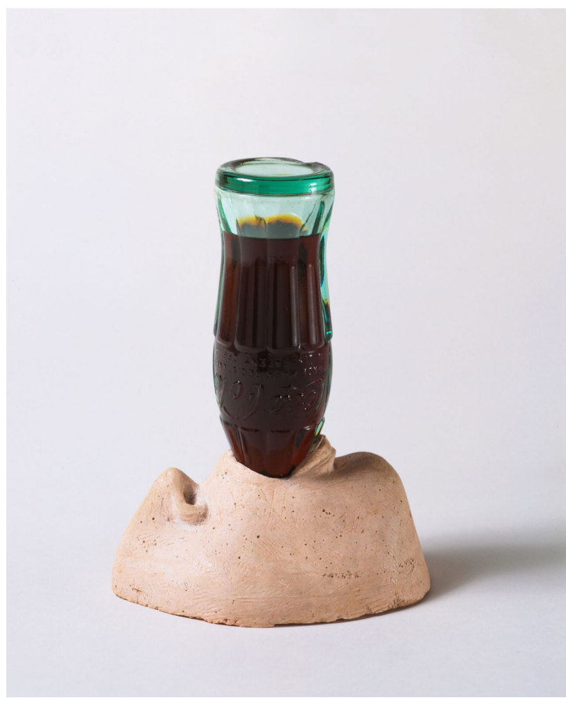
Marisol's 'Love' (1962) PHOTO: MARISOL/MOMA, NY