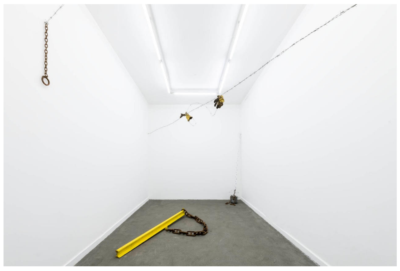
Melvin Edwards, Continuous Resistance Room, 2019, steel, chains, barbed wire and pair of gloves, Variable dimensions, 220 15:32 x 116 9:64 x 141 47:64 in.

This time Edwards, who's lived in New York City since 1967, produced all his steel, chains and barbed-wire sculptures during a twenty-day residence in São Paulo at the mid-century home that has housed auroras since 2016. The work, a visceral cry of resistance and outrage against racism and violence, resulted in the one-room installation "Continuous Resistance Room"; a barbed-wire installation "Curtain Calls"; fourteen medium-to-small floor and wall sculptures; and twelve watercolors. An impressive production considering the eighty-one-year-old ex college football player selected the scrap metal, designed and welded all his abstract assemblages from scratch in an exceptionally hot summer season.