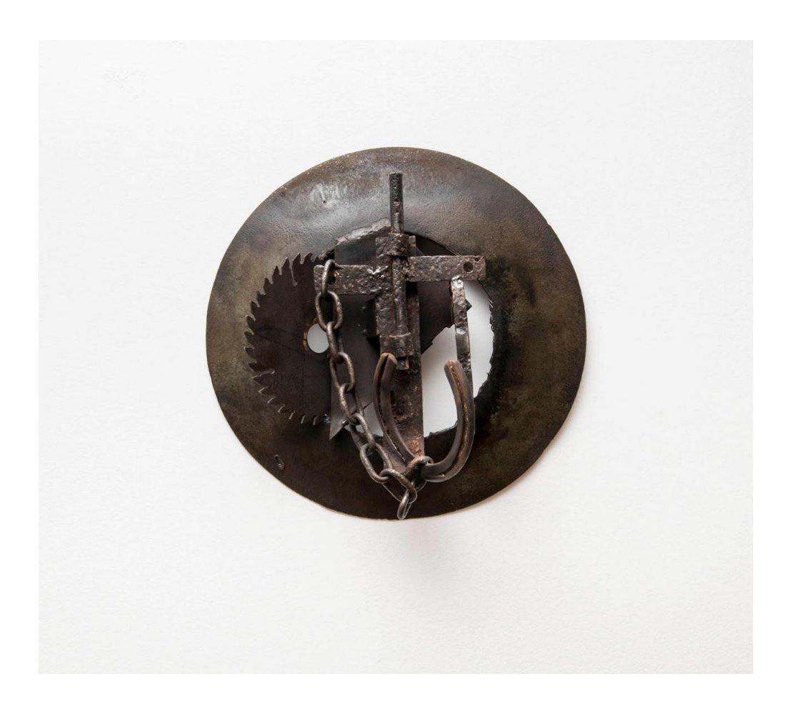
Melvin Edwards, Good Luck, First Day, 2019, steel, 14 9:16 x 14 9:16 x 5 29:32 in. Photo Ding Musa. Courtesy of the artist and auroras

MARCH 12, 2019 AT 9:30 AM BY CYNTHIA GARCIA