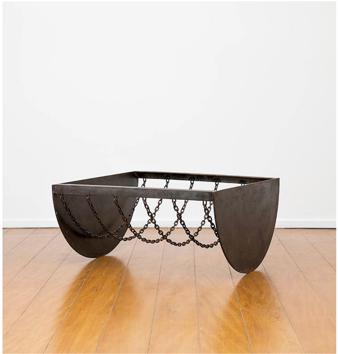
Melvin Edwards, Coco Variations SP, 2019, steel and chains, 220 15:32 x 116 9:64 x 141 47:64 in.