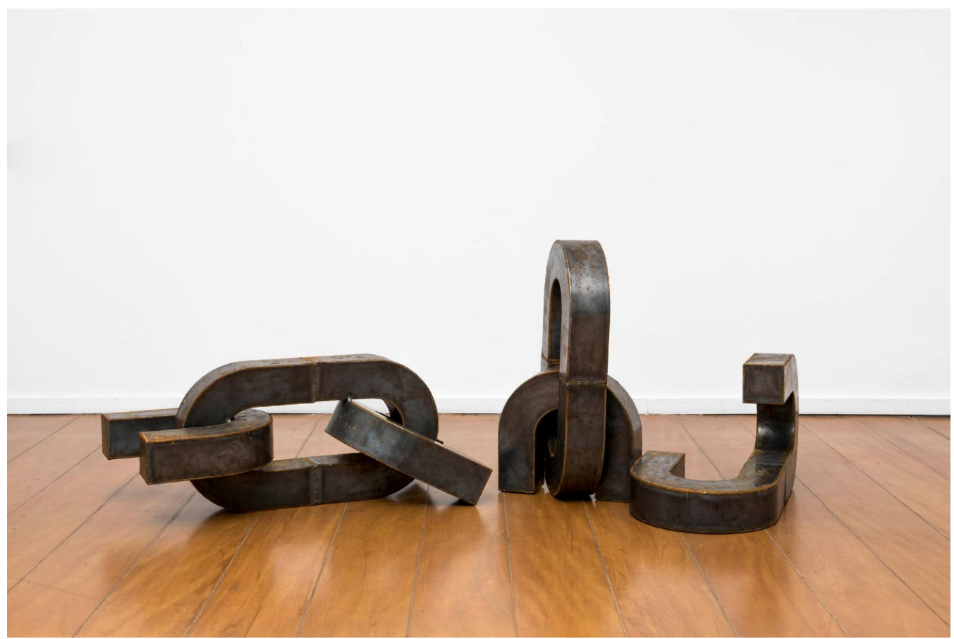
Melvin Edwards, Song of the Broken Chains, 2019, (Model for Monument), steel, 72 3:64 x 2711:64 x 24 51:64 in.

Brazilian public other aspects of Melvin's work, such as his barbed-wire installations, large sculptures and works on paper.