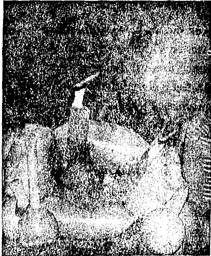
Someone's getting all wrapped up in the show.

In response to this invitation, visitors soon got into the spirit of the sculptures and became personally involved in the pieces on display.