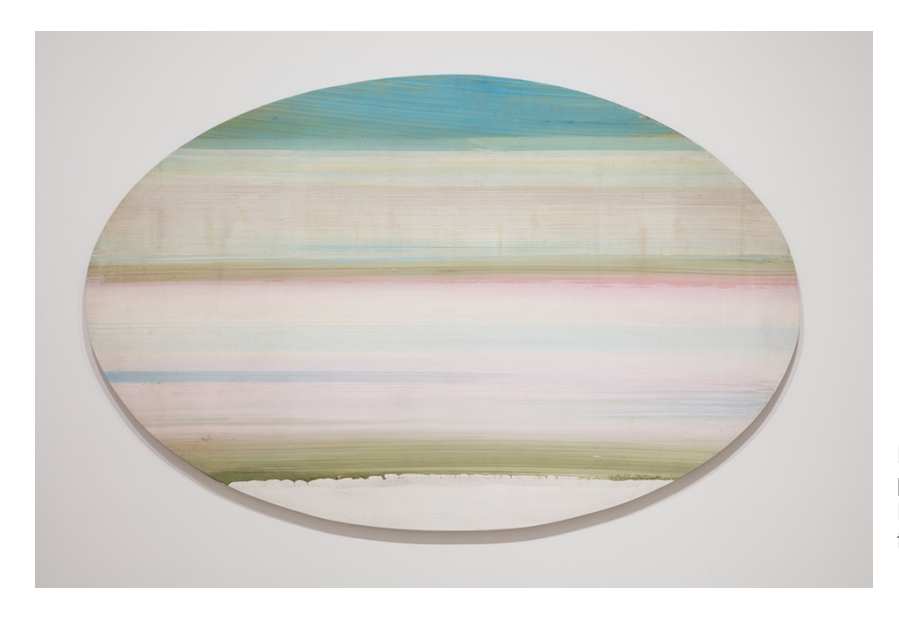
Ed Clark. Yenom (#9), Acrylic paint on canvas

The show also makes a point of accentuating the different strategies employed by the participating artists. Instead of brush, David Hammons coats himself in grease and prints his body image onto a number of works, the most powerful on view is "Injustice Case," which depicts this inked image bound and gagged on a chair, referencing a courtroom sketch of Black Panther co-founder Bobby Seale. Rather than pursuing a clean canvas, abstract expressionist Ed Clark used a broom to sweep paint across his workspace, adding bits of dirt, hair and studio debris onto his works. Instead of a flat surface, Howardena Pindell created intriguing texture by cutting up a canvas, sewing it back together and adding hole-punched dots and sequences to the surface.