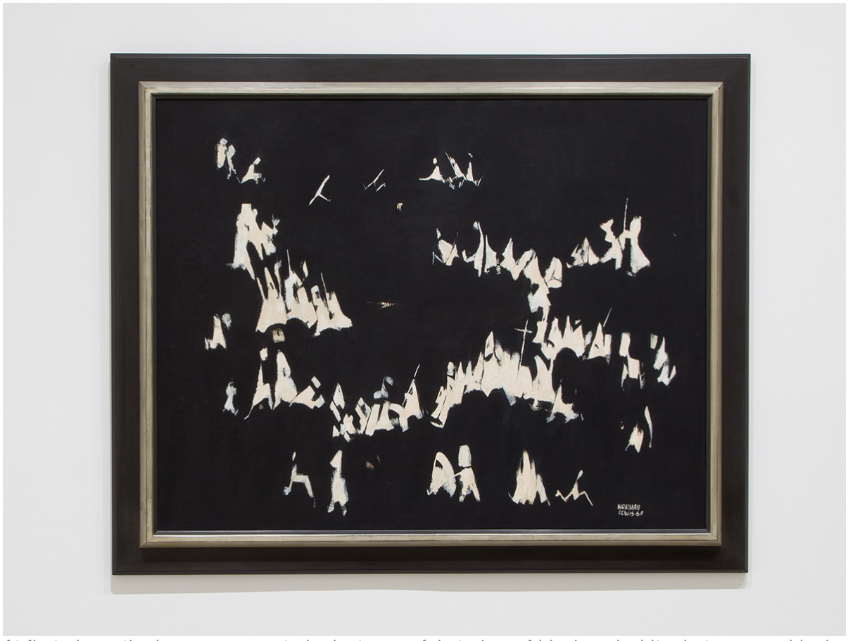
At first glace, the images seems to be just powerful strokes of black and white, but a second look reveals them to be the ghostly sight of a Ku Klux Klan gathering. Norman Lewis, America the Beautiful, 1960. Oil on canvas

In contrast to the Spiral room's minimal black and white palette, the works of Chicago art collective, AfriCOBRA — the African Commune of Bad Relevant Artists — fairly jump out of the walls with its vibrancy and masterful use of color. Silver foil and psychedelic colors make Black Panther members shine in Wadsworth Jarrell's "Liberation Soldiers," while the dancing figures and masked drumming characters of Carolyn Lawrence's "Black Children Keep Your Spirits Free" is a reminder to parents that heritage isn't something to swept under the rug.