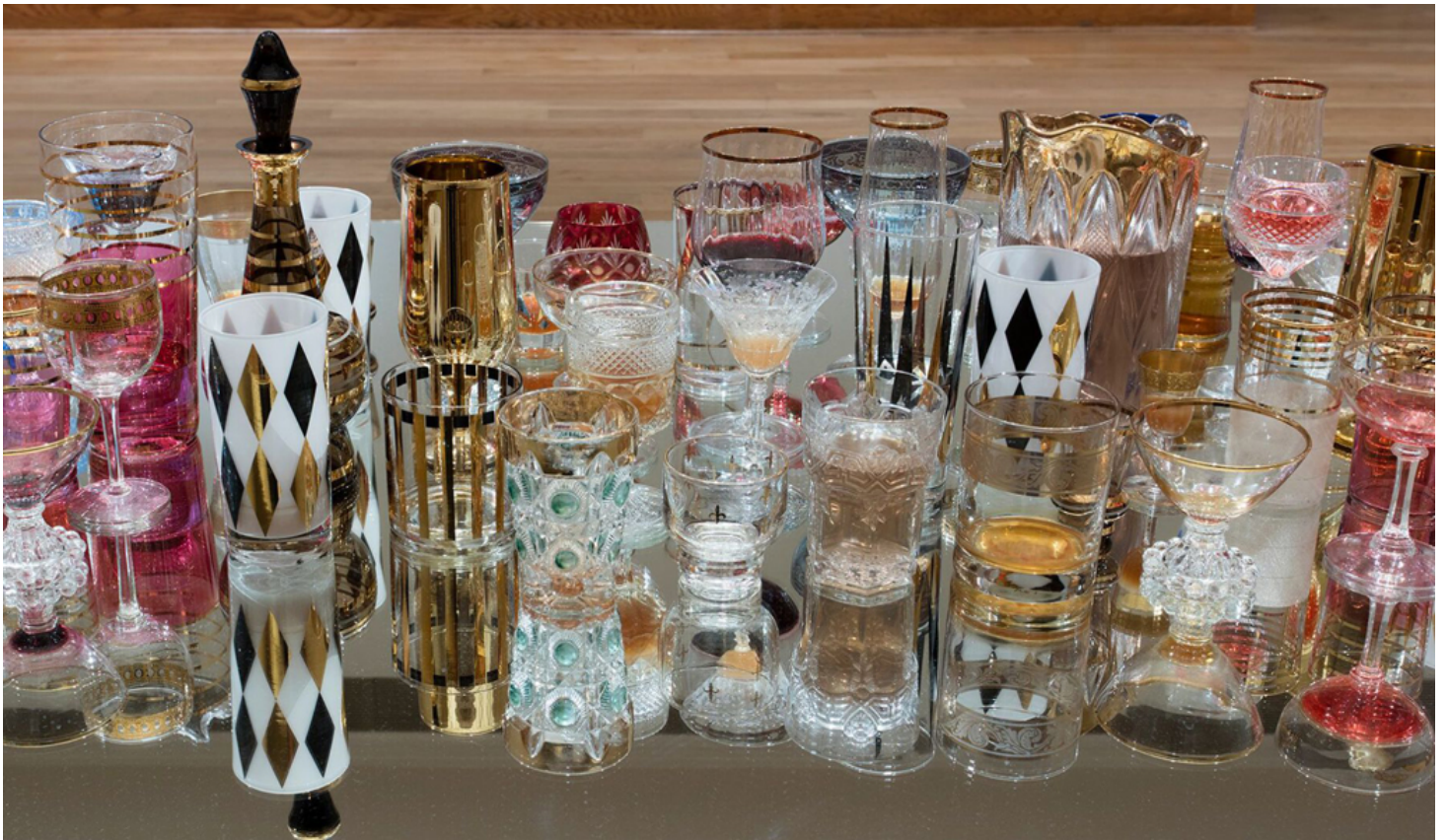
Valeska Soares, Finale (detail), 2013, antique table, mirror, antique glasses, and liquor.

COURTESY THE ARTIST AND ALEXANDER GRAY ASSOCIATES