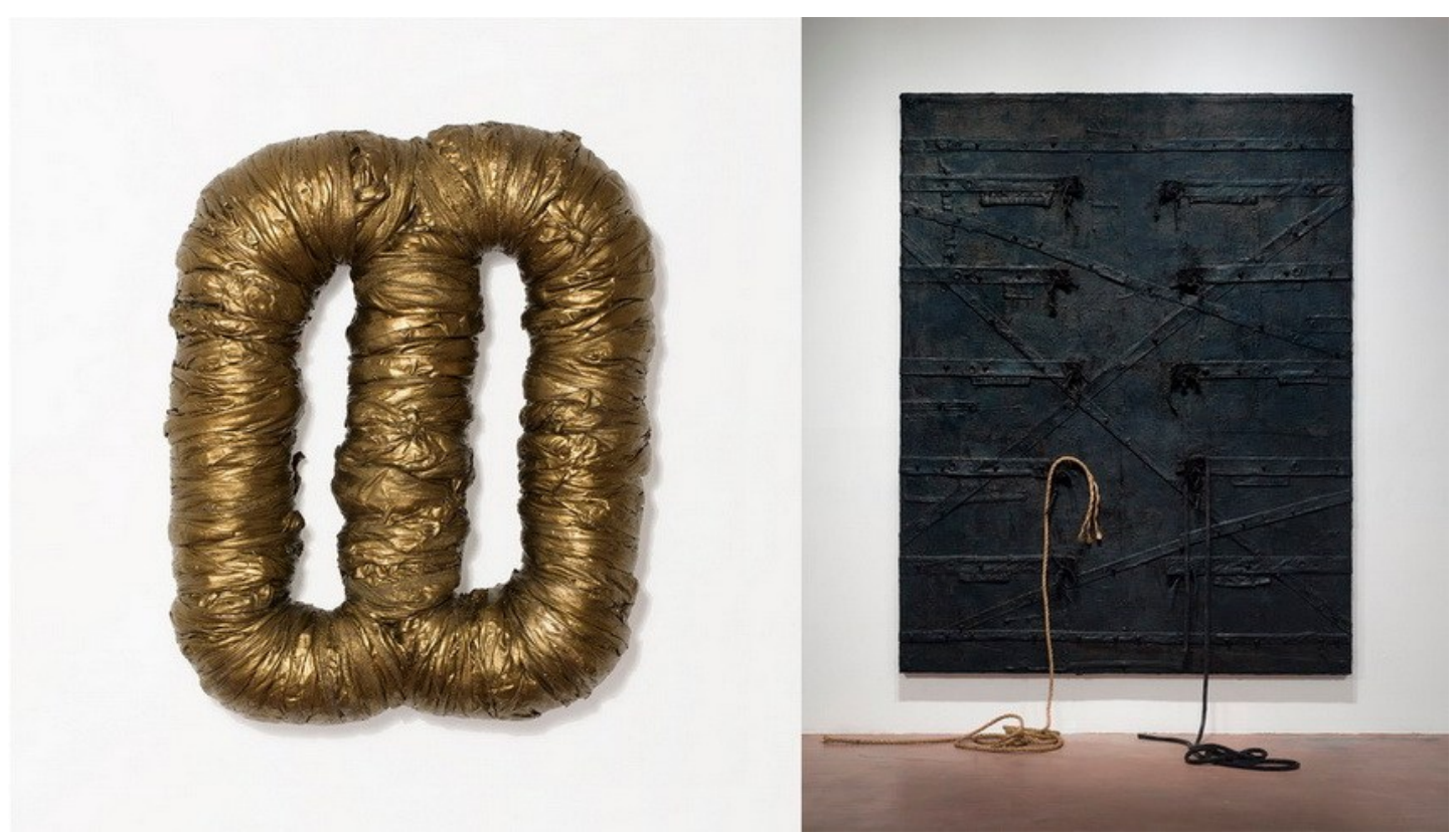
Left: Harmony Hammond – Dogon, 1978/2015. Cloth, wood, acrylic paint, 39 x 34 in; 99.06 x 86.36 cm / Right: Harmony Hammond – Rib, 2013. Oil and mixed media on canvas, 90 3/8 x 72 1/2 in.; 229.55 x 184.15 cm. © 2018 Harmony Hammond / Licensed by VAGA at Artists Rights Society (ARS), NY.

heritage of women's crafts, as well as for her curatorial practice and activism. In order to analyze her entire oeuvre, The Aldrich Contemporary Art Museum decided to organize the first comprehensive survey of Hammond's work by featuring her earliest painted sculptures and sculpted paintings, mixed-media and large-scale 1980 and 1990 paintings, recent near monochrome works, along with ephemera, and publications.