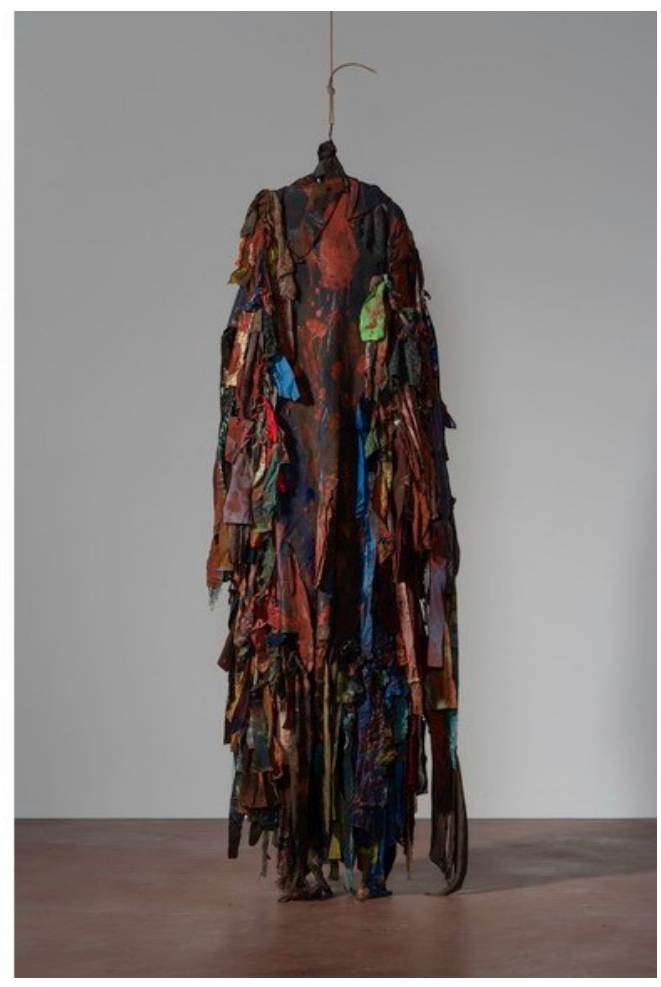
Left: Harmony Hammond – Sieve, 1999. Oil on metal and canvas, 17 x 18 1/2 in; 43.18 x 46.99 cm. Collection of Barbara Johnson and Ruth Gresser © 2018 Harmony Hammond / Licensed by VAGA at Artists Rights Society (ARS), NY. Right: Harmony Hammond – Presence V, 1972. Acrylic, dye, cloth with rope, metal and wood, 78 x 28 in.; 198.12 x 71.12 cm. Courtesy of the artist and Alexander Gray Associates, New York © 2018 Harmony Hammond / Licensed by VAGA at Artists Rights Society (ARS), NY.