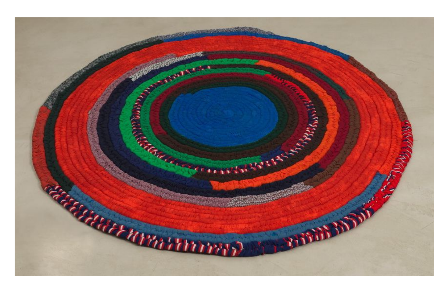
Harmony Hammond – Floorpiece VI, 1973. Acrylic on fabric 65 in. diameter (165.10 cm diameter). © 2018 Harmony Hammond /Licensed by VAGA at Artists Rights Society (ARS), NY.