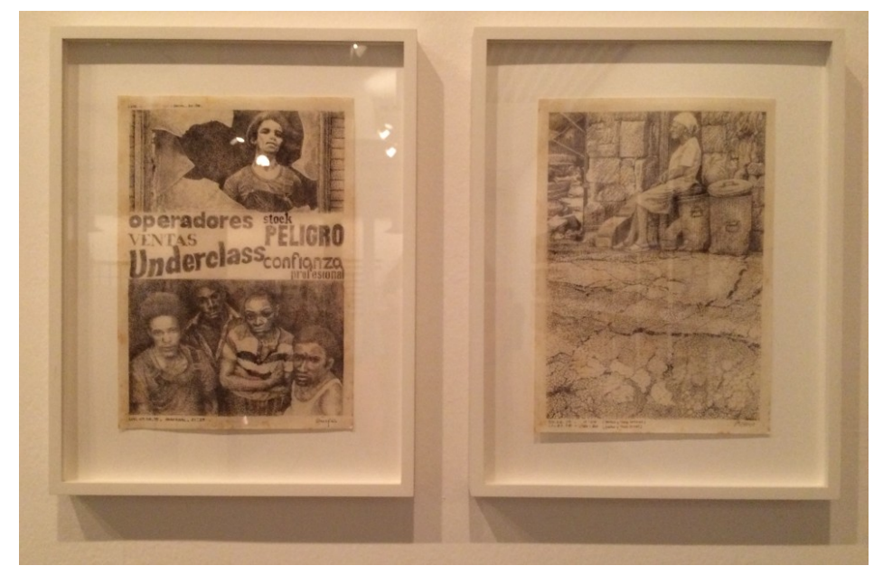
Untitled 26.02,1974, 1974 and Sin título (Untitled), 1974, ink on paper

A couple of her latest drawings, made between 2012 and 2014, are shown at the biennial as well. Like her older drawings this series too seem the result of a wish to capture, to represent in a strict and objective way. The dates and hours of her working schedule are meticulously noted on the sheet again to begin with. Furthermore one quickly notices that the drawings are copies and literally record something. Children's drawings for example of which the historical aura of, in this case, the seventies was carefully preserved. Other works derive from newspaper photography, predominantly with a political message and executed in a pointillist, pixel-like style. Although this last description may point into the direction of Burga's fellow compatriot artist Fernando Bryce (Lima, Peru, 1965), and they indeed share their methodology of copying historical reports, Burga's preoccupation with the past here seems to express itself more randomly and less driven by the ambition to focus on forgotten histories as is the case in Bryce's work. Stylistically their work is miles apart as well.