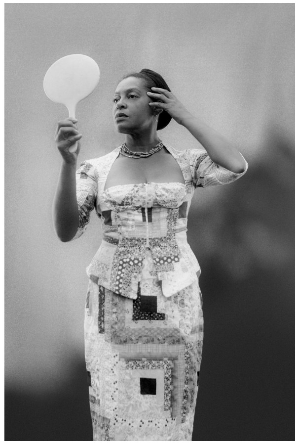
"I Looked and Looked but Failed to See What so Terrified You," a 2003 photograph by the American artist Carrie Mae Weems.