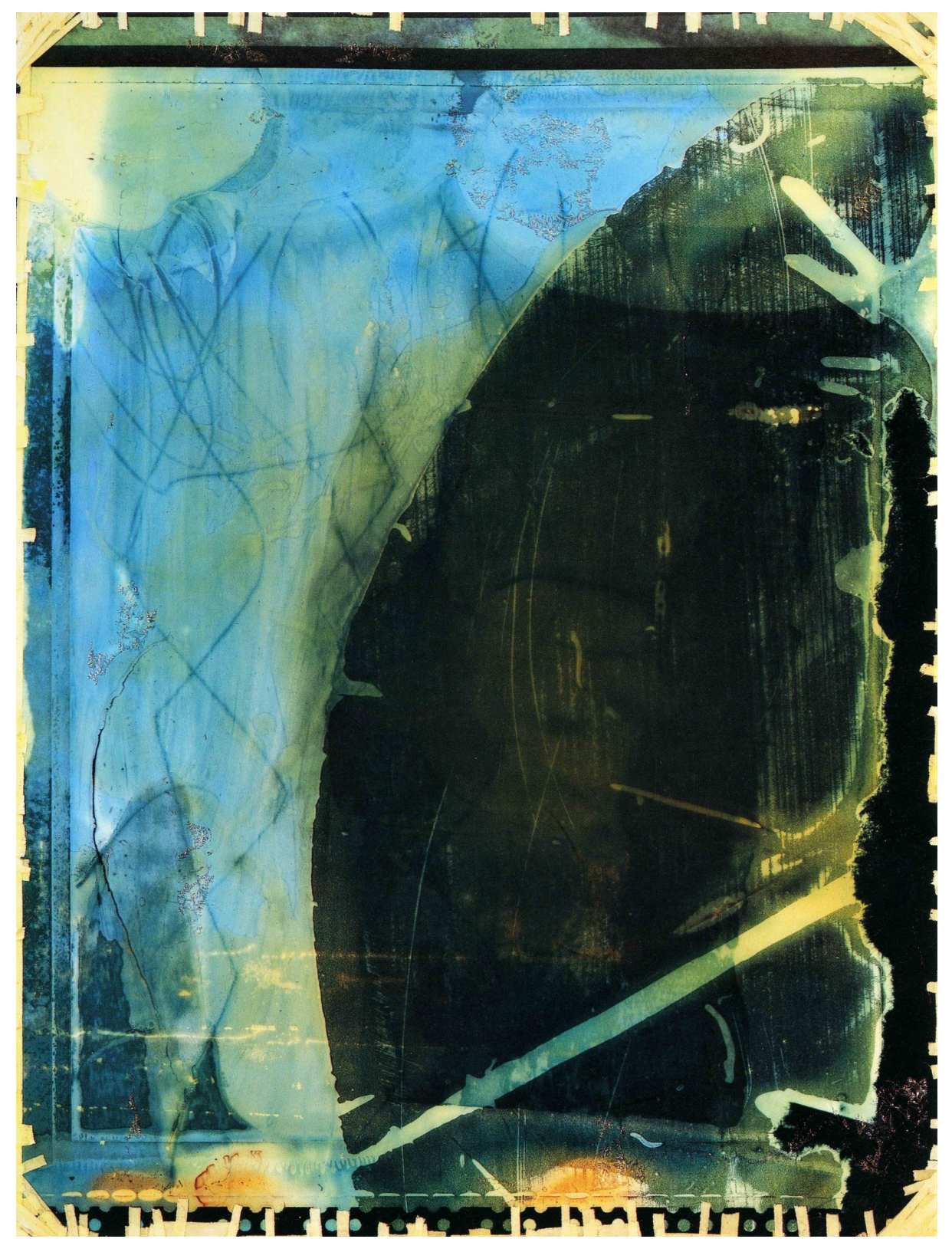
"Retina #21" (1990) by Shinro Ohtake. Some 284 deaders from 33 countries will be present at the Art Basel fair.

Shinro Ohtake, courtesy of Take Ninagawa, Tokyo/Photo by: Kei Okano