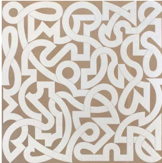
Valerie Jaudon, Ostinato , (2014).