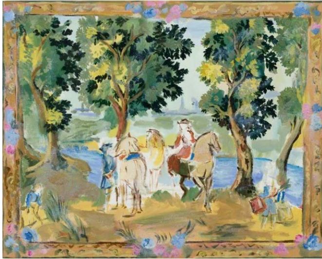
Karen Kilimnik, Going off to the Battle tapestry - off to a glittering start , 2015.

Cheim & Read, 547 West 25 Street, New York, 6-8 p.m.