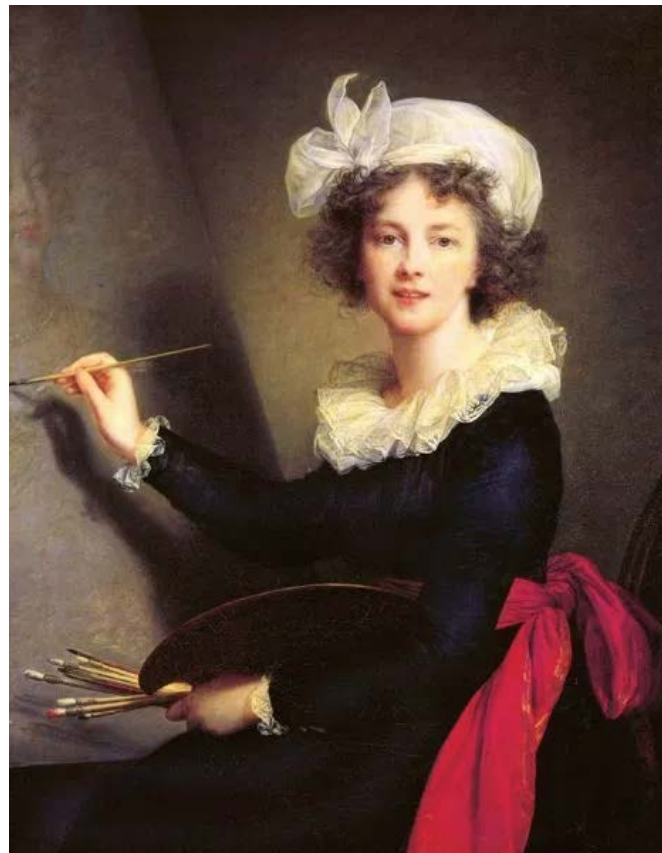
Elisabeth Louise Vigée Le Brun, Self-portrait, (1790).