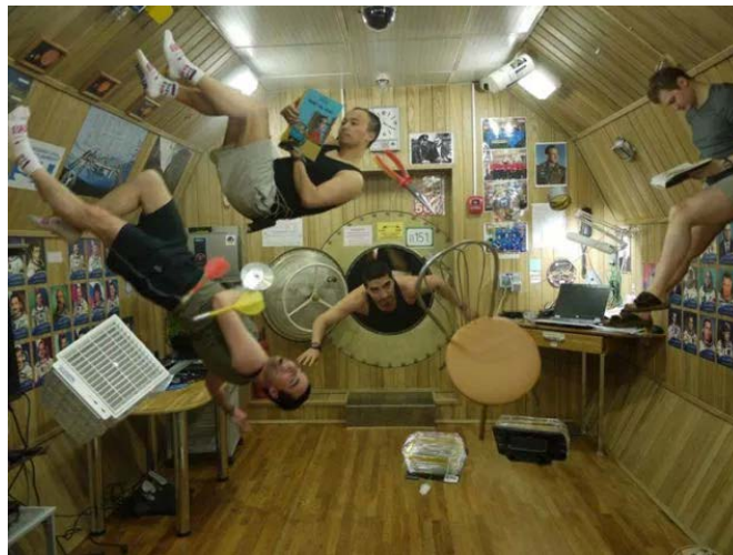
Mars500, Collaboration of Russia, China, and the European Space Agency (ESA), Moscow, Russia, (2007 - 2011).

Grey Art Gallery, 32 Waverly Place, Silver Center, Room 301, New York, 7 p.m.