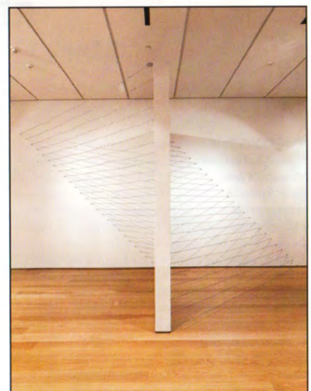
From left: View of "Frank Bowling: Map Paintings," 2015, Dallas Museum of Art. From left: Texas Louise, 1971; Marcia H Travels, 1970. Melvin Edwards, Pyramid Up and Down Pyramid, 1969, barbed wire. Installation view, Nasher Sculpture Center, Dallas.

since been acquired by the Museum of Modern Art in New York). Their scale, meanwhile, marked a shift from the focused intensity of the "Lynch Fragments," 1963-, the small, stark, welded-metal assemblages for which Edwards is perhaps best known. One of the barbed-wire works, the delicate yet imposing Pyramid Up and Down Pyramid, 1969, consists of two pyramidal volumes, one upright, the other inverted, each delineated by strips of wire stretched horizontally across a corner. Corner for Ana, 1970, is similar, though here the shape created by the stretched wires is a triangular prism. Curtain for William and Peter, 1969, originally exhibited in 1969 in a show curated by Bowling for the Art Gallery at Stony Brook University, is a row of single strands of wire hanging from the ceiling, their bottom ends connected by drooping swags of heavy metal chain. And in the final barbed-wire piece, "Look through minds mirror distance and measure time"-Jayne Cortez, 1970, wires are attached to the ceiling at both ends so as to produce a suspended net or hammock.