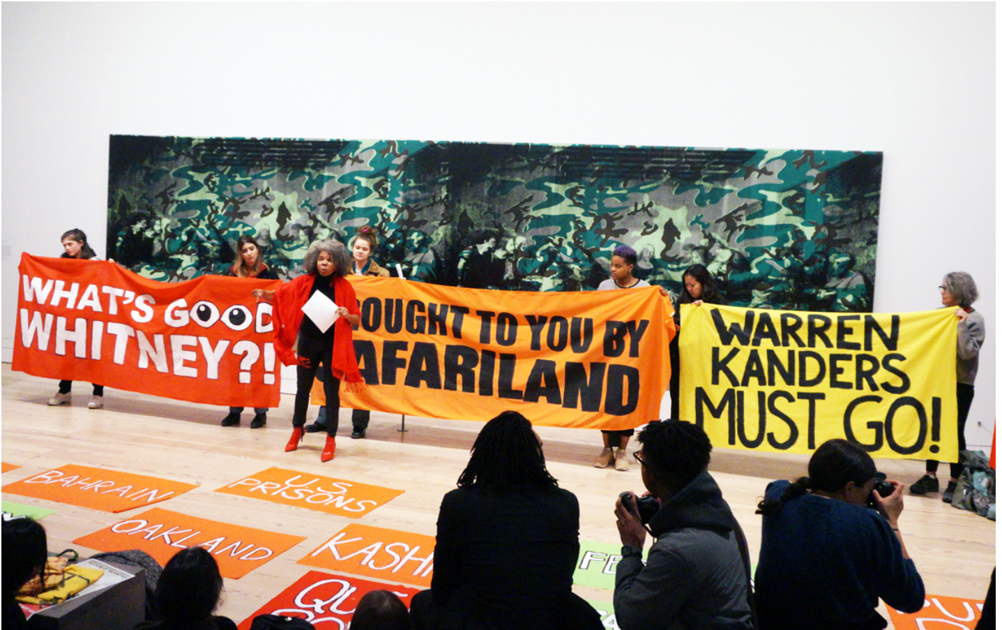
A protest held by Decolonize This Place held at the Whitney Museum on March 22, 2019.