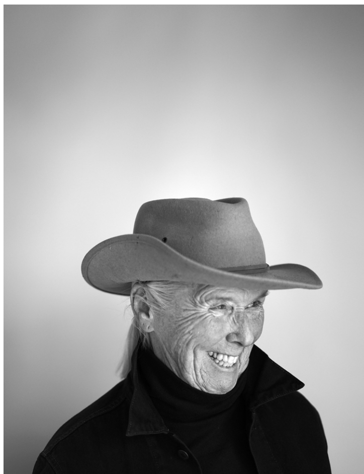
Harmony Hammond, 2019. CLAYTON PORTER

“Hammond’s practice has always shown a profound commitment to bending boundaries and showing their radical energy,” said Amy Smith-Stewart, curator of the Aldrich show, entitled “Material Witness, Five Decades of Art,” on view through September 15. “Now that we are seeing historically conditioned binaries imploding and labels around gender becoming increasingly fluid, it’s more evident than ever how prophetic her vision has been from its very onset and how it has evolved and carried through in these last five decades. She pioneered a visual language that confronted gender, class, and sexual orientation within the higher realms of a painterly abstraction, bridging a sentient and materially rich abstraction with an active social awareness.”